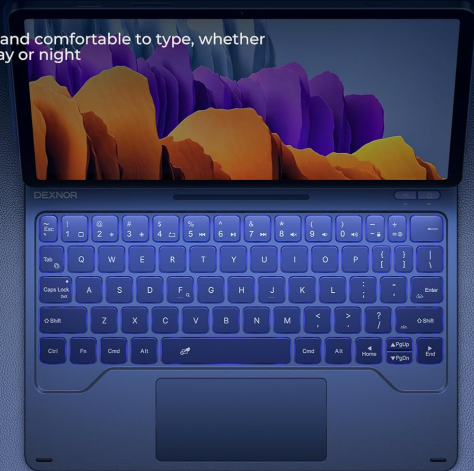
Image 4: Close-up of the keyboard highlighting the 7 backlight modes.

Easy and comfortable to type, whether it's day or night