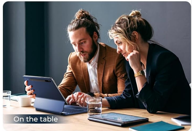
Image 3: Demonstrates the magnetic attachment and adjustable viewing angles of the stand.