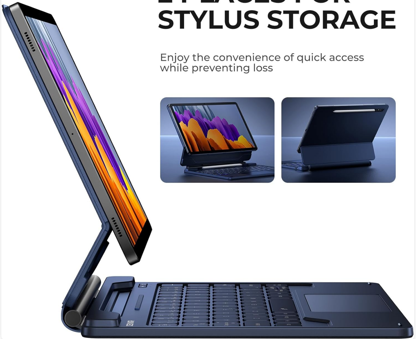
Image 5: Illustrates the two dedicated storage locations for the S Pen.

Enjoy the convenience of quick access while preventing loss