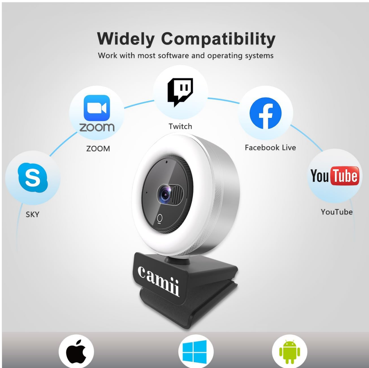
Image 7: The webcam's broad compatibility with popular video conferencing and streaming platforms like Zoom, Twitch, Facebook Live, YouTube, and Skype, across Apple, Windows, and Android operating systems.