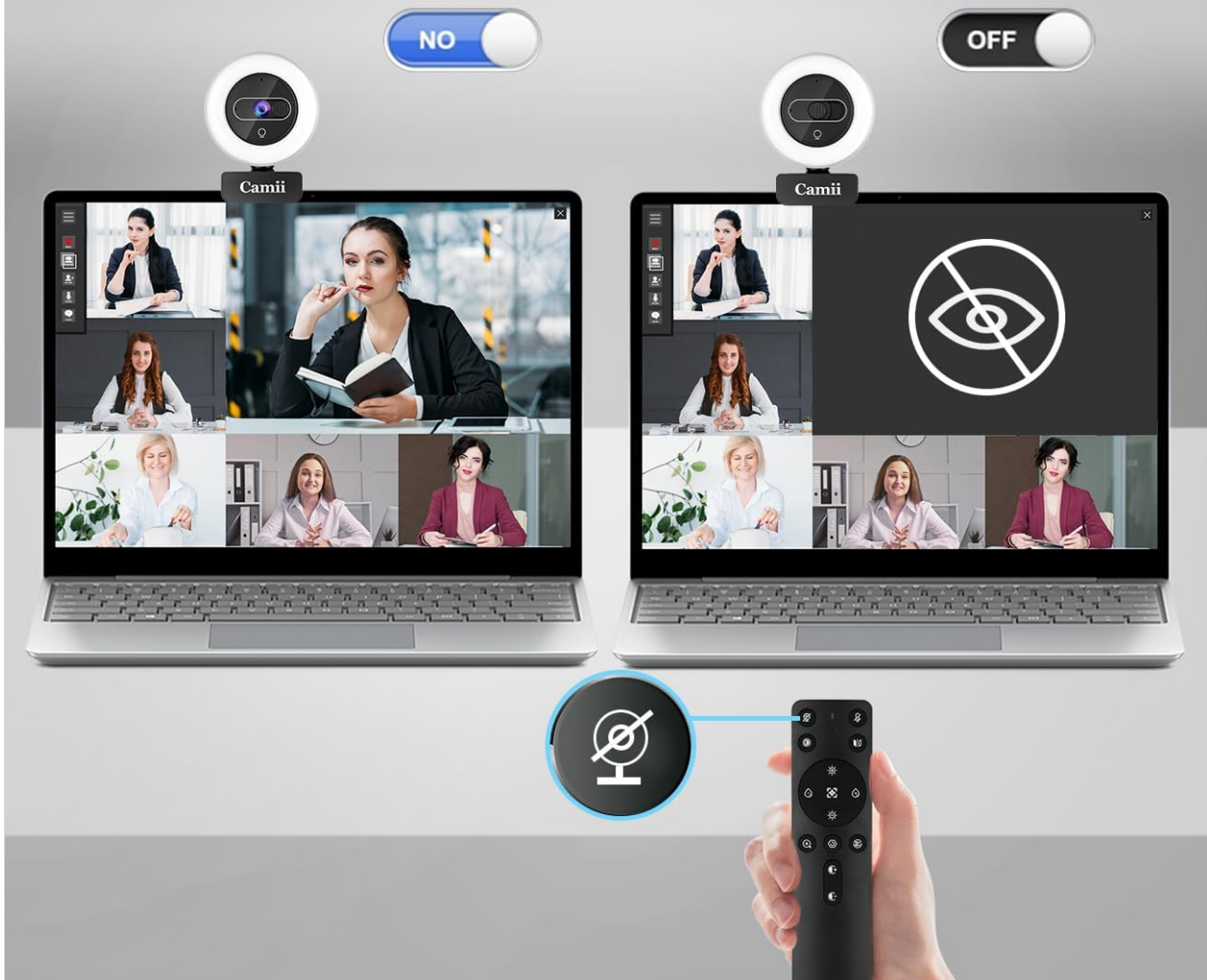
Image 6: Demonstration of the built-in privacy cover and the remote shutdown feature, illustrating how to disable the video feed for privacy.

More shutdown options, easy and reliable privacy protection