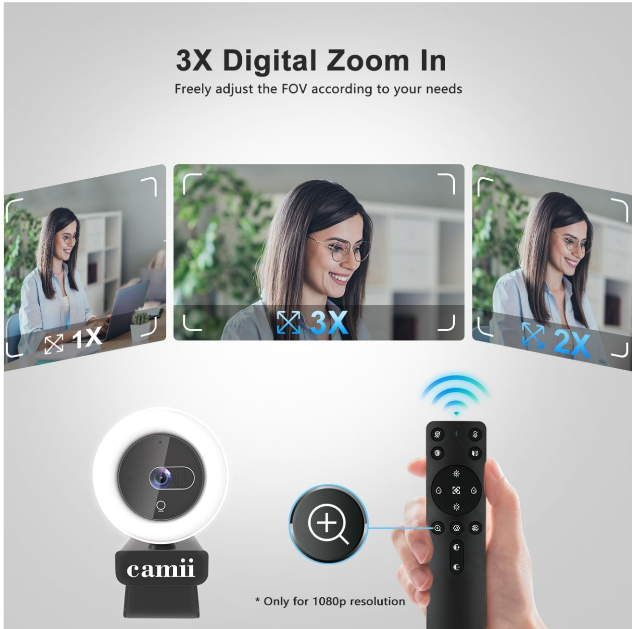
Image 3: The webcam's 3X digital zoom capability, controlled via the remote. This image shows the effect of 1X, 2X, and 3X zoom on the video frame (applicable for 1080p resolution).

The webcam supports 3X digital zoom. This feature allows you to adjust the field of view to focus on specific areas. Note that the 3X digital zoom function is only supported when operating at resolutions lower than 4K (e.g., 1080p).