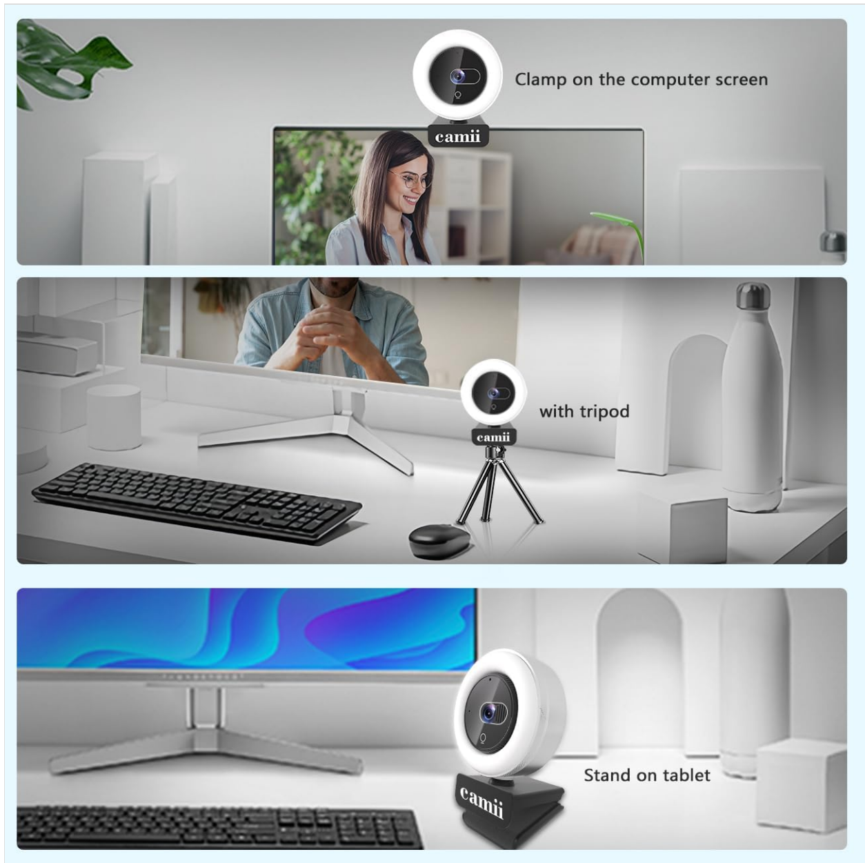
Image 2: Illustration of the Camii 4K Webcam's flexible mounting options, including clamping onto a computer screen, using the provided tripod, and standing on a flat surface.