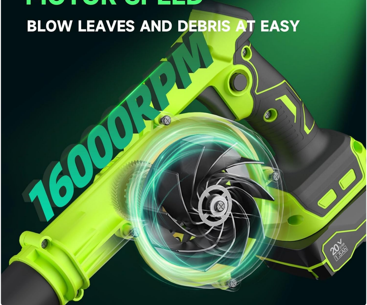
Figure 3.3: Powerful motor for effective clearing.