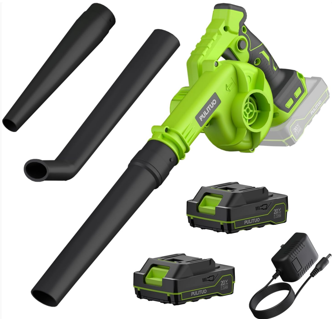
Figure 2.1: Complete package contents of the PULITUO Cordless Leaf Blower.