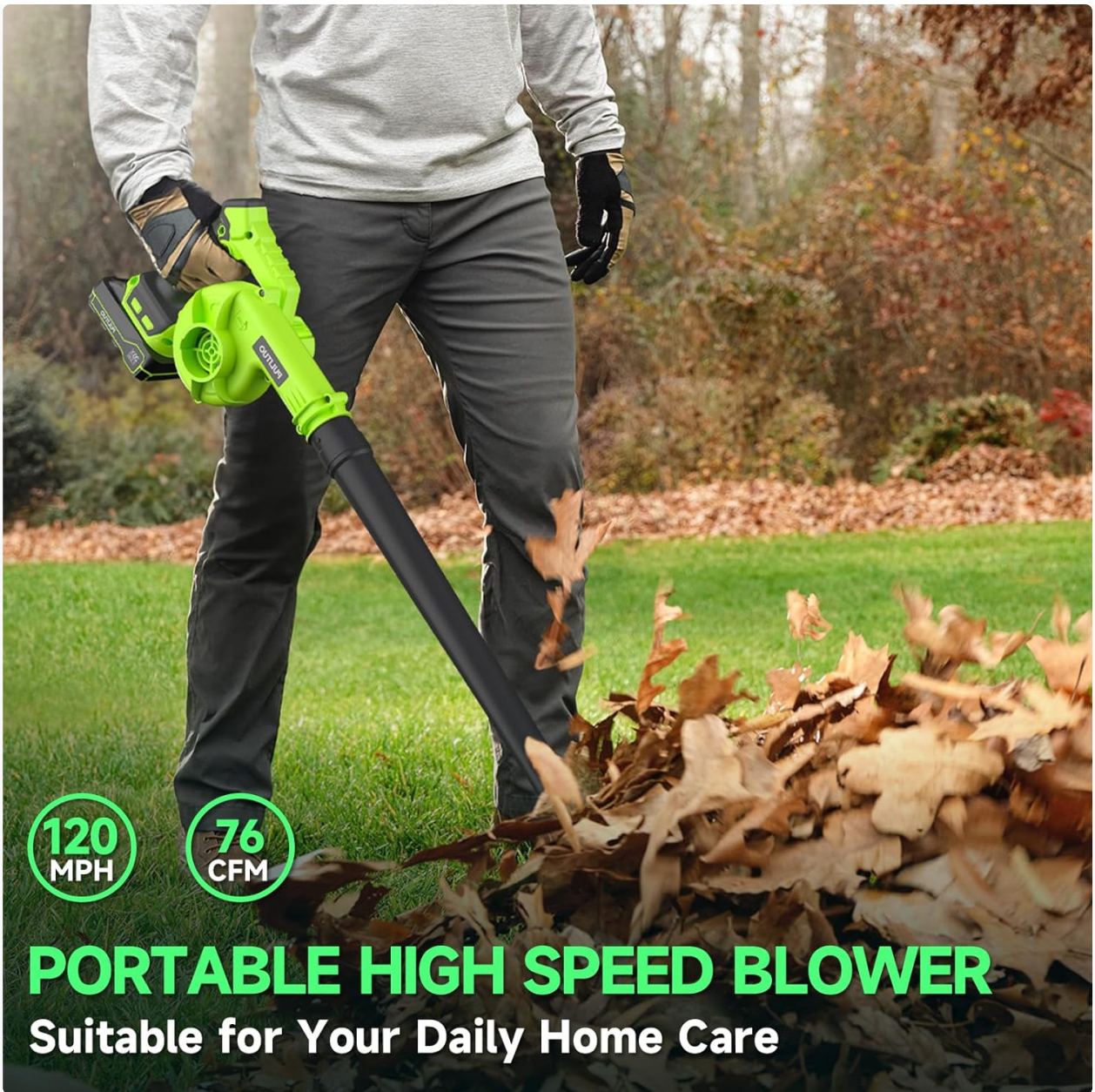
Figure 3.1: High-speed blowing capability of the leaf blower.