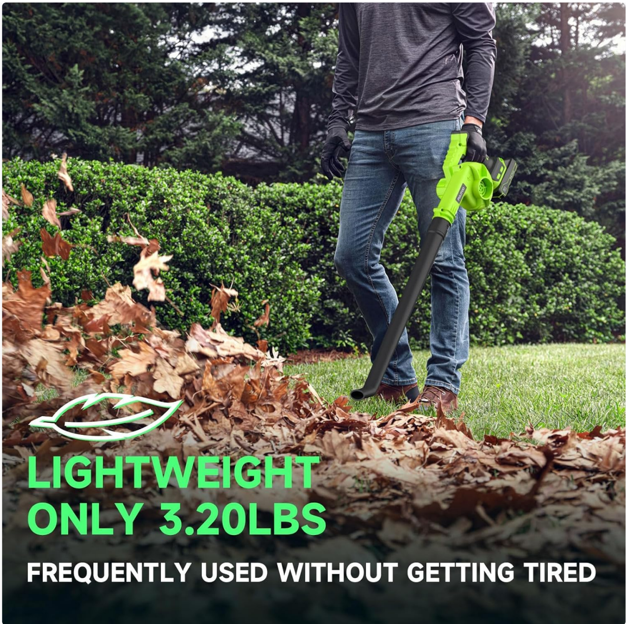
Figure 3.2: Lightweight design for comfortable use.