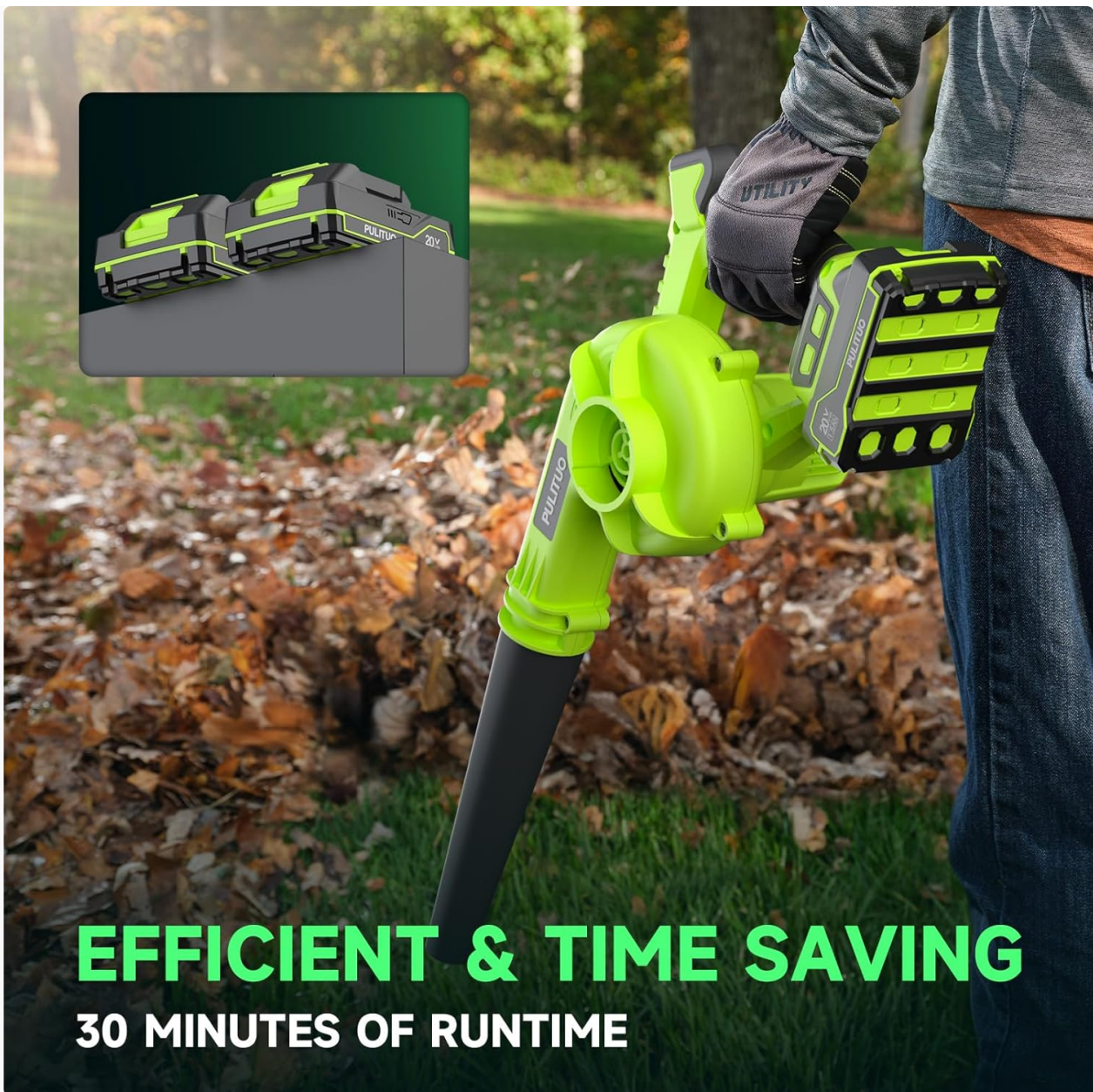
Figure 6.1: Battery runtime and charging indication.