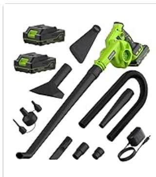
Figure 5.2: Blower function assembly steps.