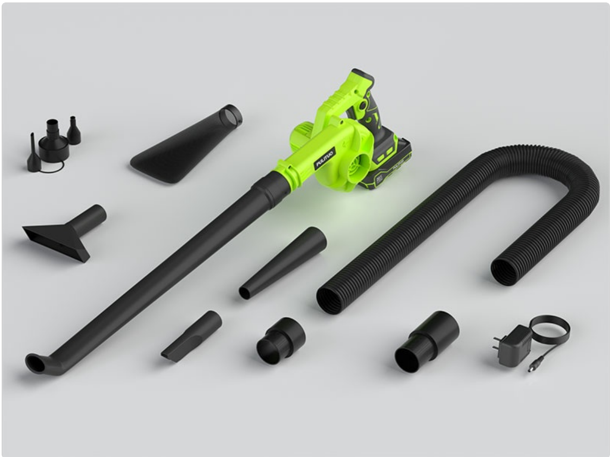
Figure 4.1: Main unit and accessories of the PULITUO 2-in-1 Cordless Leaf Blower and Vacuum.