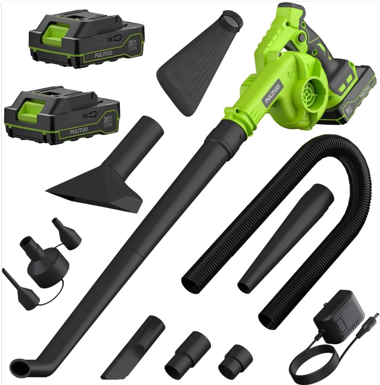
Figure 3.1: All components included with the PULITUO 2-in-1 Cordless Leaf Blower and Vacuum.