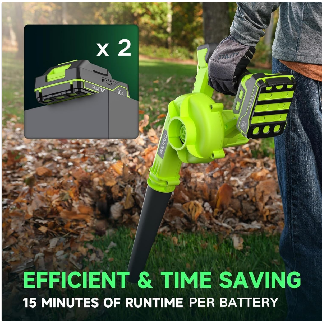
Figure 5.1: Battery installation on the main unit.