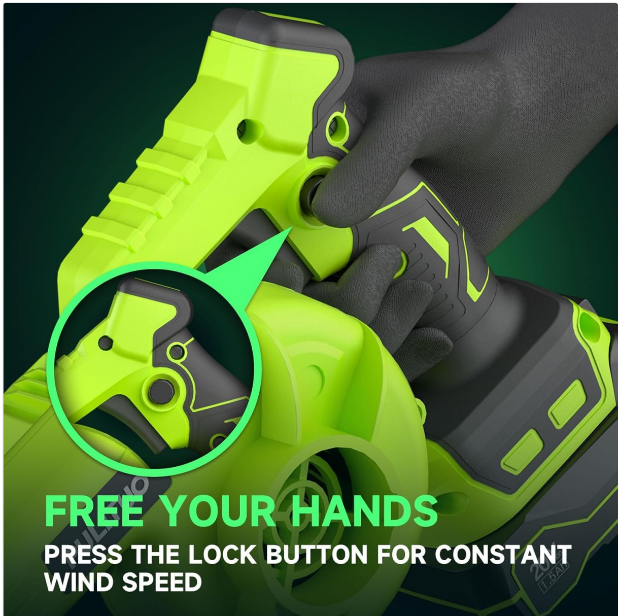
Figure 6.1: Engaging the trigger lock for continuous operation.