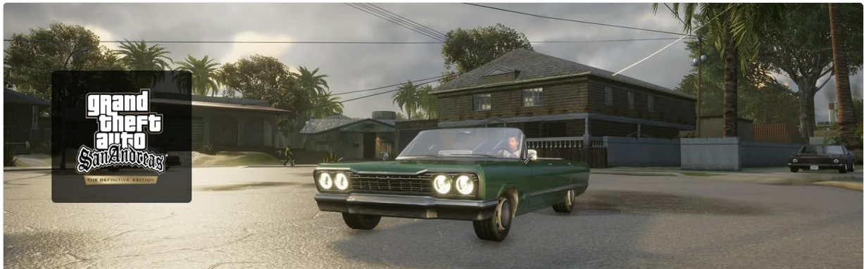
Image 3.4.1: A classic lowrider car driving through a neighborhood in Grand Theft Auto: San Andreas: The Definitive Edition, reflecting the game's setting.

Return to the early 90s as Carl 'CJ' Johnson in Los Santos, San Andreas. CJ's story involves family, gangs, and corruption as he attempts to rebuild his life and protect his loved ones. San Andreas offers a vast open world encompassing three major cities and rural areas, with elements like character customization and gang warfare.