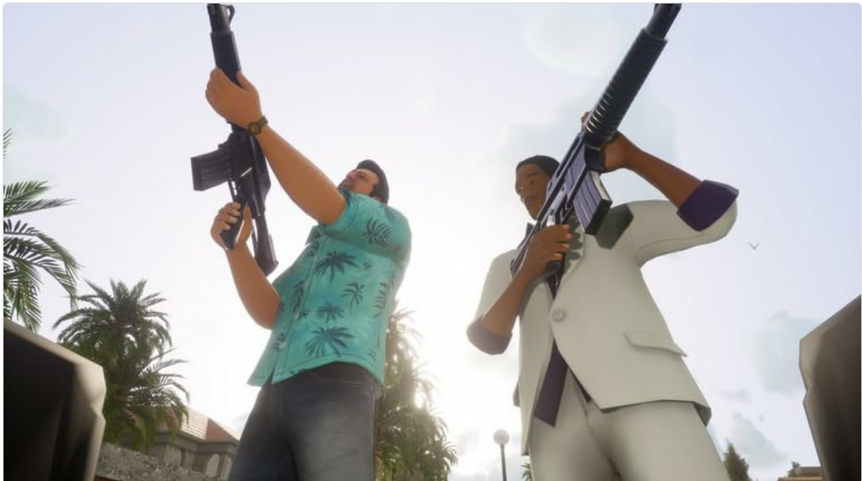
Image 3.4.2: Two characters from Grand Theft Auto: The Trilogy holding firearms, illustrating combat elements within the games.