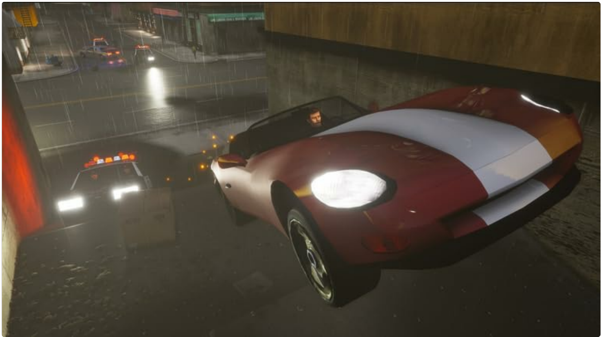
Image 3.4.3: A car chase scene in Grand Theft Auto: The Trilogy, depicting a red sports car evading police vehicles during a rainy sequence.