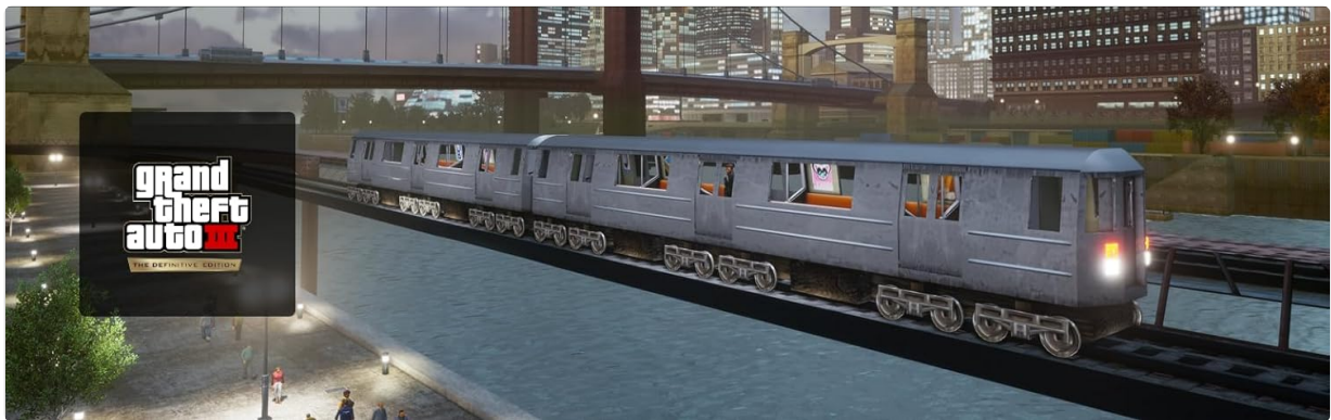
Image 3.2.1: A scene from Grand Theft Auto III: The Definitive Edition, showcasing a train moving through Liberty City with updated graphics.

Experience the origins of the 3D Grand Theft Auto universe in Liberty City. As Claude, navigate a criminal underworld filled with betrayal and opportunity. The game offers an open world environment where players can freely explore, undertake missions, and engage in various activities.