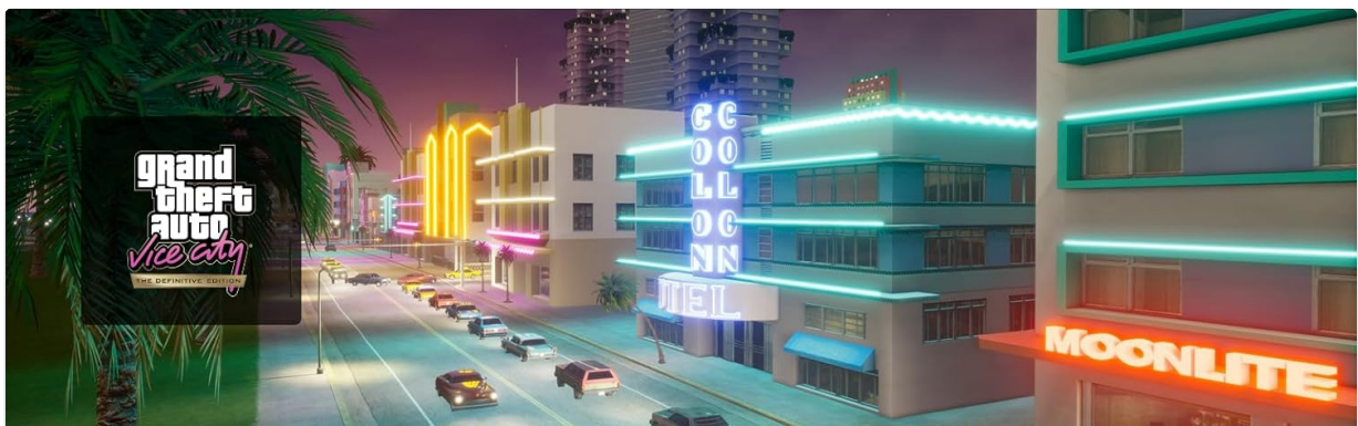
Image 3.3.1: A nighttime street scene in Grand Theft Auto: Vice City: The Definitive Edition, highlighting the city's distinctive architecture and lighting.

Step into the 1980s as Tommy Vercetti in the vibrant, neon-soaked city of Vice City. This installment focuses on Tommy's rise through the criminal ranks, marked by betrayal and revenge. The game features a distinct 80s aesthetic, including music, fashion, and vehicle designs.