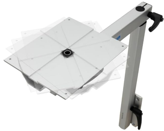
360° TABLE ROTATION