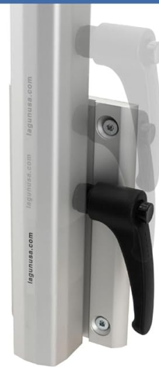
LEG SLIDES UP AND DOWN

Image: Visual representation of the table system's dynamic movements, including 360-degree rotation, horizontal swinging, and vertical height adjustment.