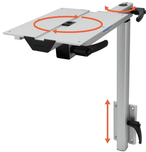
3-WAY CONTROL TABLE SYSTEM