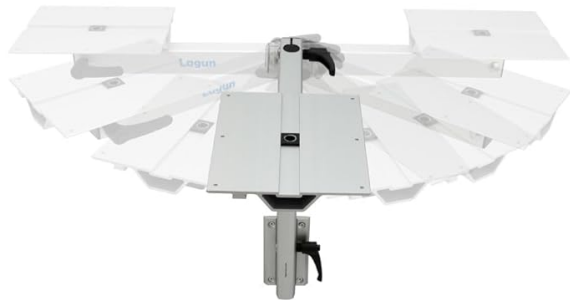
TABLE SWINGS BACK AND FORTH