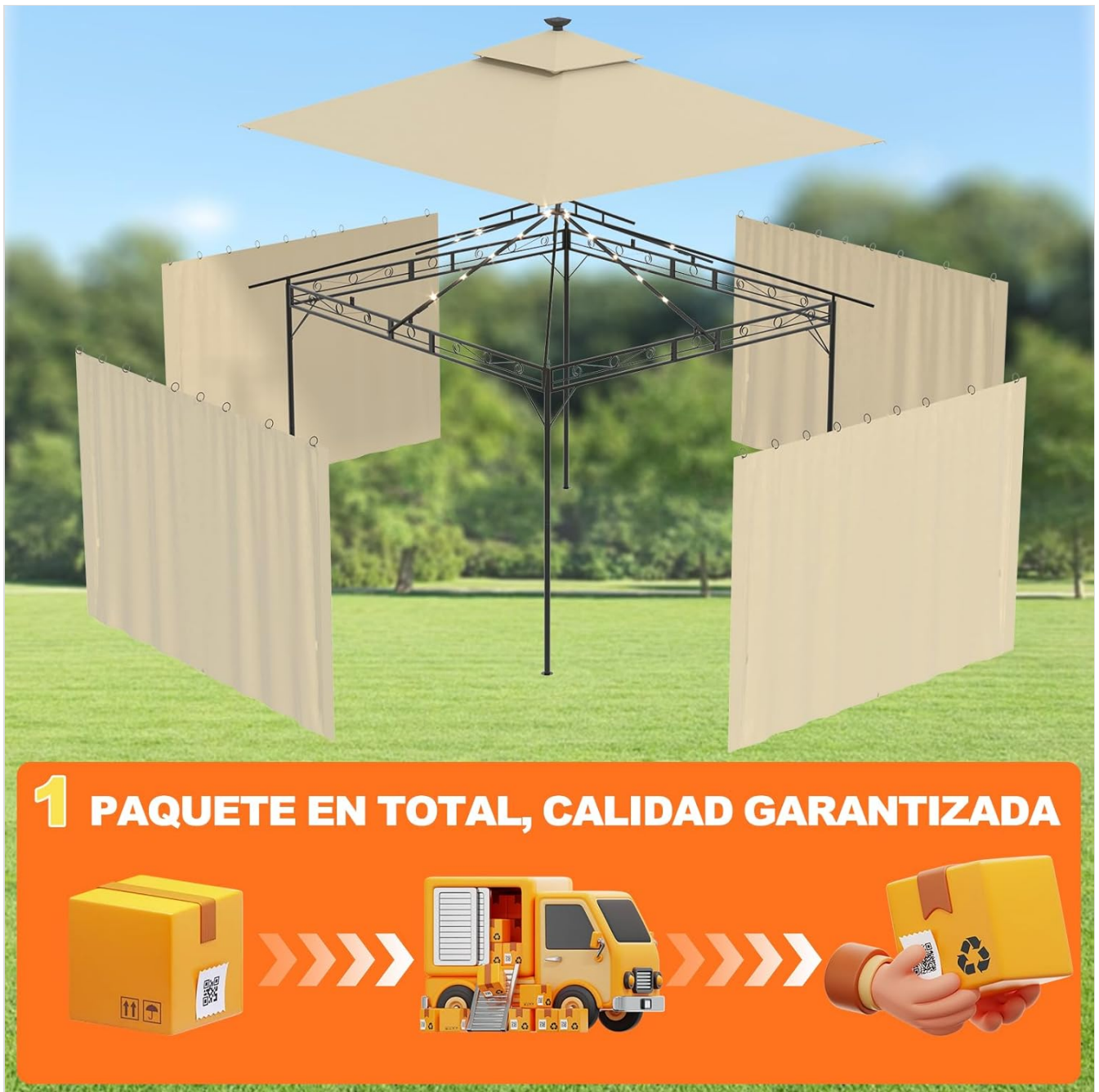
Image: Exploded view of the Devoko gazebo components, showing the frame, canopy, and side panels before assembly.