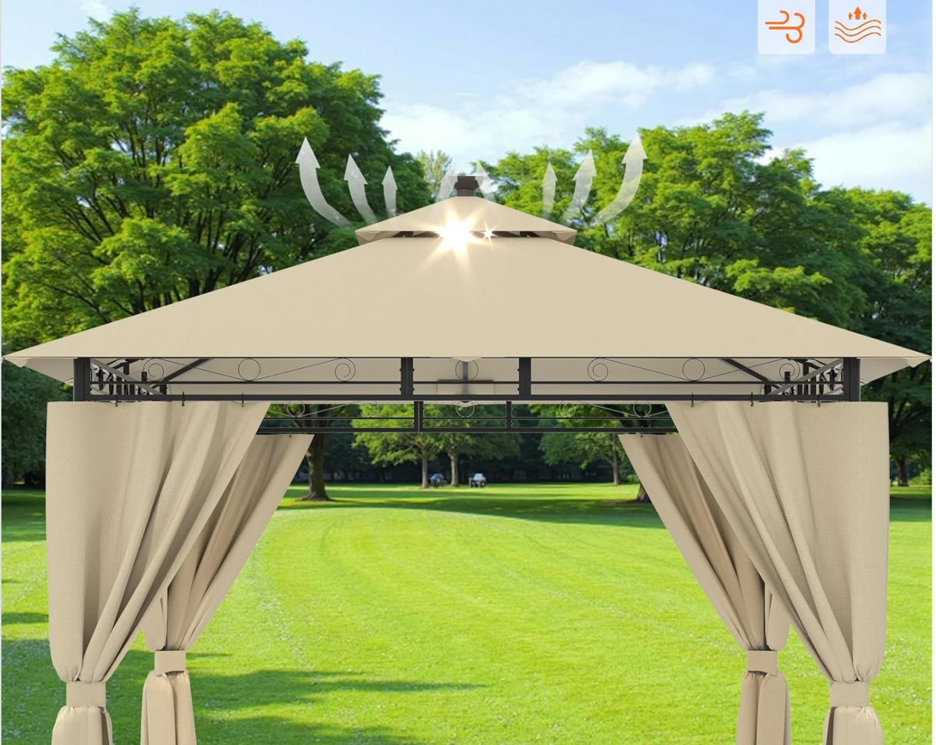
Image: Detail of the gazebo's double-layer roof, designed for effective ventilation.