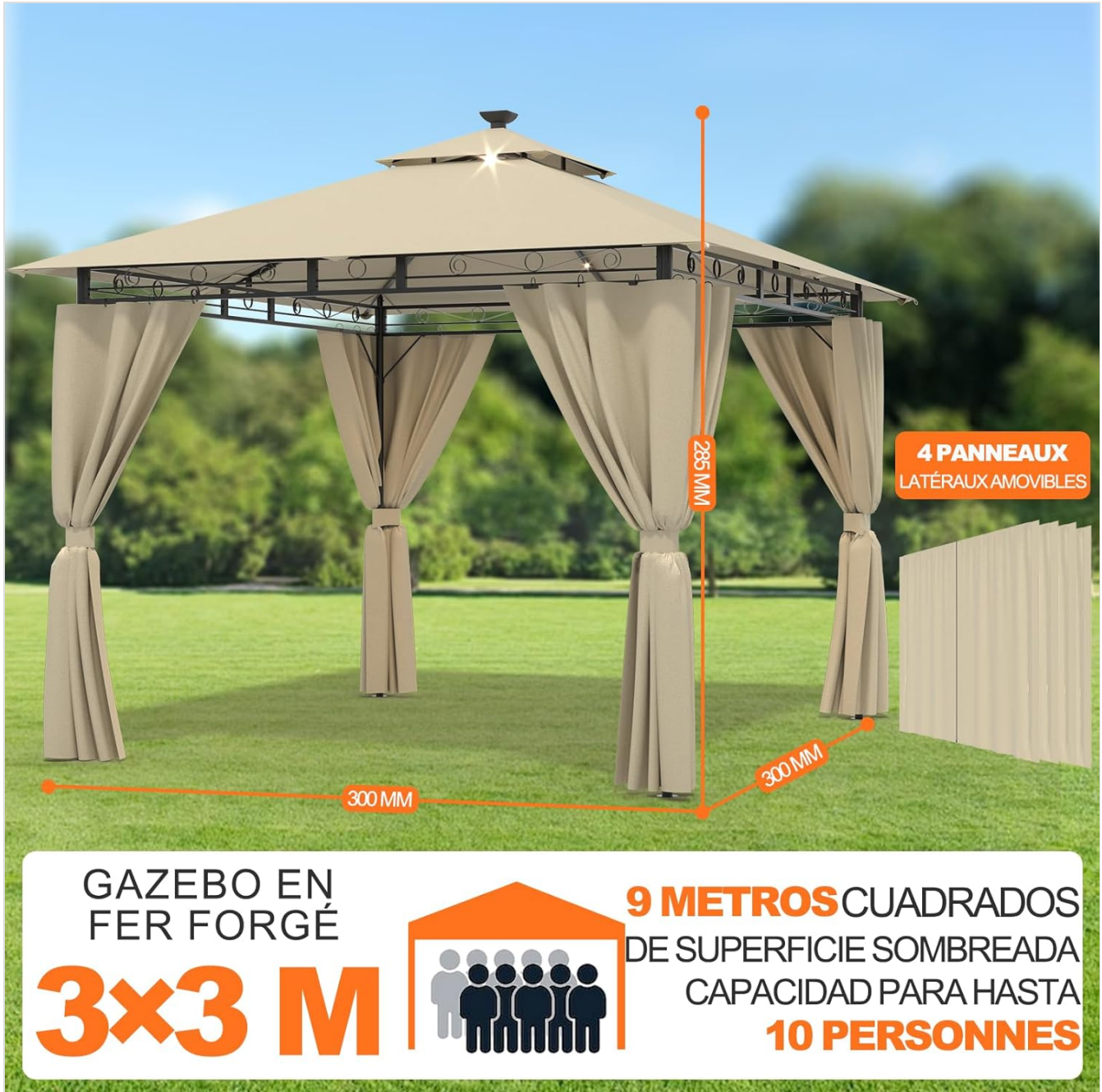
Image: Diagram illustrating the dimensions of the Devoko 3x3m gazebo and its removable side panels.