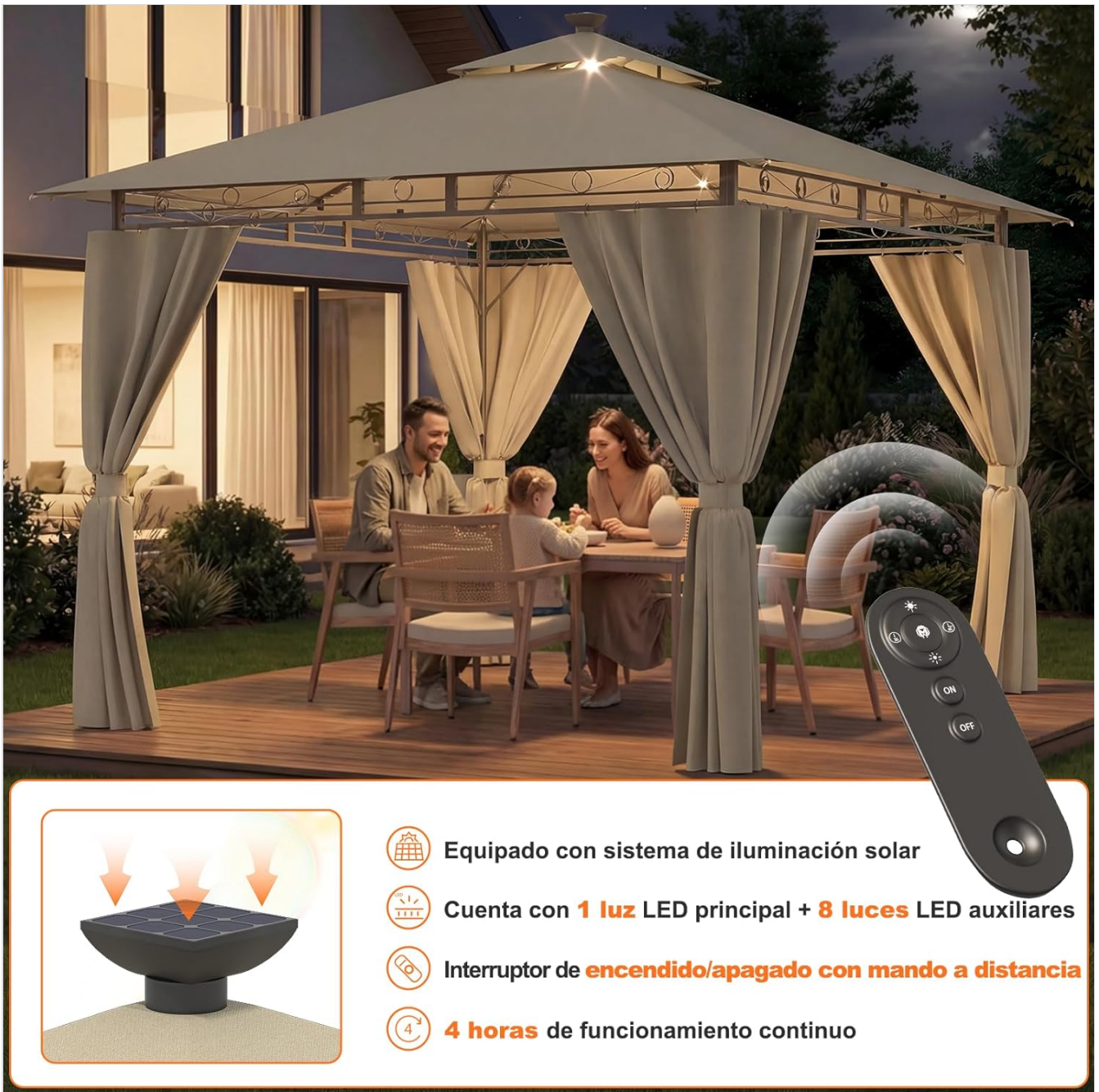
Image: The Devoko gazebo illuminated at night, showcasing the LED lighting system and its remote control.