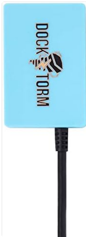
Figure 3.4: Dockzorm Portable USB Hub.