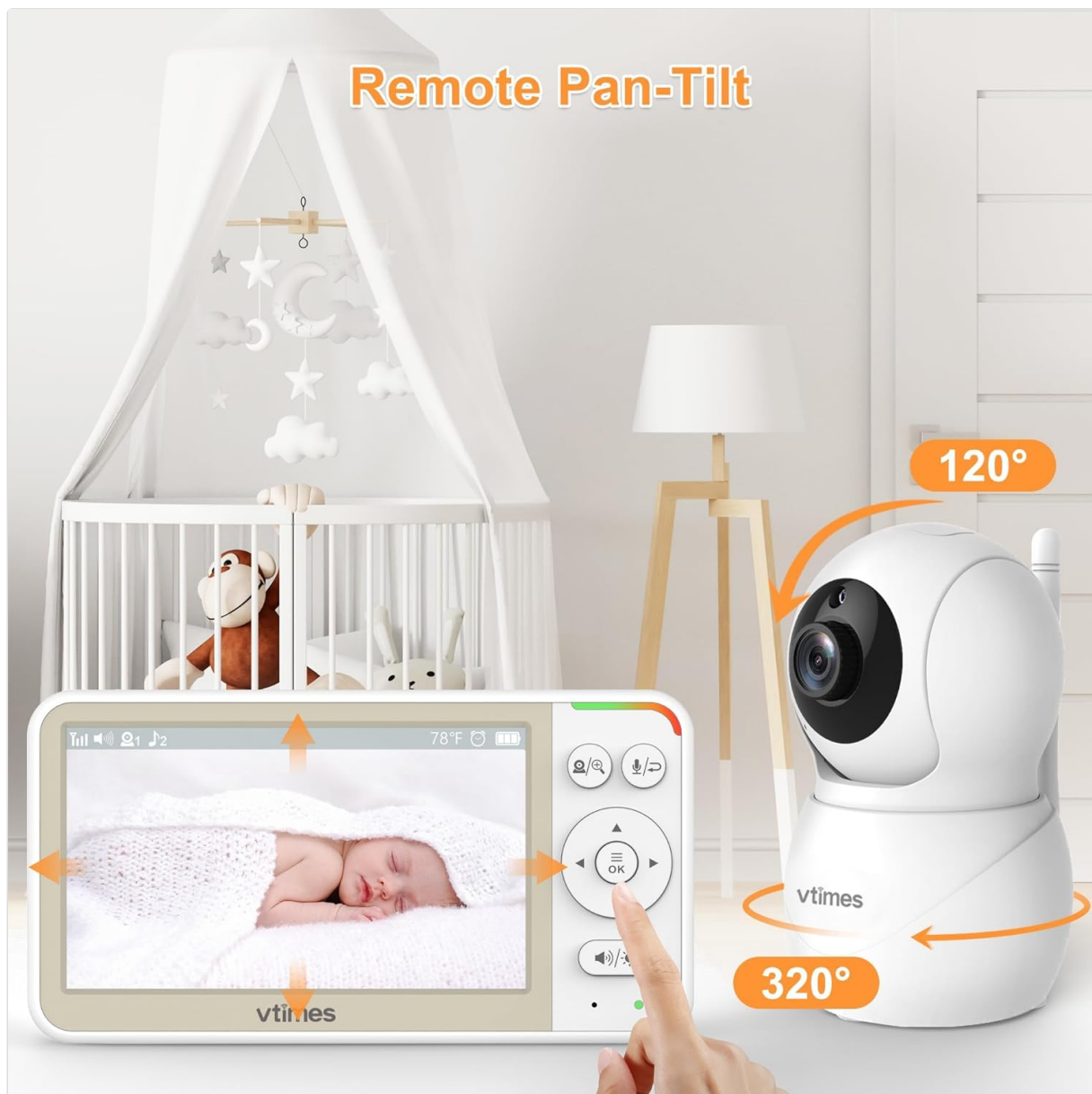
Image 4.1: Camera Unit Placement and Remote Pan-Tilt Functionality