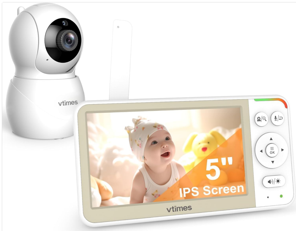
Image 1.1: VTimes 5-inch Screen Video Baby Monitor (Parent Unit and Camera Unit)

This manual provides essential information for the safe and effective operation of your VTimes 5-inch Screen Video Baby Monitor, Model VT506. Please read these instructions thoroughly before use and retain them for future reference.