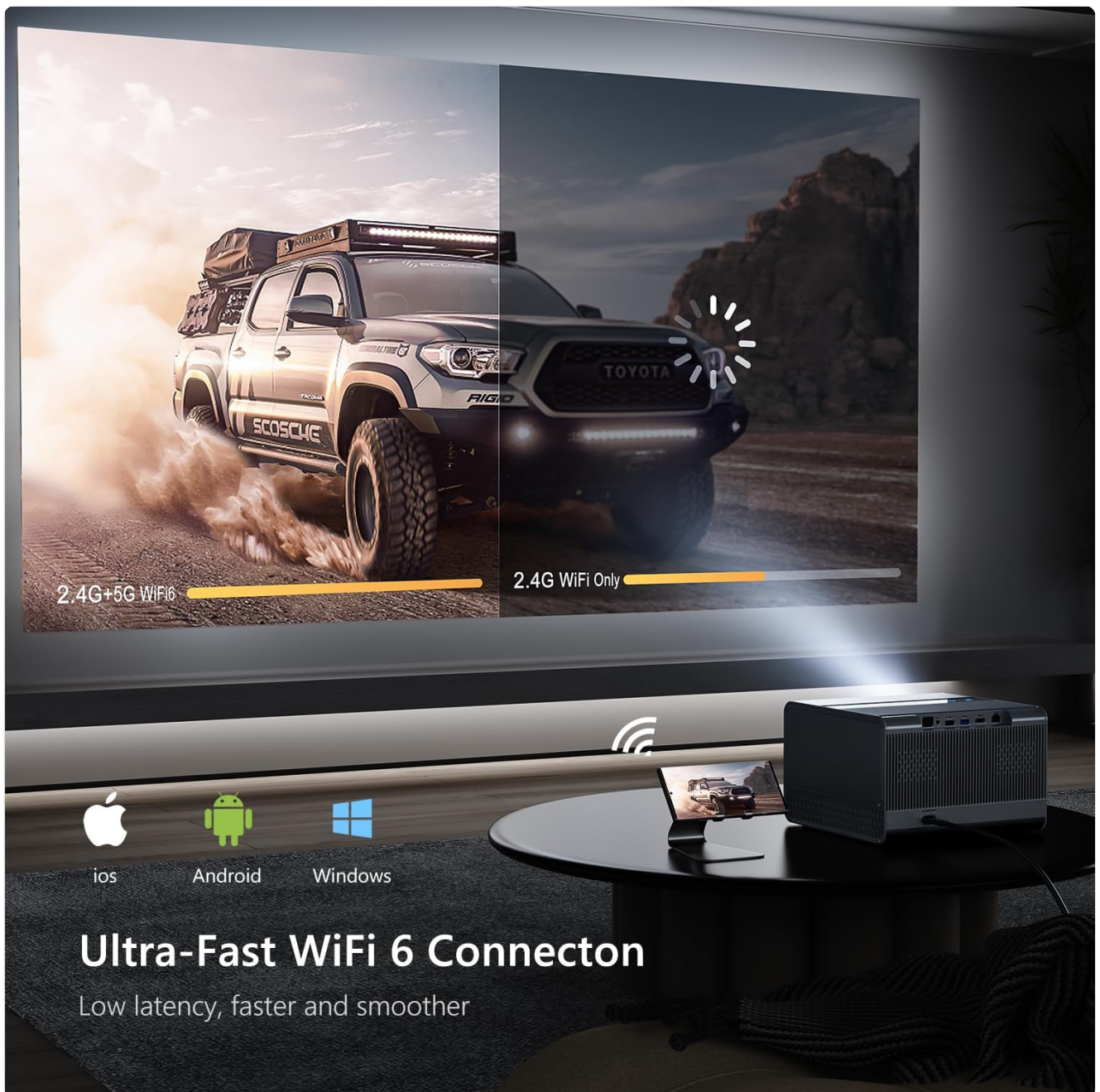
Image: A projector displaying a screen with "2.4G+5G WiFi 6" indicating advanced wireless connectivity, compared to "2.4G WiFi Only". Icons for iOS, Android, and Windows are visible, signifying broad compatibility.