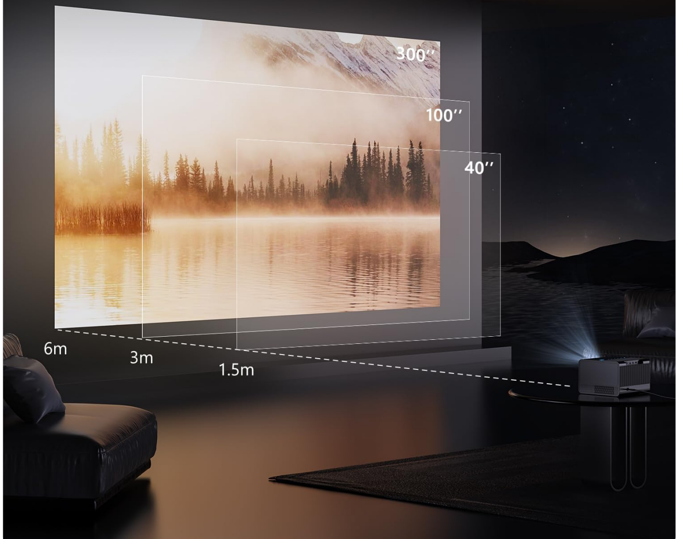
Image: A visual representation of the projector's ability to adjust screen size from 40 inches to 300 inches, illustrating different projection distances and their corresponding screen dimensions.