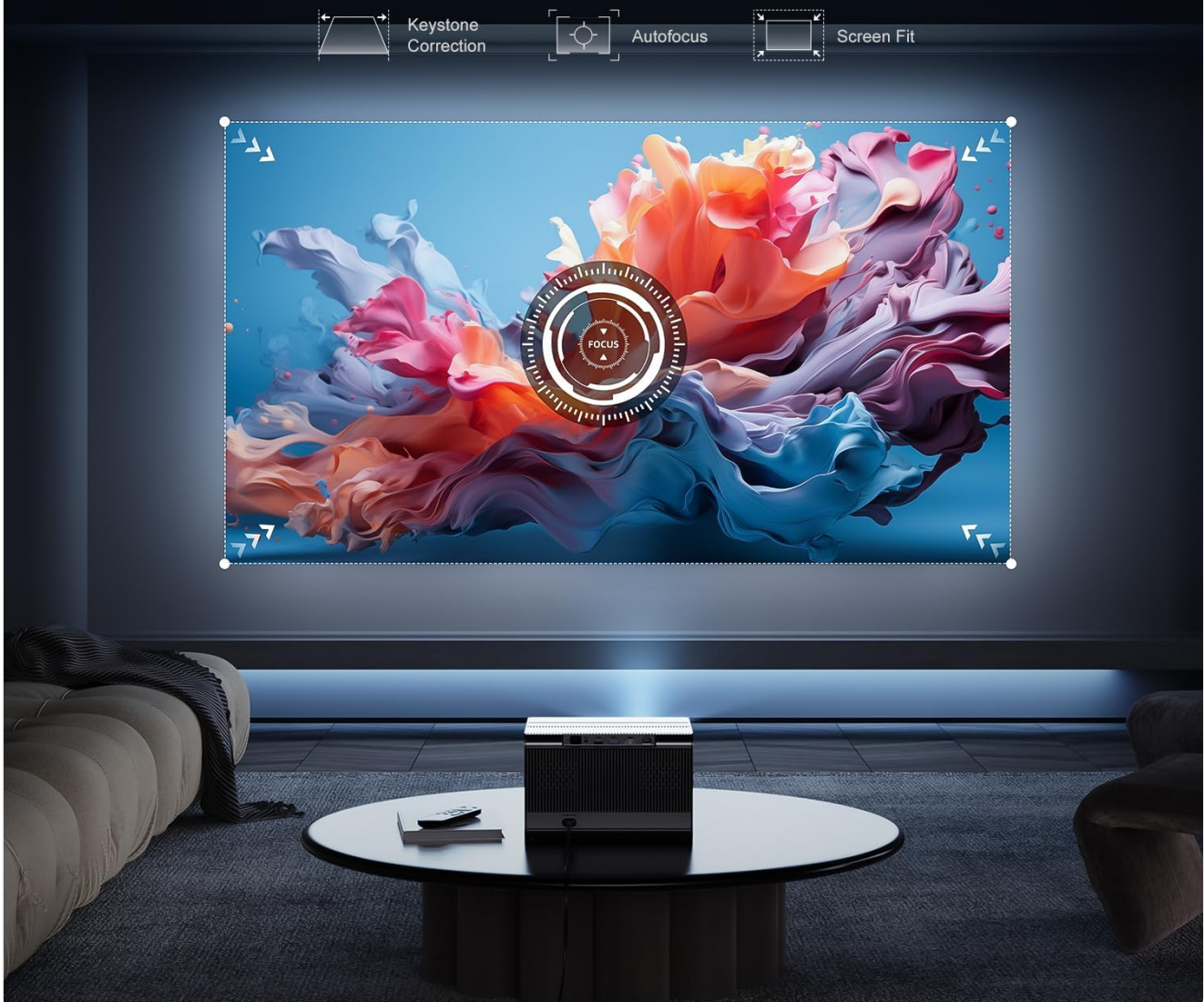
Image: A projector displaying an image on a wall, with visual cues indicating automatic keystone correction, autofocus, and screen fit adjustments. This process ensures a clear and properly shaped projection.

No complication, just 3 easy seconds auto-focuses and auto-keystones your image