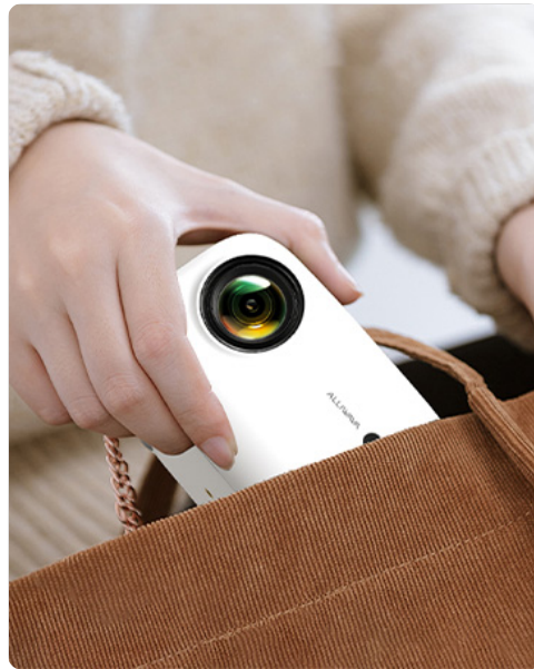
Image: Left: A hand placing the compact ALLIWAVA projector into a bag, demonstrating its portability. Right: Both black and white models of the ALLIWAVA projector displayed on a table, showcasing design variations.