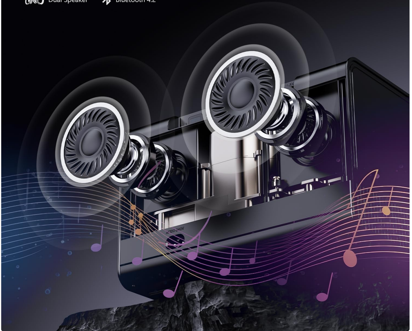
Image: An internal view diagram of the projector highlighting its dual Hi-Fi speakers, emphasizing the immersive audio experience.