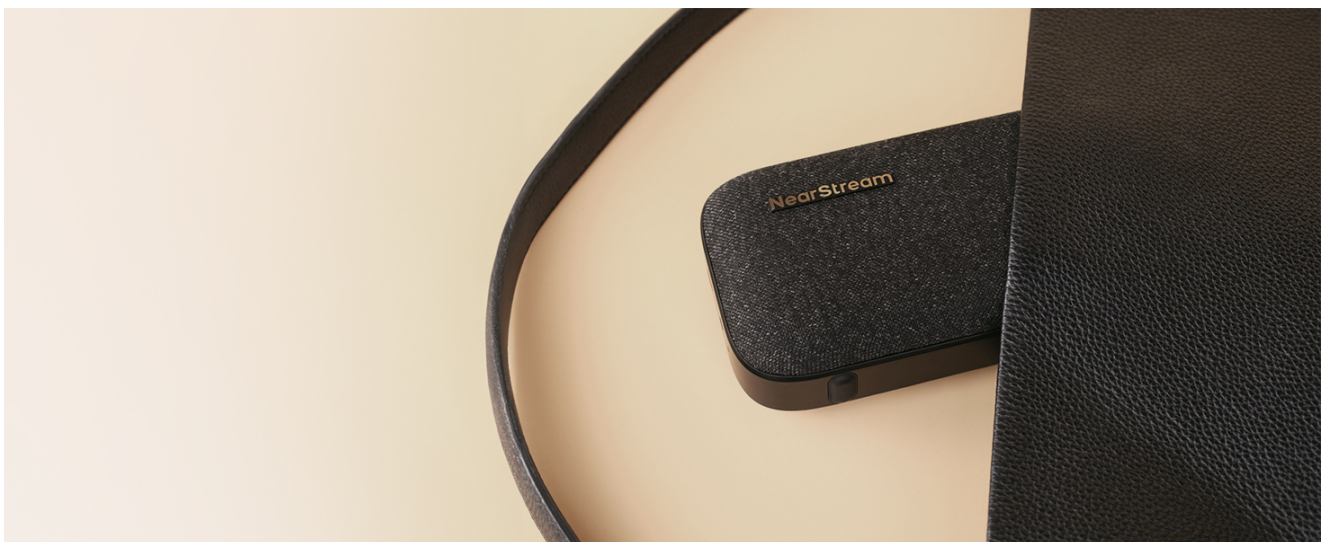
Image: Detailed view of the top panel controls on the NearStream APS10 speaker.