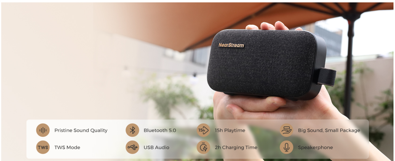
Image: The NearStream APS10 speaker, highlighting its sleek design and audio features.

The NearStream APS10 is a versatile portable Bluetooth speaker designed for high-fidelity audio and clear communication. It features advanced sound technology, multiple connectivity options, and a durable, portable design, making it suitable for various environments from home to outdoor settings.