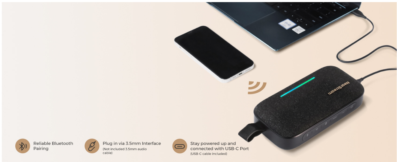
Image: The NearStream APS10 speaker connected to a PC, illustrating its use as a desktop speaker.