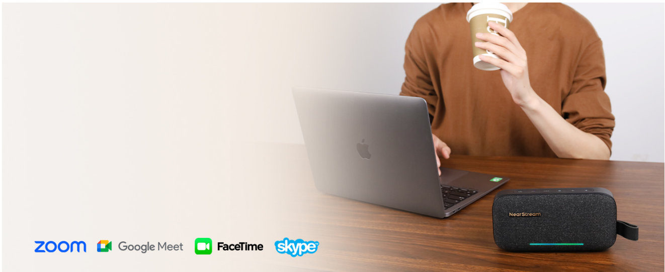
Image: The NearStream APS10 functioning as a conference speaker, ideal for online meetings.

Your browser does not support the video tag.