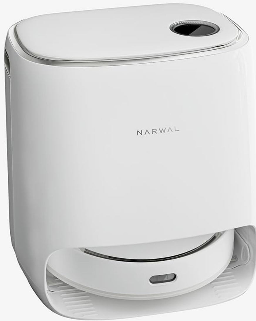
Image: The NARWAL Robot Mop and Vacuum Combo unit.