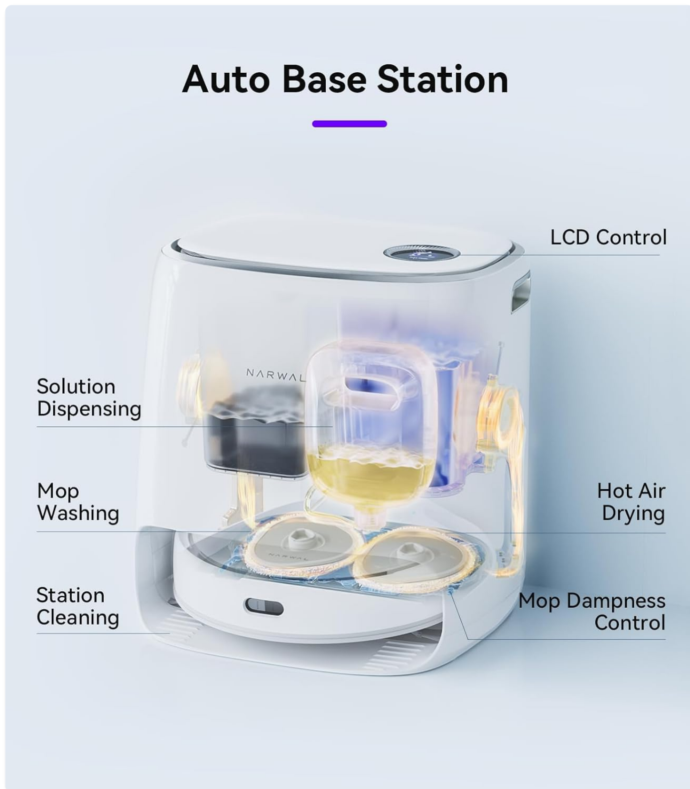
Image: Detailed view of the Auto Base Station showing LCD Control, Solution Dispensing, Mop Washing, Station Cleaning, Hot Air Drying, and Mop Dampness Control.

The base station features separate tanks for clean water and dirty water. Fill the clean water tank with tap water and the recommended amount of NARWAL exclusive formulated floor cleaner. The dirty water tank should be empty before starting operation.