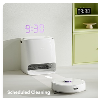
Image: The base station displaying a scheduled cleaning time.

You can also schedule cleaning sessions using the base station's display.