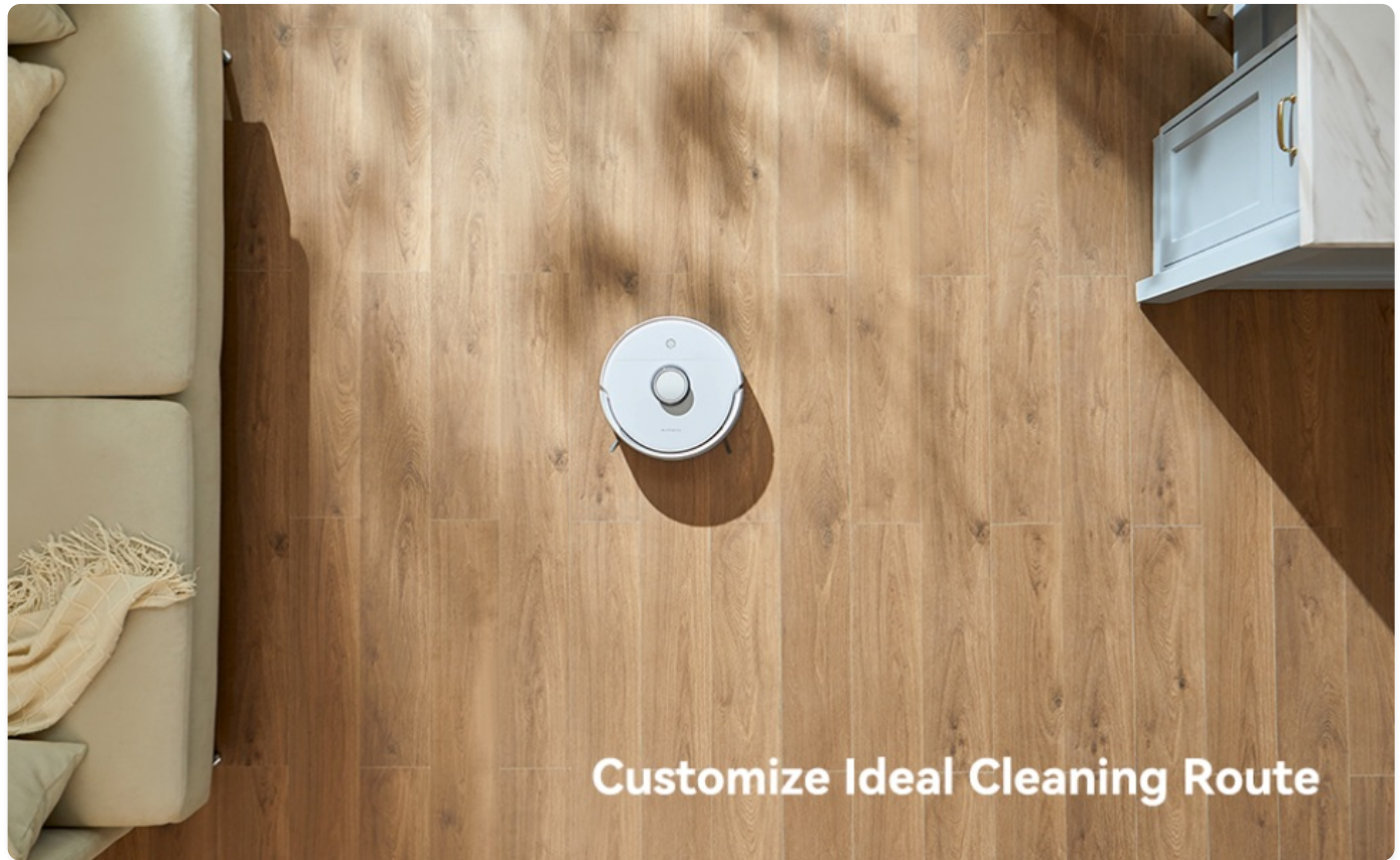
Image: The NARWAL Robot actively mapping a room to customize its ideal cleaning route.

Place the robot unit into the base station. The LCD touch display on the base station will guide you through the initial setup, including language selection and network connection. For optimal performance, allow the robot to complete an initial mapping run of your home. This process creates a detailed map for efficient navigation and cleaning.