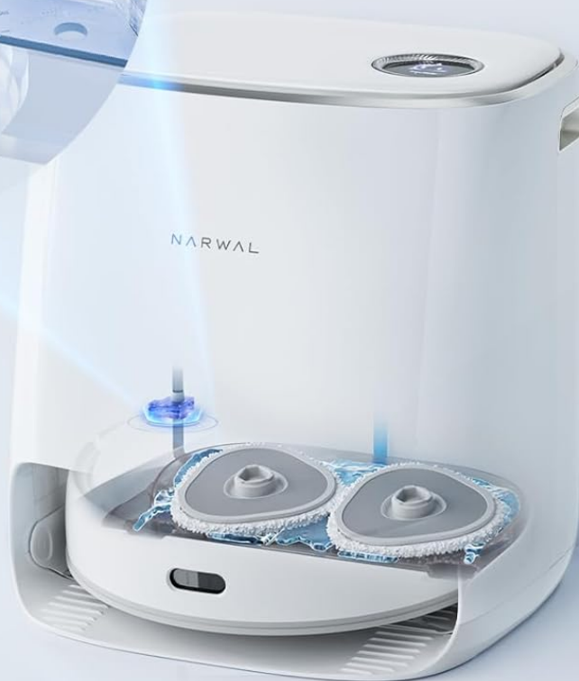
Image: Diagram illustrating the DirtSense™ Intelligent Thorough Cleaning System.