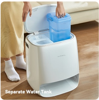
Image: The base station with its separate clean and dirty water tanks.