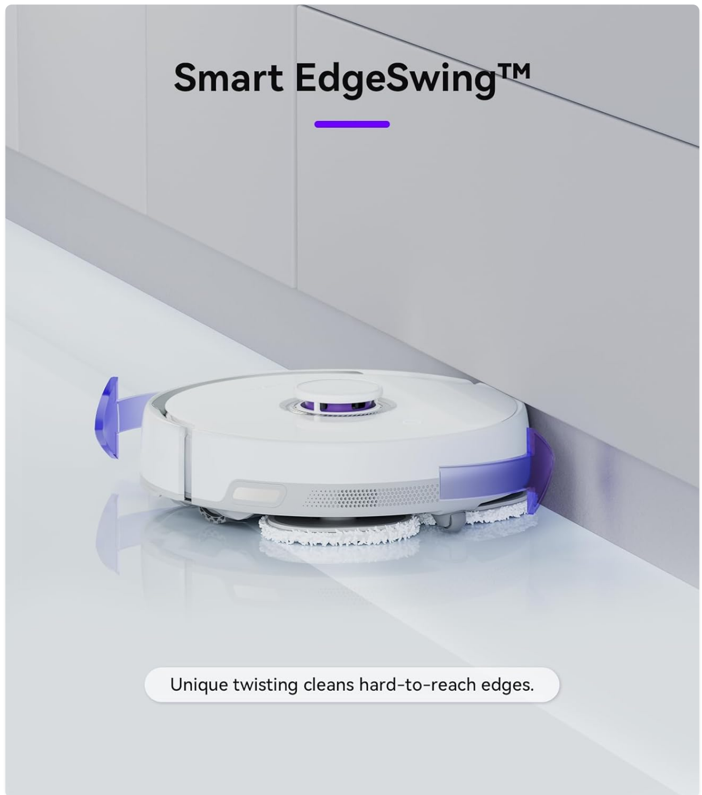
Image: The NARWAL Robot demonstrating its unique twisting motion for cleaning hard-to-reach edges.

The Corner-Traps technology periodically activates a "Smart Swing" motion, allowing the robot to effectively clean dust and debris from corners and along baseboards.