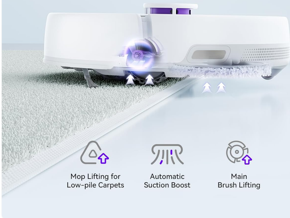
Image: The NARWAL Robot showing its ability to lift mop pads and boost suction for carpet cleaning.