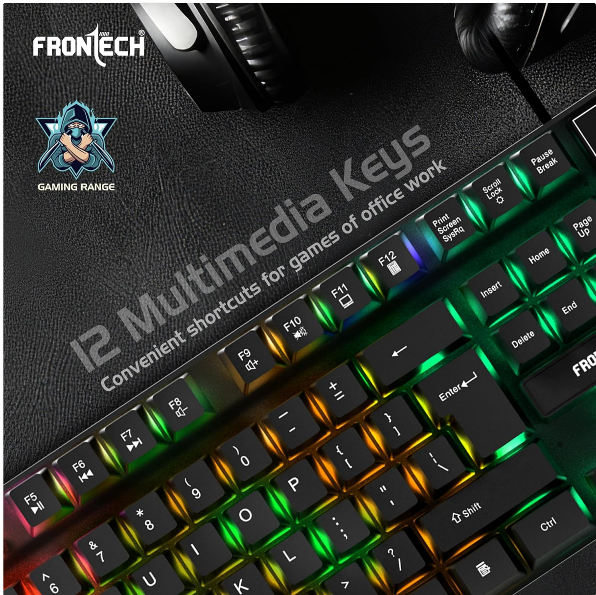
Image: Keyboard highlighting the 12 multimedia keys.