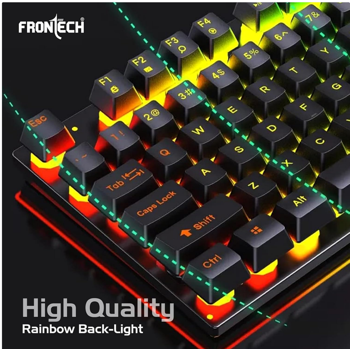
Image: Close-up of the keyboard showcasing the high-quality rainbow backlight.