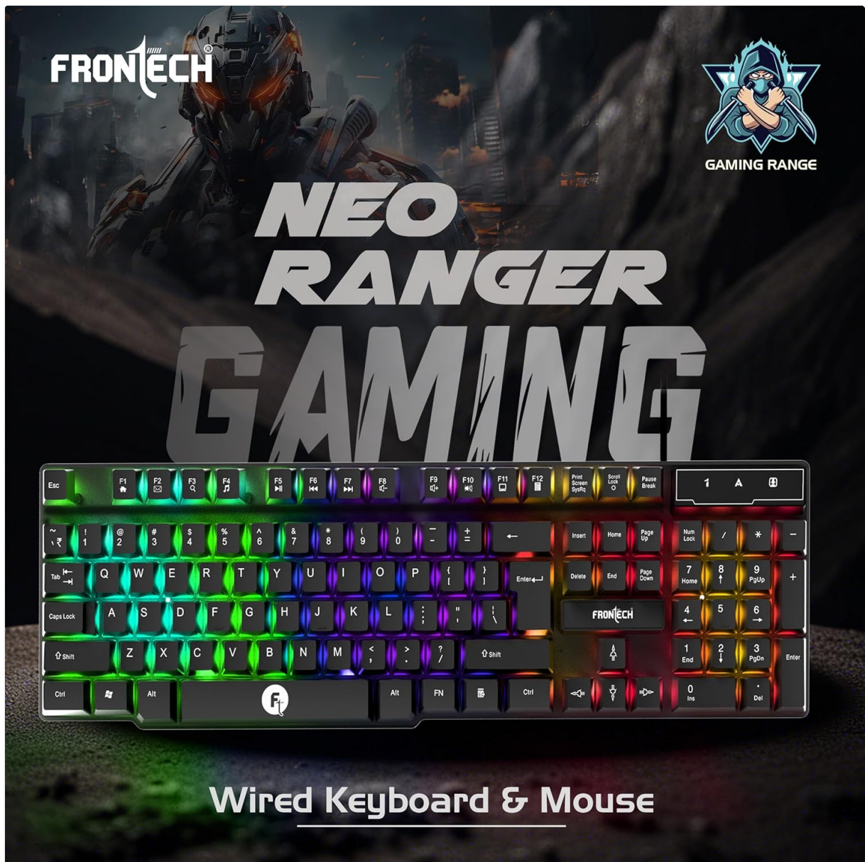
Image: FRONTECH KB-0040 Wired Gaming Combo Keyboard and Optical Mouse.