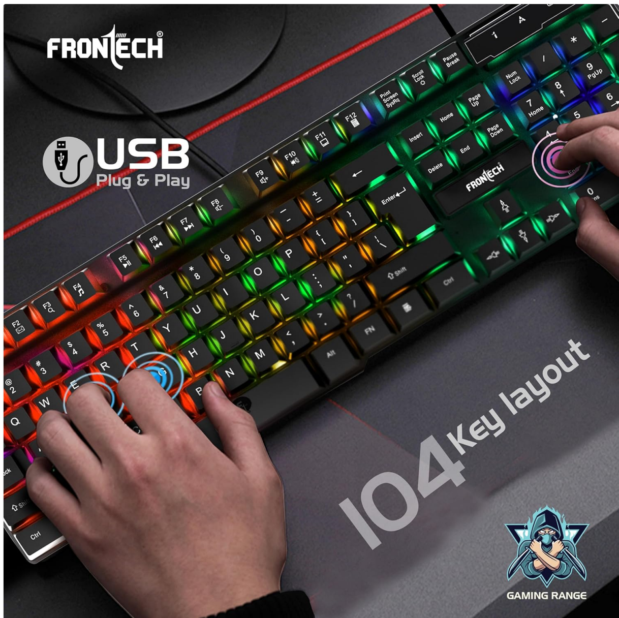
Image: USB Plug & Play connection for the keyboard.

Your browser does not support the video tag.