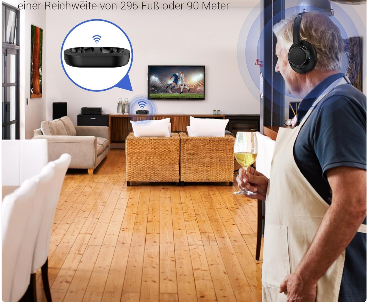
Image: A person wearing the headphones and walking away from a TV, illustrating the extended connection range of up to 90 meters (295 feet) from the transmitter.

Die TV-Kopfhörer spielen hochwertigen Klang mit einer Reichweite von 295 Fuß oder 90 Meter