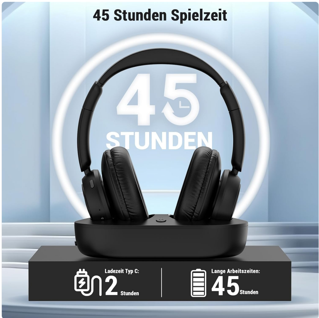
Image: A graphic displaying the impressive battery life of the headphones, indicating 45 hours of playtime and a 2-hour charging time via USB-C.