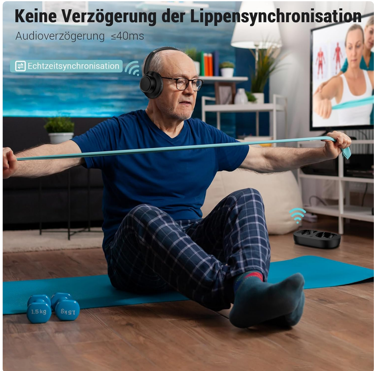
Image: A person exercising while watching TV with the LETSACTIV headphones, demonstrating the real-time synchronization and low audio delay (less than 40ms) for an immersive experience.

The headphones utilize Bluetooth 5.2 technology to provide an ultra-low latency audio experience (less than 40ms). This ensures perfect synchronization between audio and video, preventing noticeable lip-sync delays.