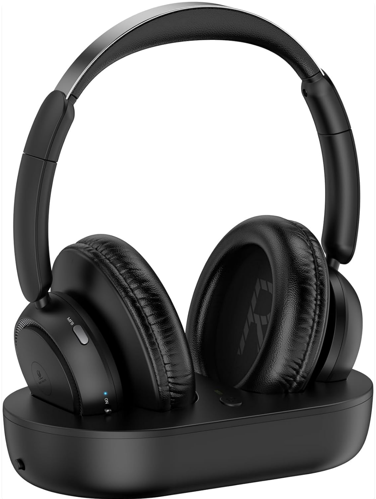
Image: The LETSACTIV M98 Wireless TV Headphones resting on their charging station. The headphones are black with comfortable earcups and an adjustable headband. The charging station is a compact black base.

The LETSACTIV M98 system consists of wireless headphones and a transmitter that also functions as a charging station.