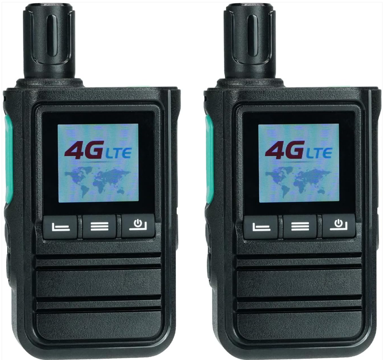
Figure 2: Retevis L61 Network Walkie Talkies