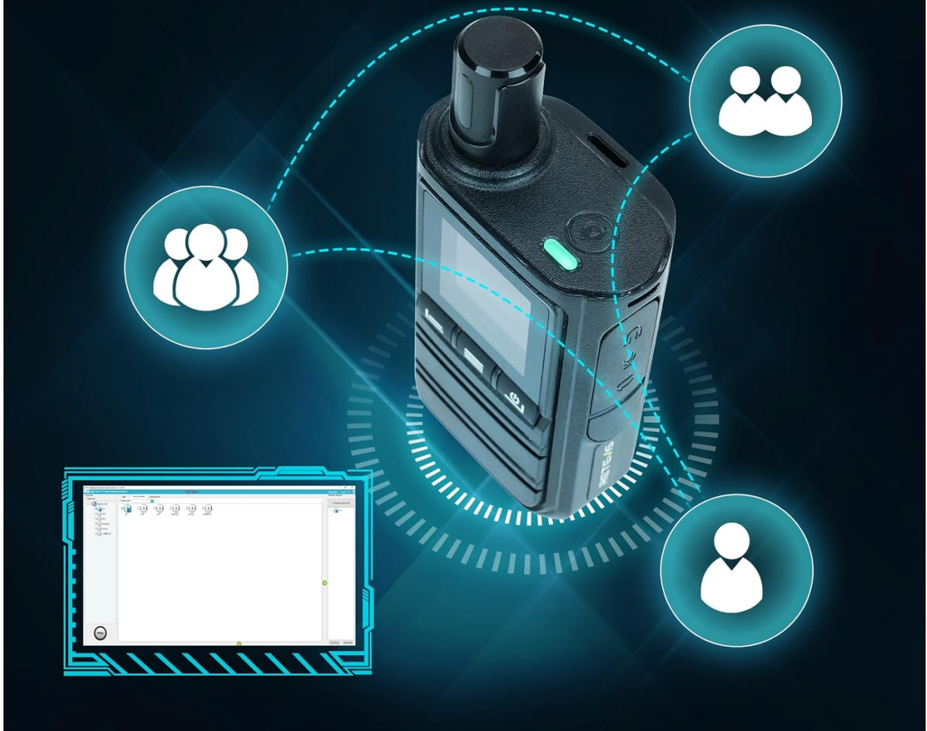
Figure 5: Call Modes