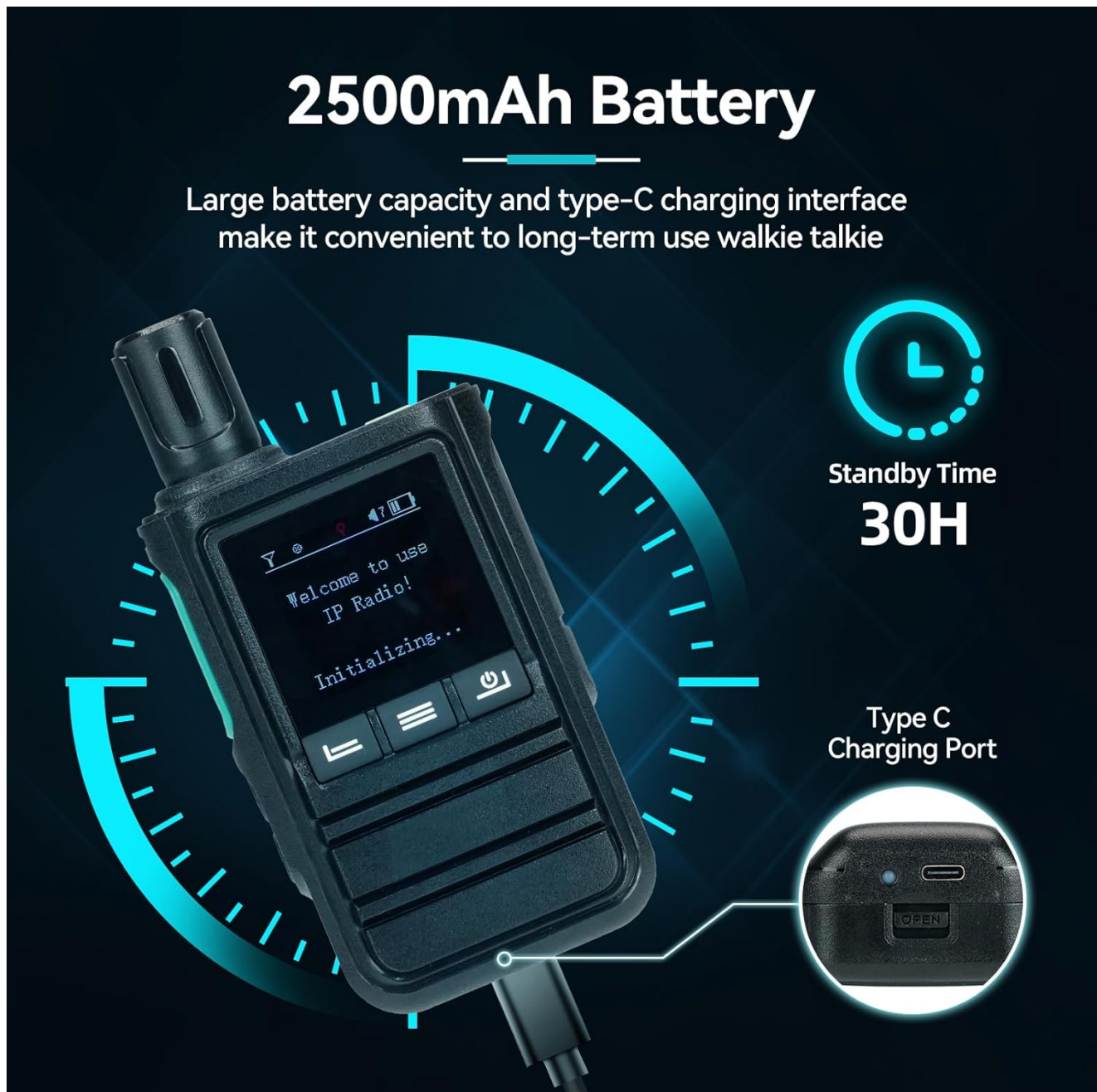
Figure 3: Battery and Charging Overview