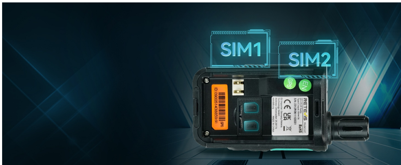
Figure 4: Dual SIM Card Slots