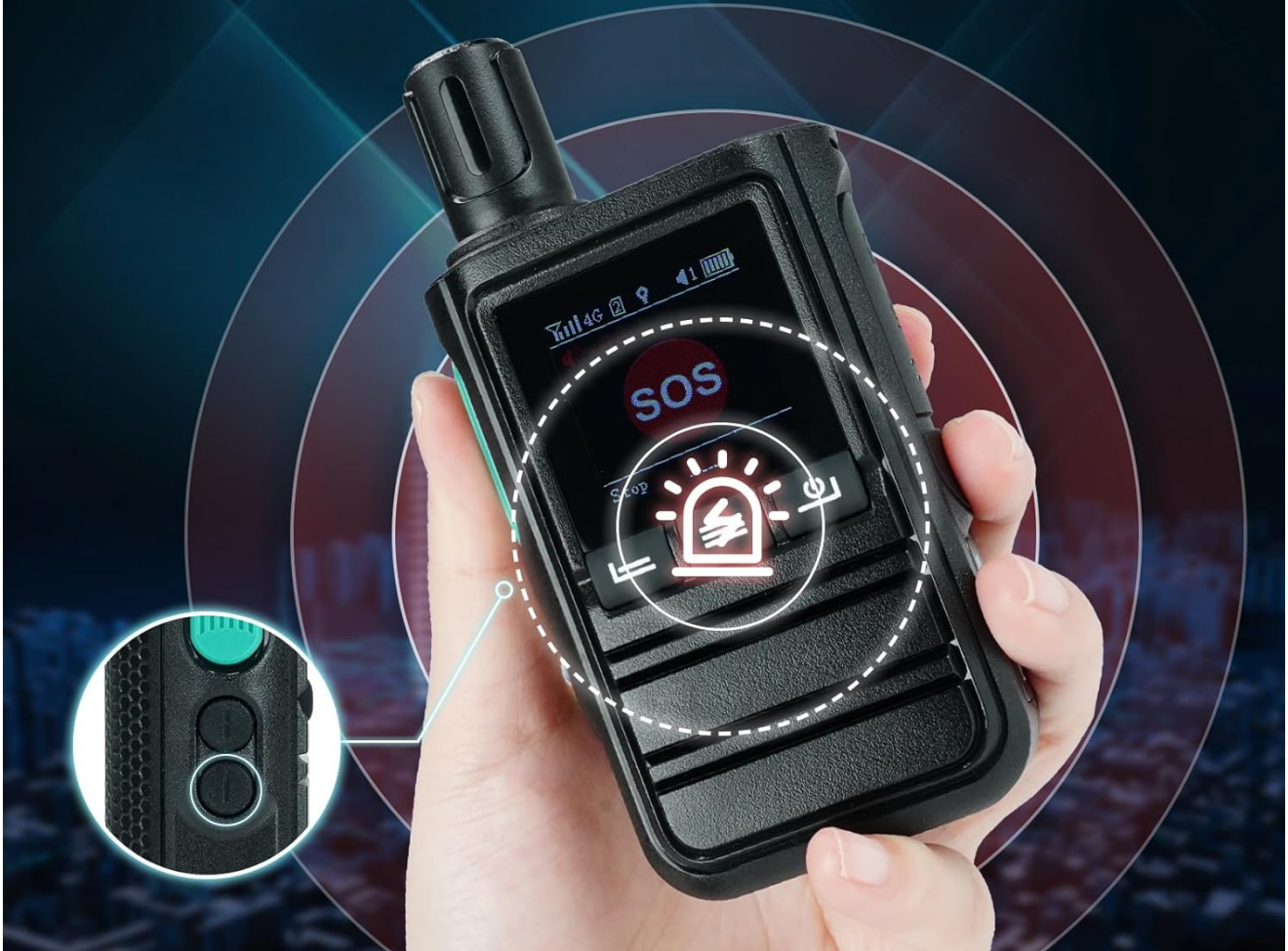
Figure 8: SOS Alarm Activation

Ask for help in emergencies to keep you safe