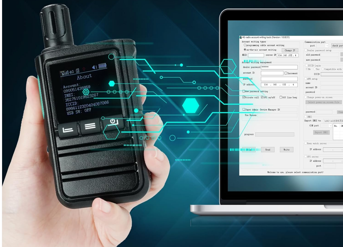
Figure 7: Over-the-Air Programming

No cable is required Edit the walkie talkie anytime and anywhere