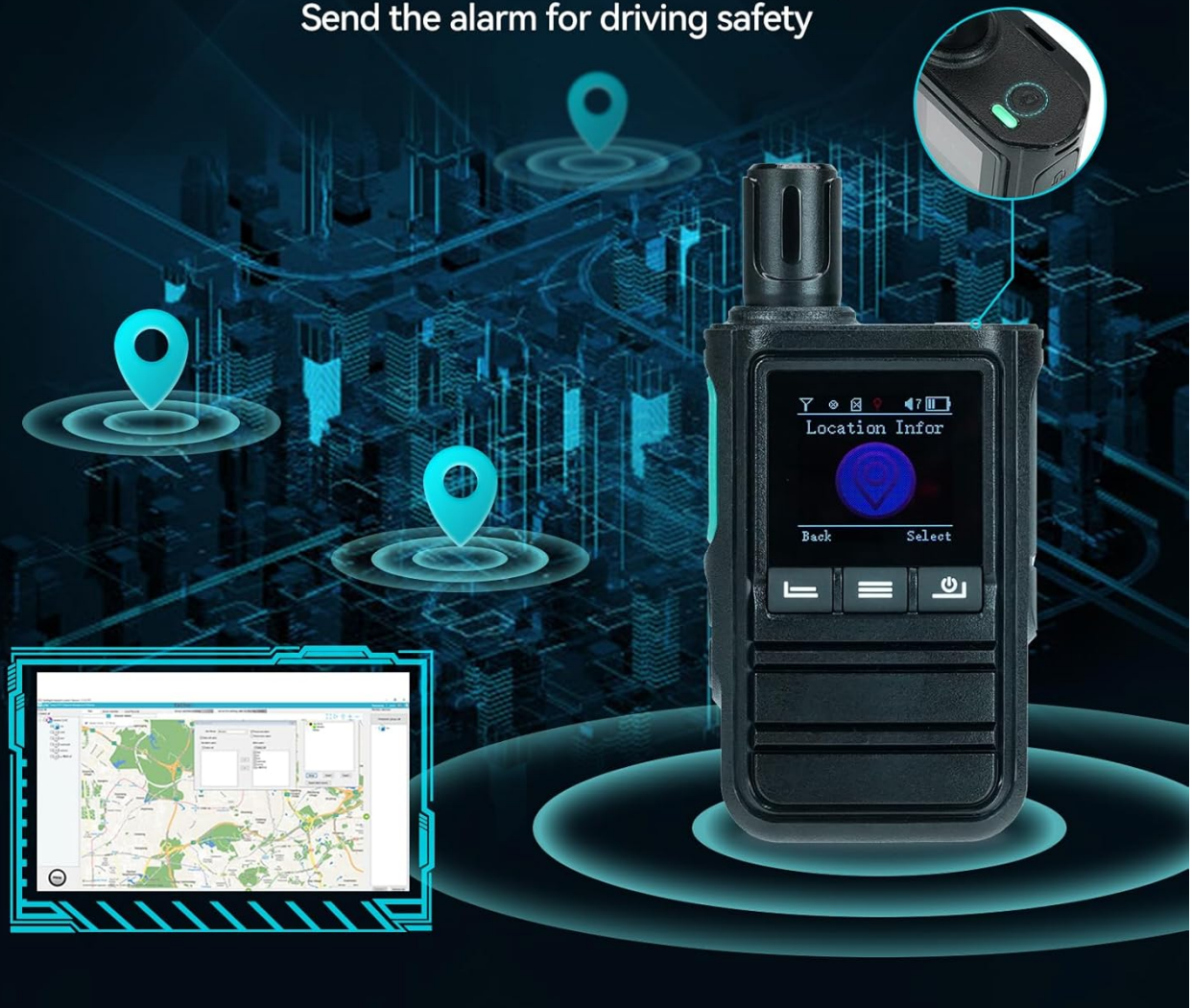
Figure 6: GPS Tracking and Fencing

Locate the location for work efficiency Send the alarm for driving safety