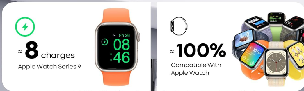
Figure 1: iWALK Portable Apple Watch Charger (Model LPW004C).