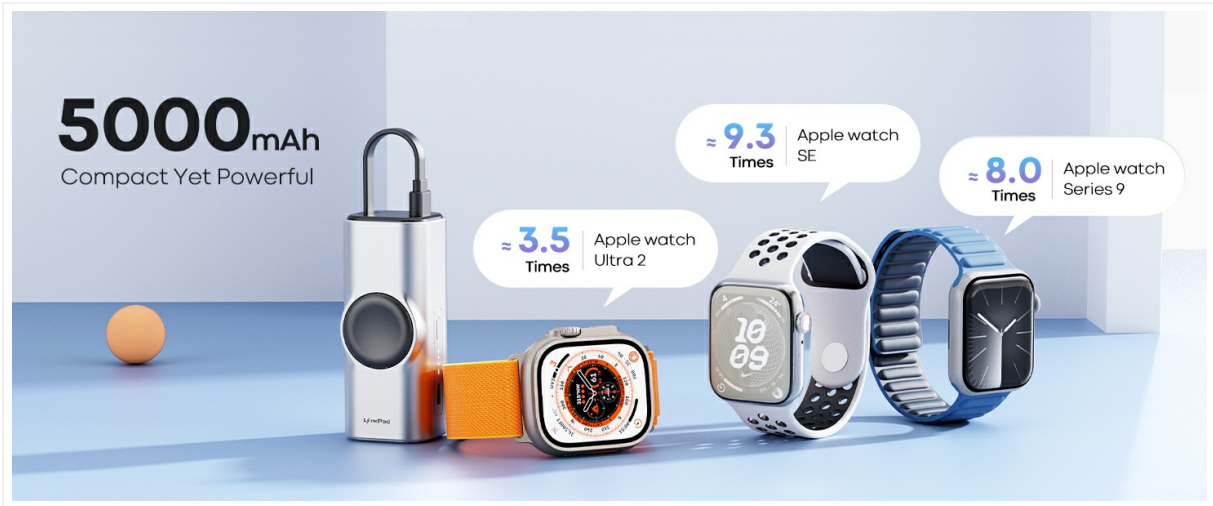
Figure 4: Wireless charging of an Apple Watch on the power bank.