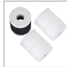
Large coil *3