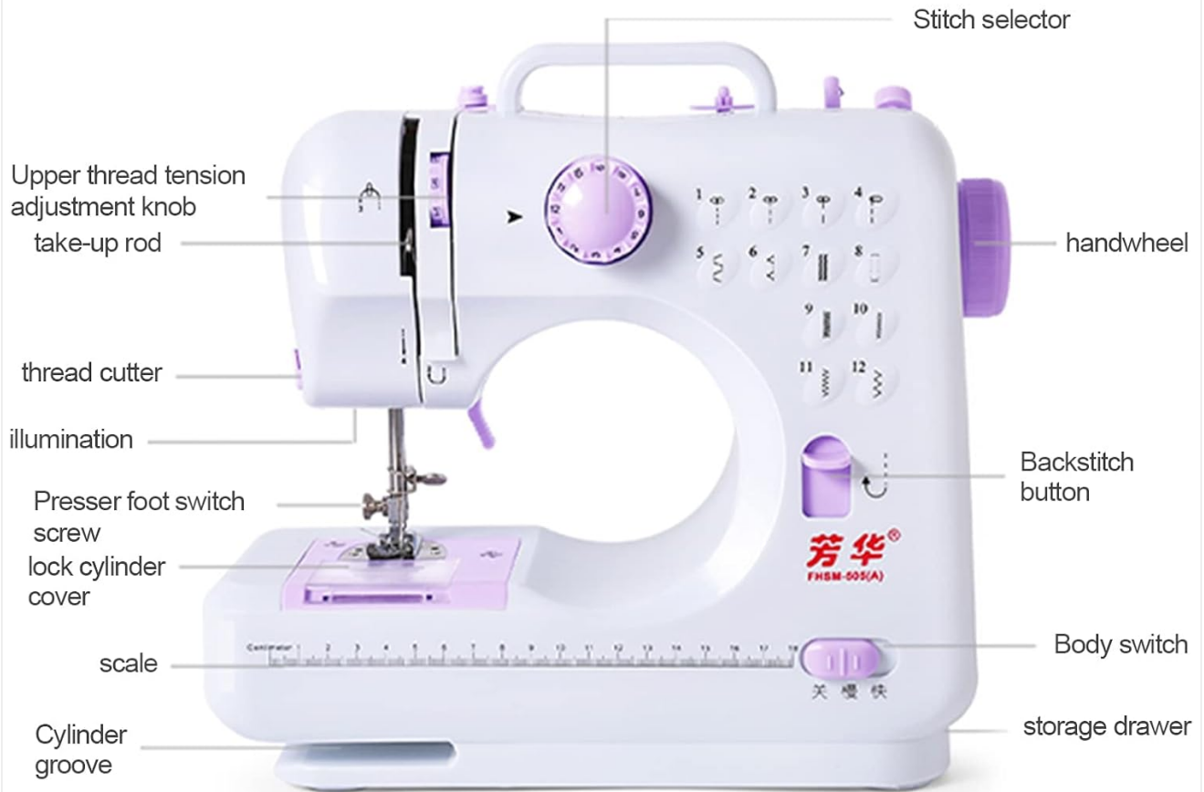
Figure 1: Functional diagram of the LetCart 505A sewing machine, highlighting key parts such as the stitch selector, handwheel, upper thread tension adjustment knob, take-up rod, thread cutter, illumination light, presser foot switch, lock cylinder cover, scale, cylinder groove, backstitch button, body switch, and storage drawer.