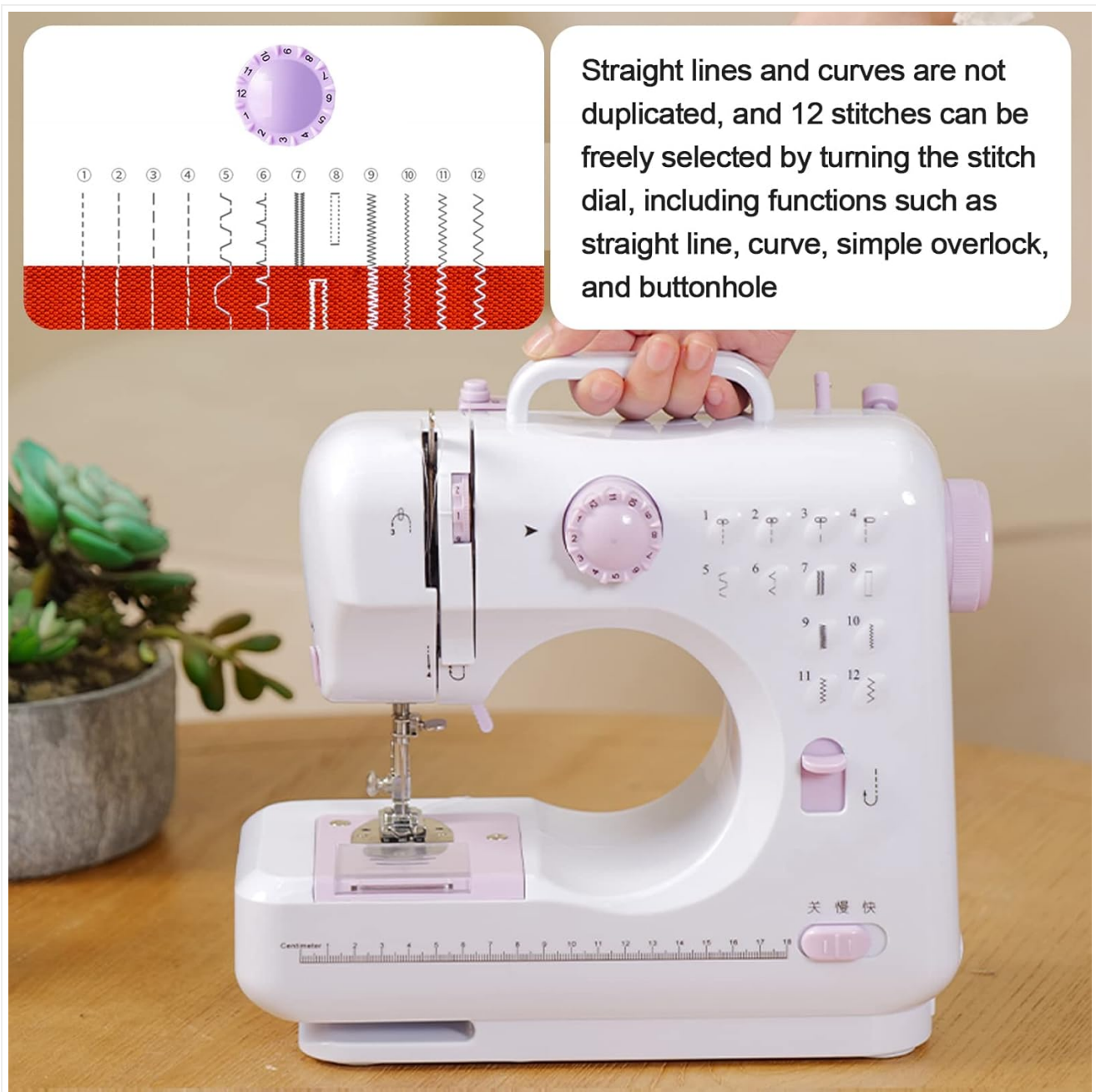
Figure 4: The stitch selector dial allows you to choose from 12 stitch patterns, including straight stitches, curves, simple overlock, and buttonhole stitches. The image also shows the machine in operation, demonstrating its compact size.