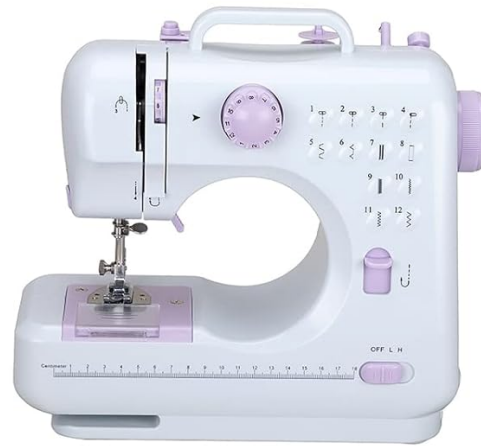
Sewing machine host*1