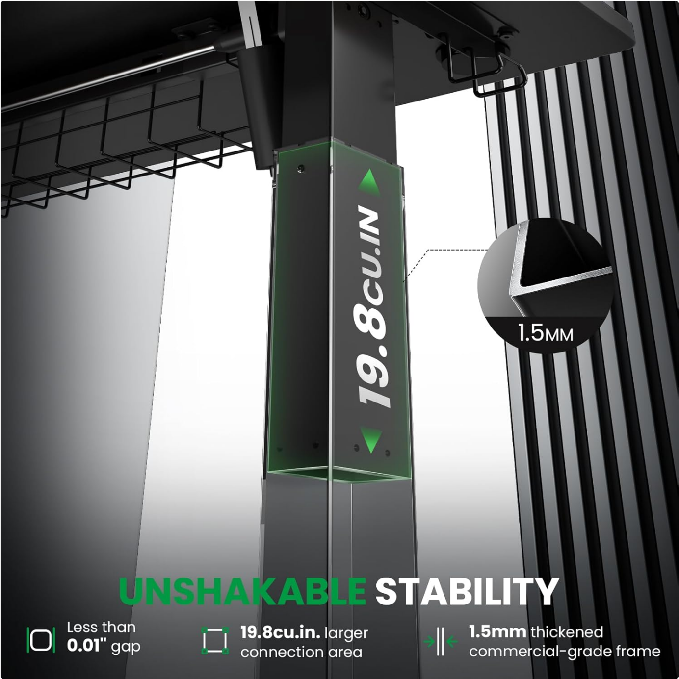
Figure 8.1: Detail of the desk's robust construction for unshakable stability.