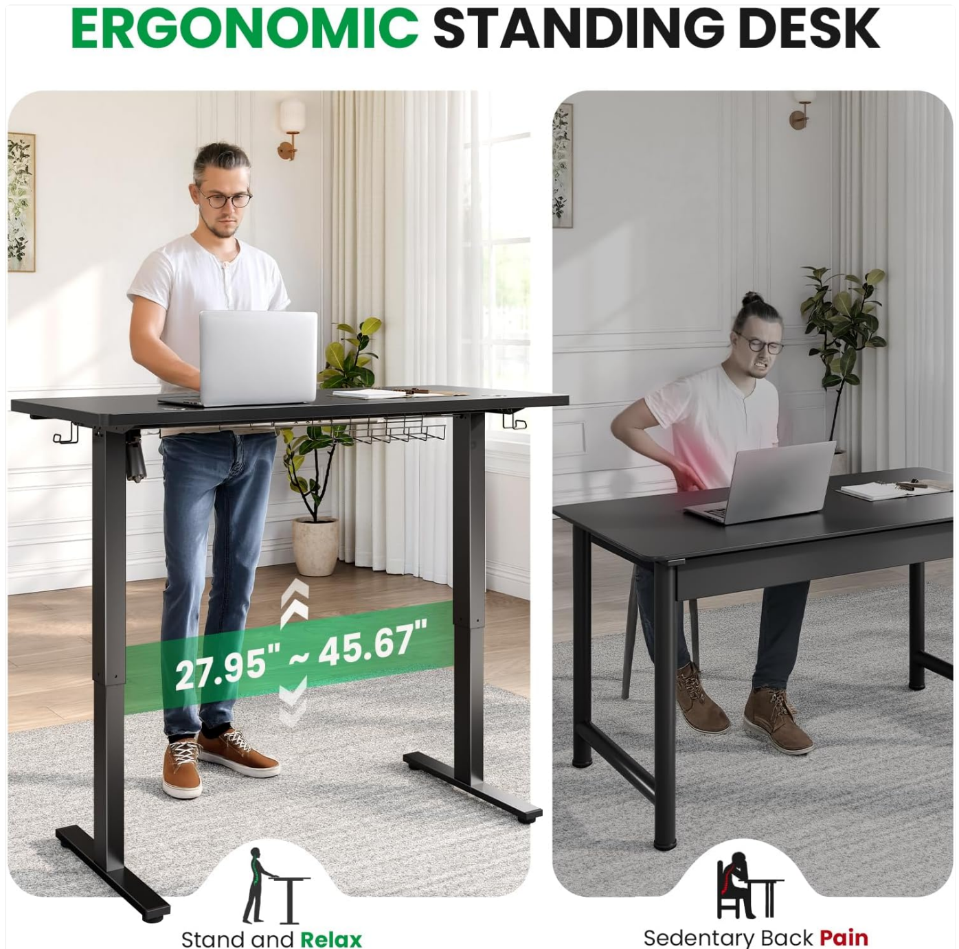
Figure 5.2: Ergonomic height adjustment for sitting and standing.

The desk offers an adjustable height range from 27.95 inches (71 cm) to 45.67 inches (116 cm) , allowing for comfortable sitting and standing positions.