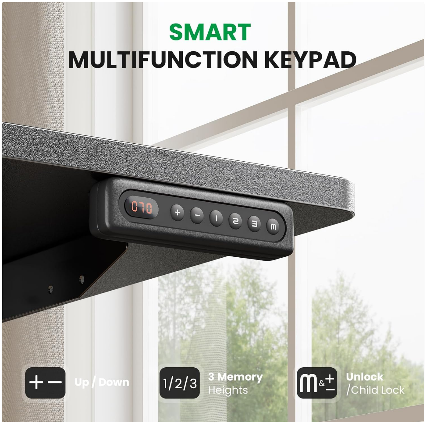
Figure 5.1: The Smart Multifunction Keypad.