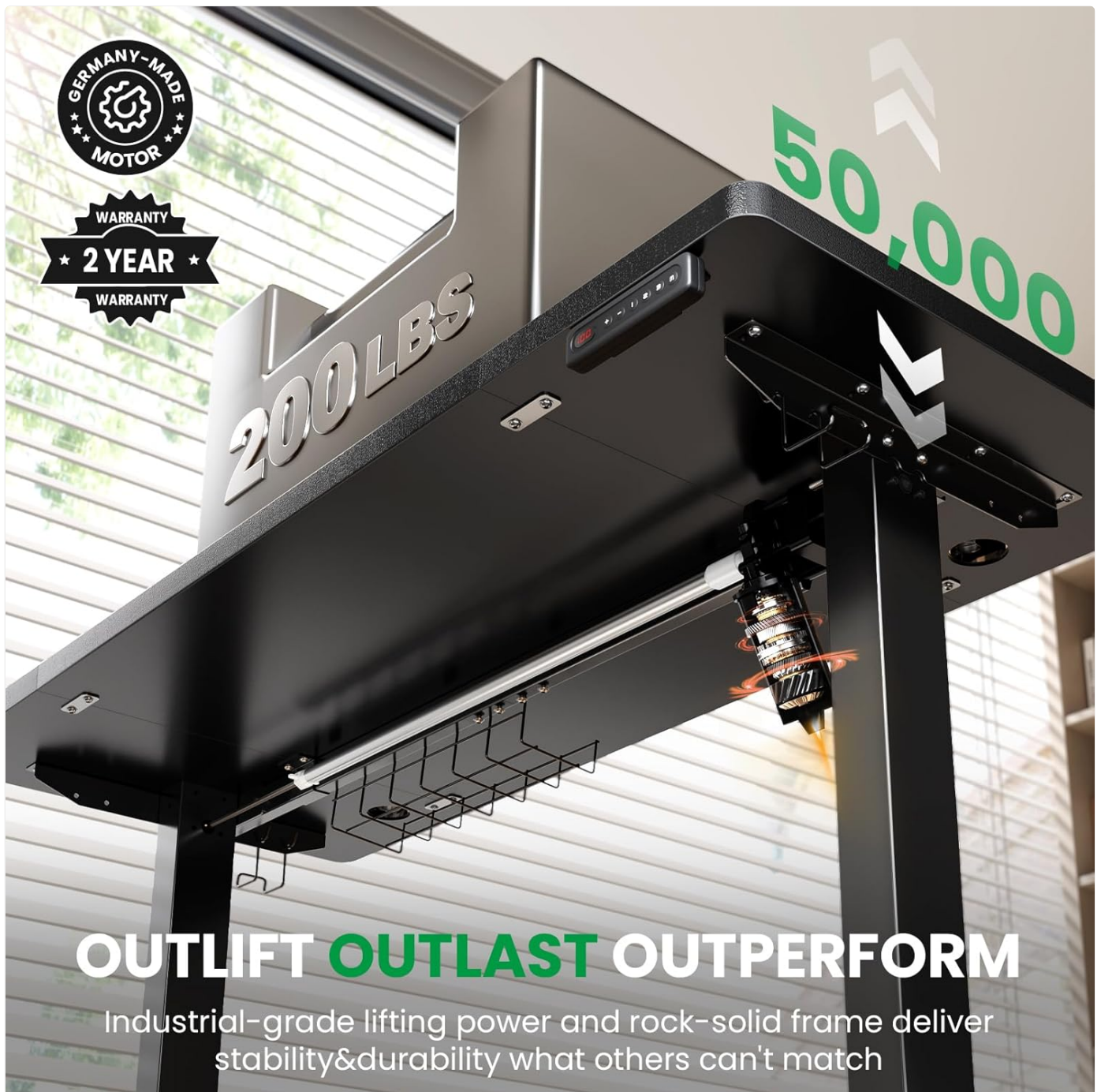
Figure 8.2: The desk's lifting capacity and durability testing.