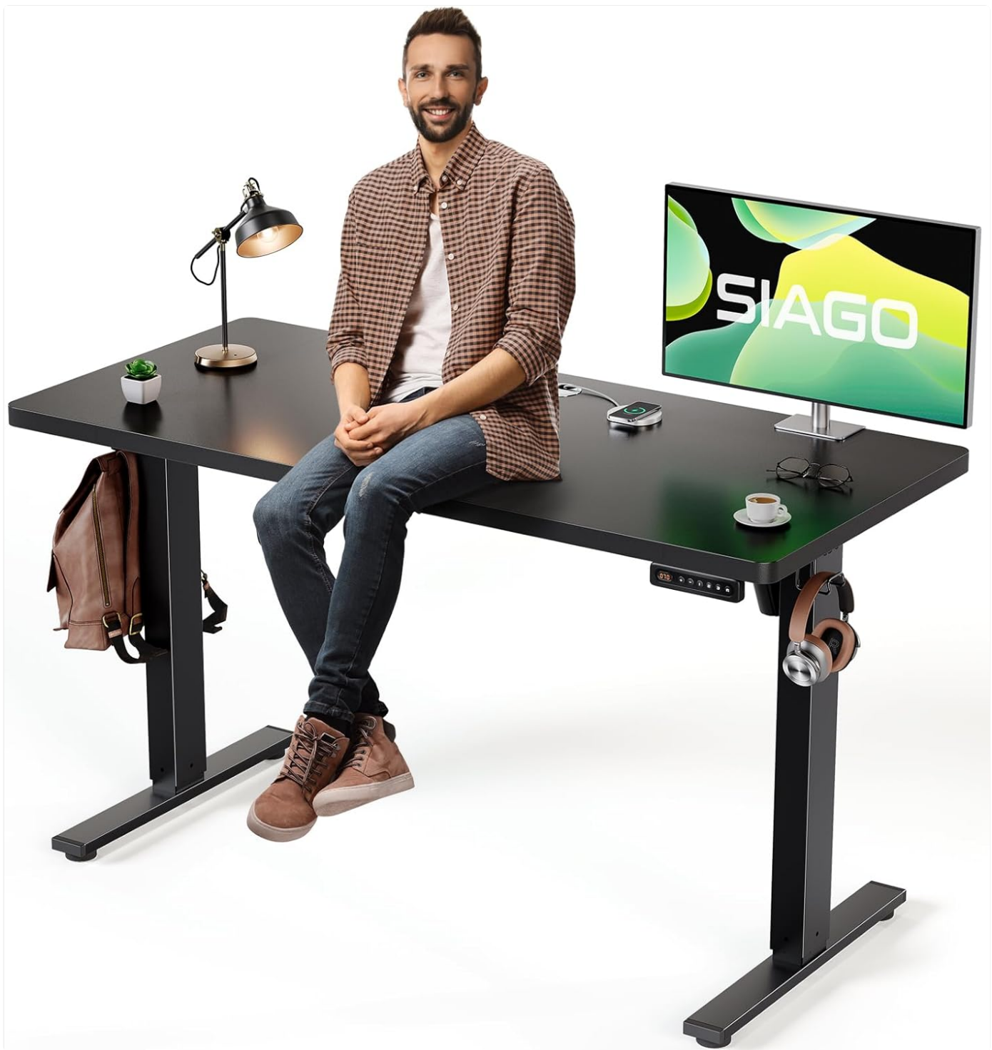
Figure 1.1: The SIAGO Electric Standing Desk, 48 x 24 Inch Black model.