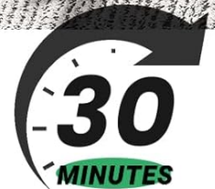
Figure 4.1: Illustration of the quick 30-minute installation process.