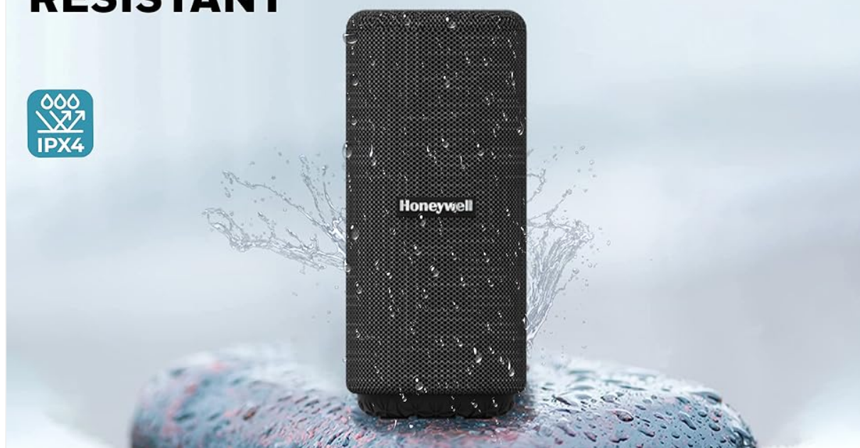
Figure 7: The lightweight design of the Suono P300 makes it highly portable.