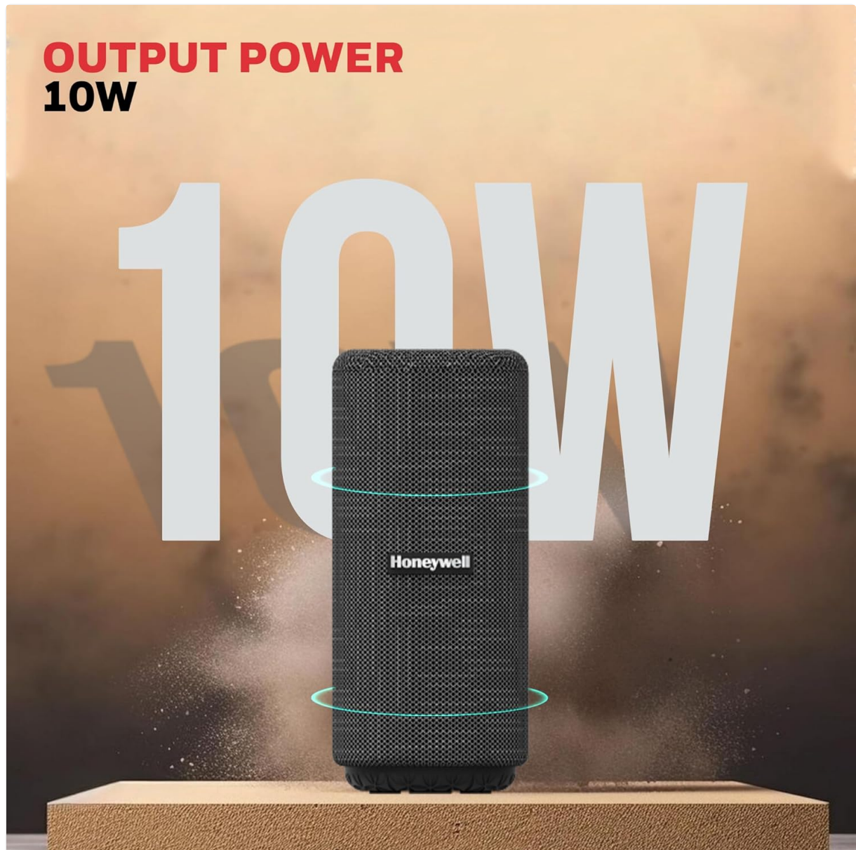
Figure 2: Multi-connectivity ports and controls on the Honeywell Suono P300 speaker.

The Honeywell Suono P300 features intuitive controls and multiple connectivity options for a versatile audio experience.