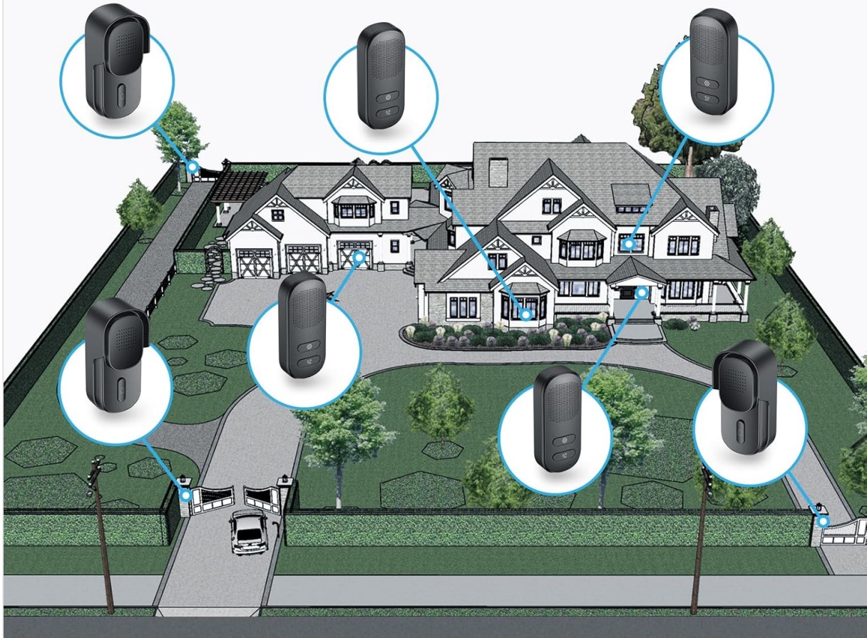
Image: An aerial view of a house illustrating the expandability of the Wuloo intercom system, showing multiple outdoor and indoor units connected wirelessly.

You can add more units to your current system.