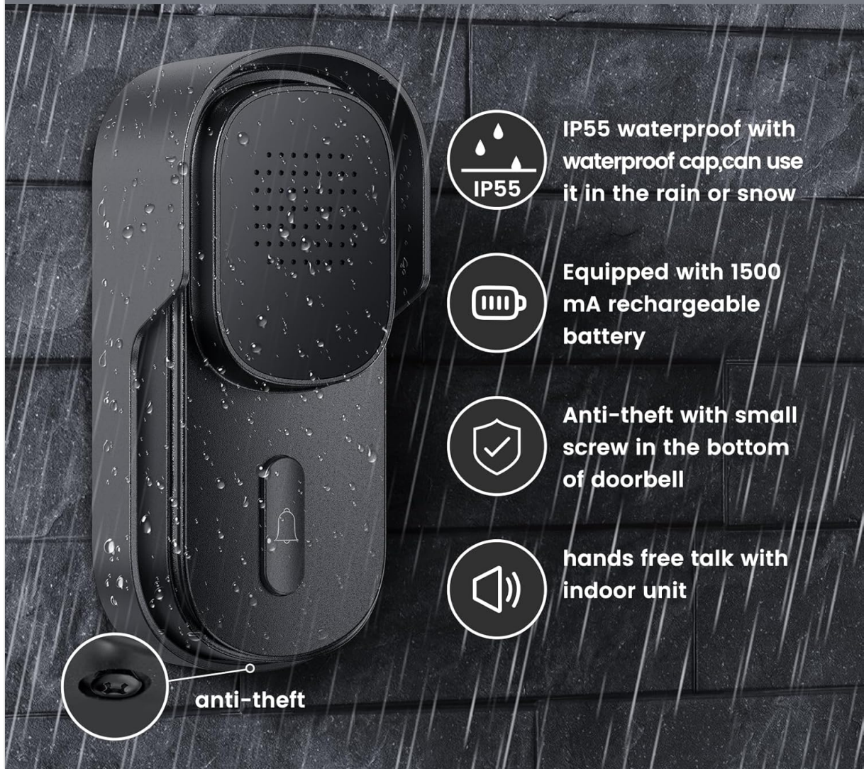
Image: A detailed view of the outdoor unit highlighting its IP55 waterproof rating, built-in 1500mA rechargeable battery, anti-theft screw, and hands-free communication capability.