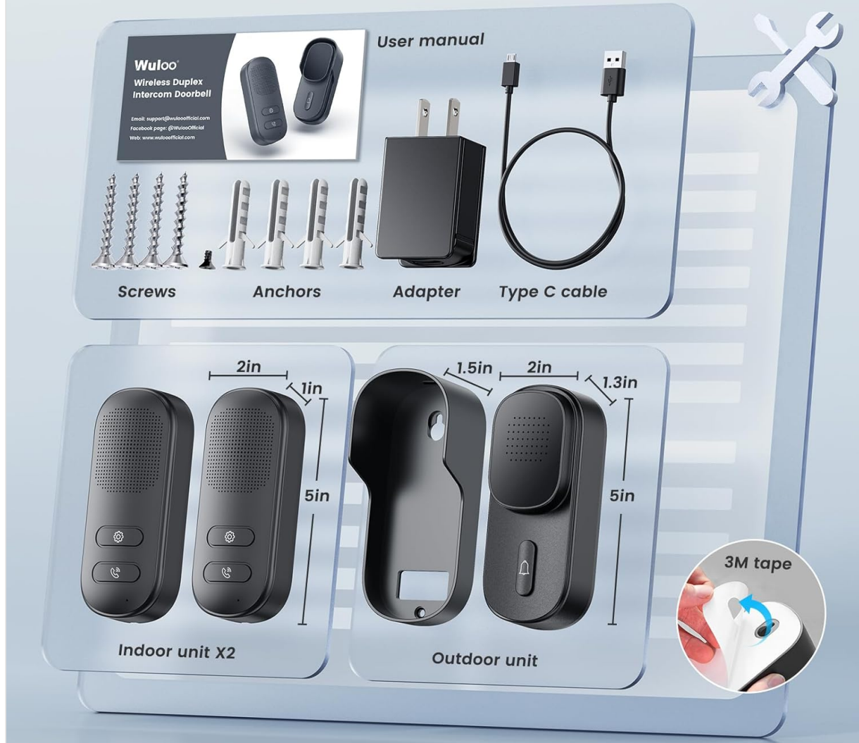
Image: All components included in the Wuloo ML009901 Wireless Intercom Doorbell package, showing two indoor units, one outdoor unit, mounting hardware, adapter, and Type C cable.