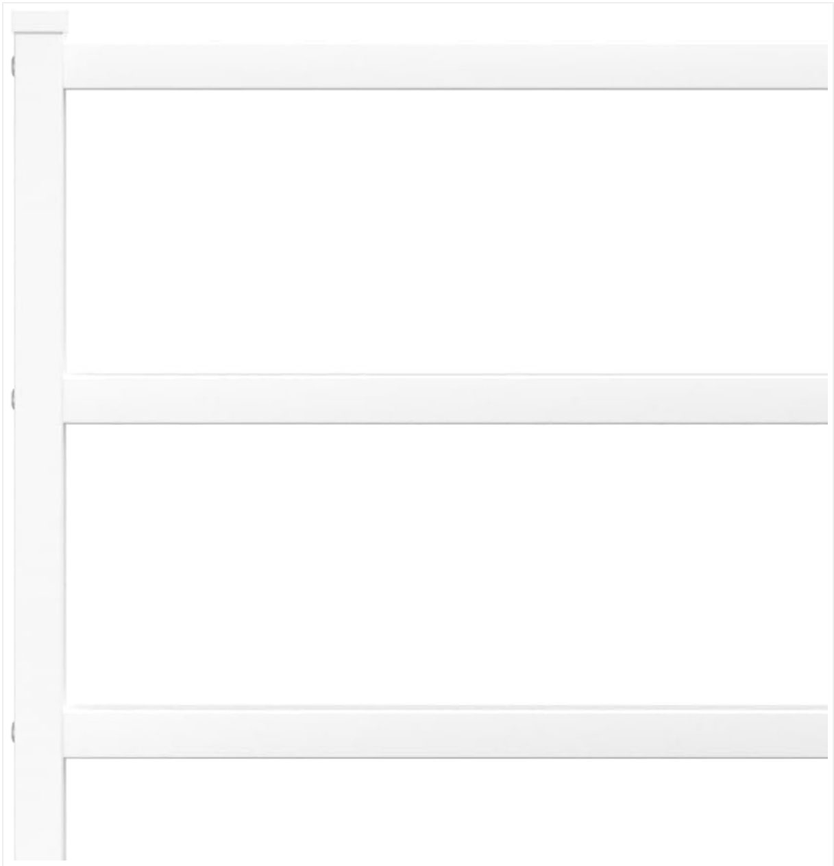
Image: Detail of a connection point showing screws and washers for secure assembly.