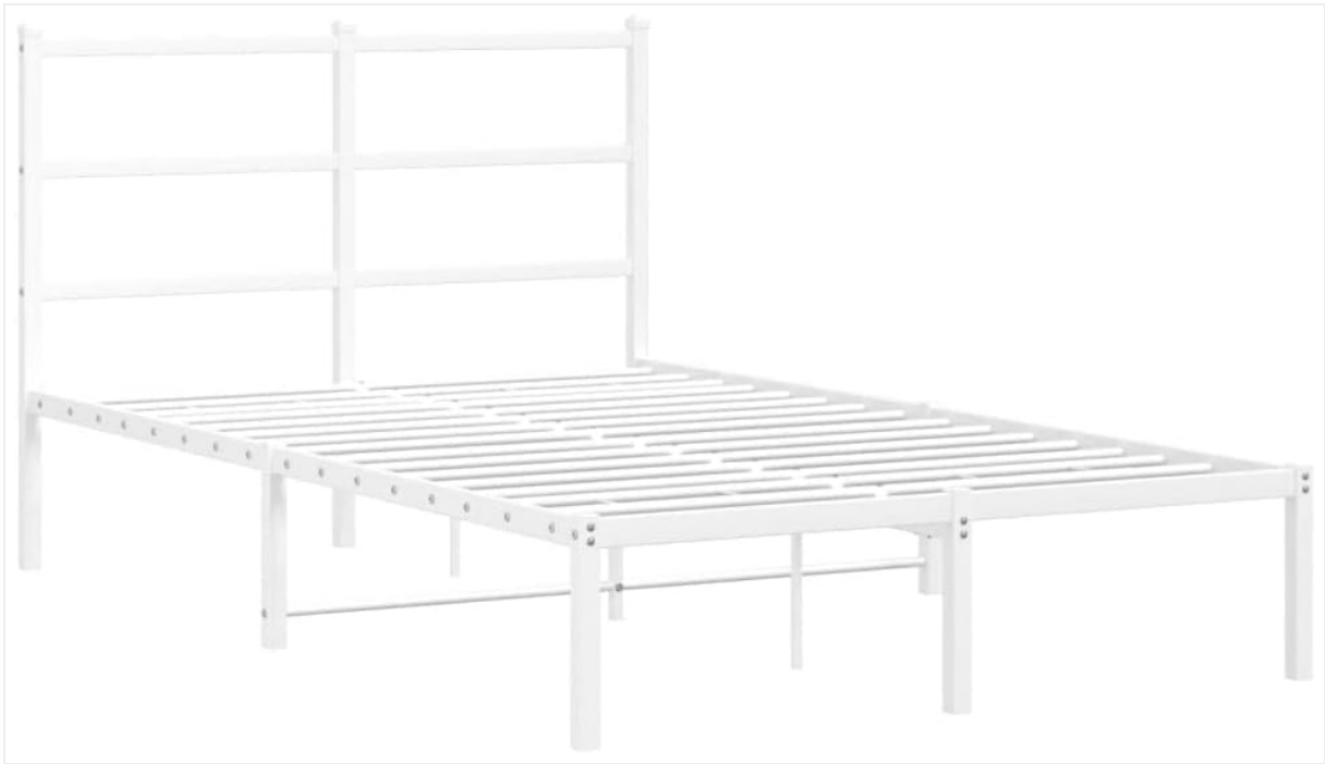
Image: The fully assembled vidaXL Metal Bed Frame, ready for use.