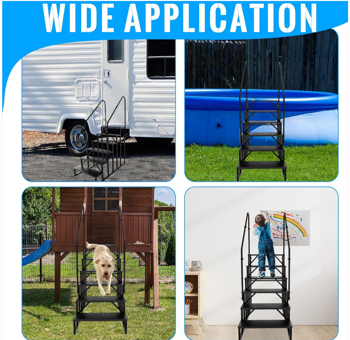
Figure 3.1: Examples of wide application for the Aysiofdy 6-Step RV Ladder.

Position the steps directly in front of the entry point (e.g., RV door, hot tub edge, mobile home entrance). Ensure the base of the steps is on a firm, level surface to prevent wobbling. The steps are suitable for various applications including RVs, campervans, travel trailers, hot tubs, above-ground pools, and porch access.