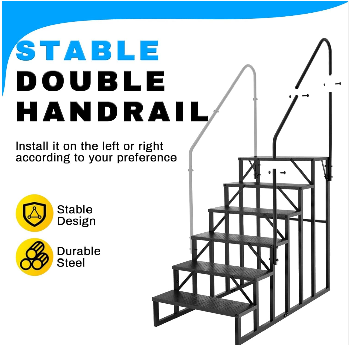
Figure 2.1: Handrail installation can be customized to either side.

Video 2.1: Demonstration of the RV stairs in use, highlighting stability and ease of access. This video shows the product being used to access a truck bed, demonstrating its robust construction and the benefit of the handrails for safe ascent and descent.