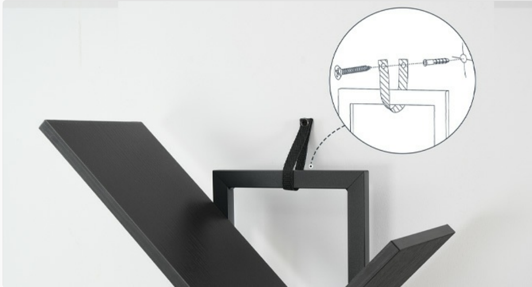
Image 2.1: Diagram illustrating the installation of the anti-tip kit to secure the bookshelf to a wall, enhancing stability and safety.