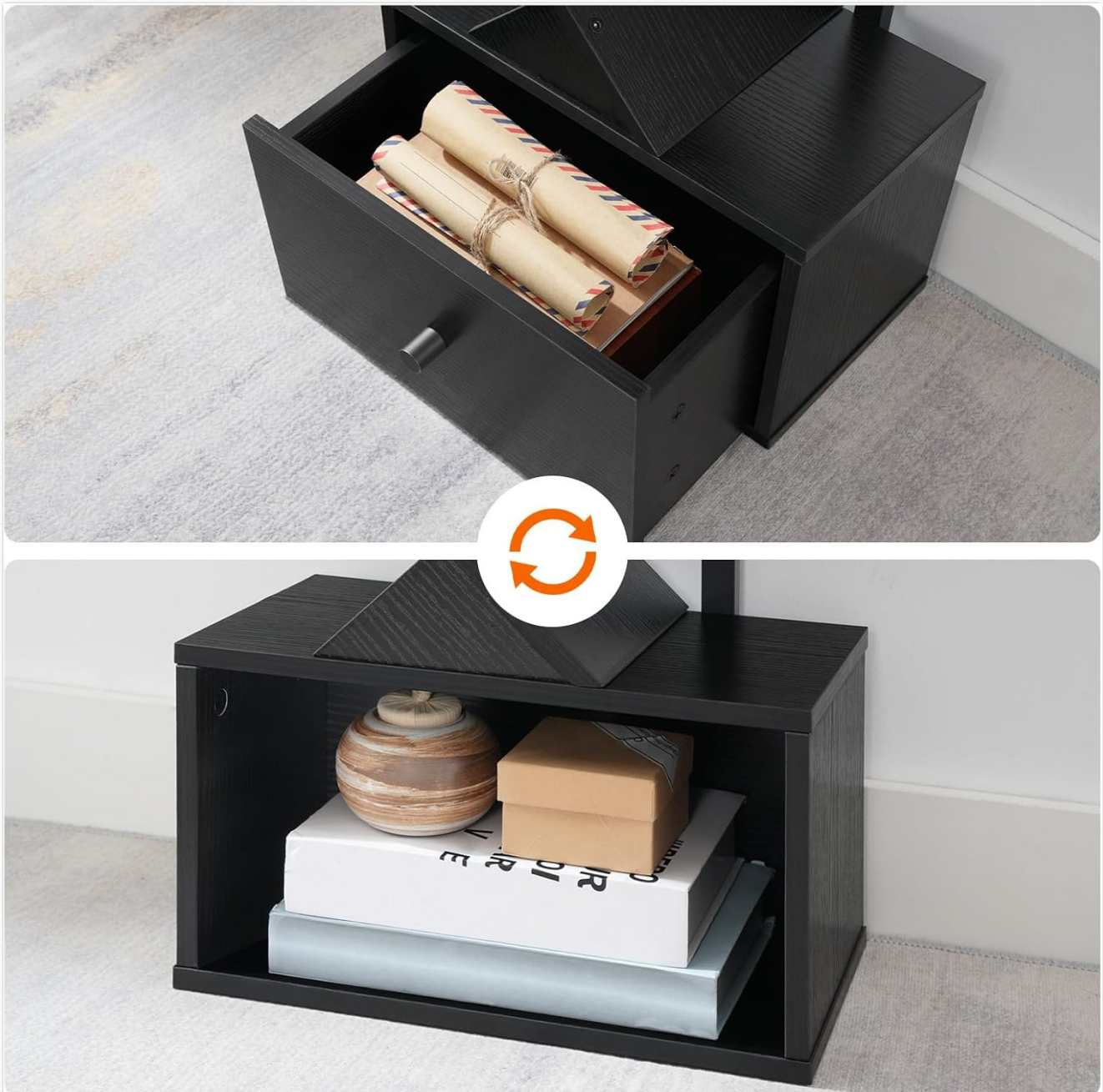
Image 5.1: The integrated drawer of the HOOBRO Tree Bookshelf, shown both closed and open, revealing its storage capacity for