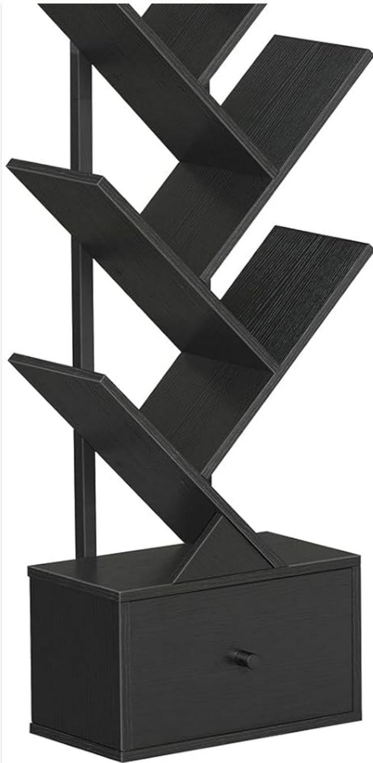
Image 1.1: The HOOBRO Tree Bookshelf, Model EBK18SJ01G1, in black finish, showcasing its unique tree-like design and bottom drawer.