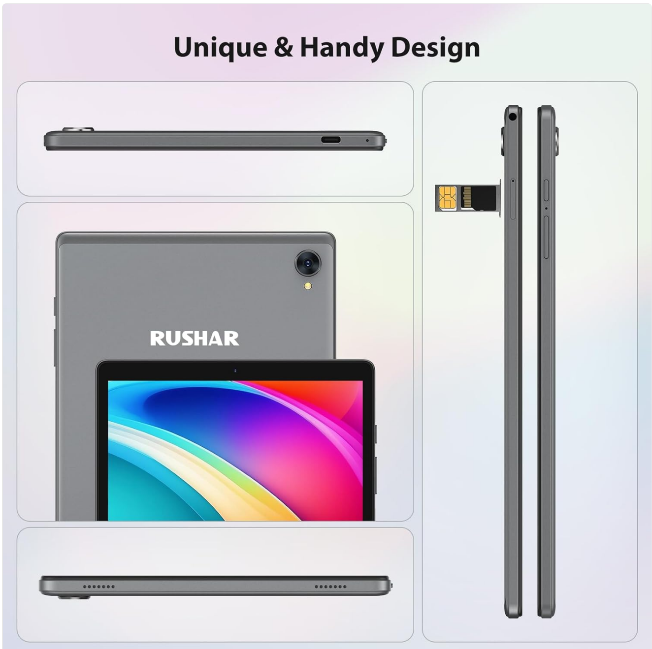
Figure 3: Side view of the tablet highlighting ports and buttons.