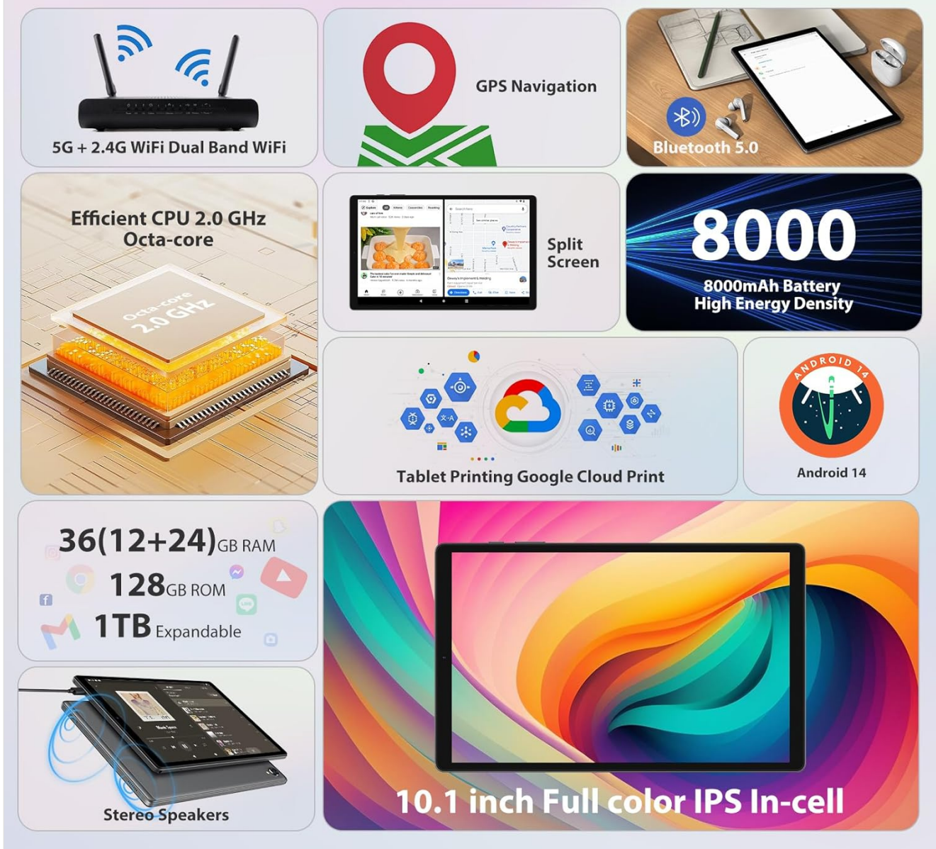
Figure 8: Overview of tablet features including storage and connectivity.