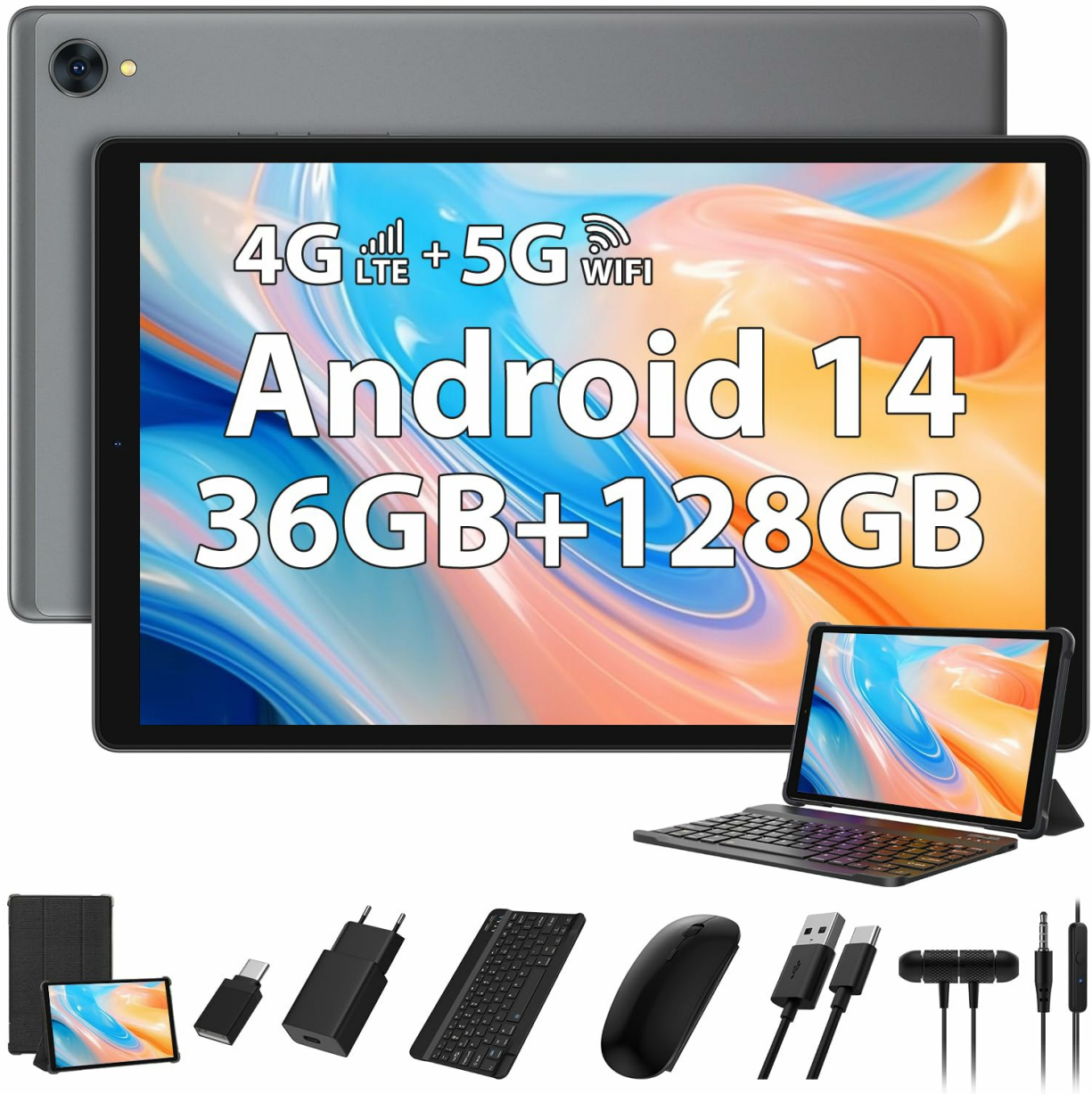
Figure 7: Android 14 interface with various applications.