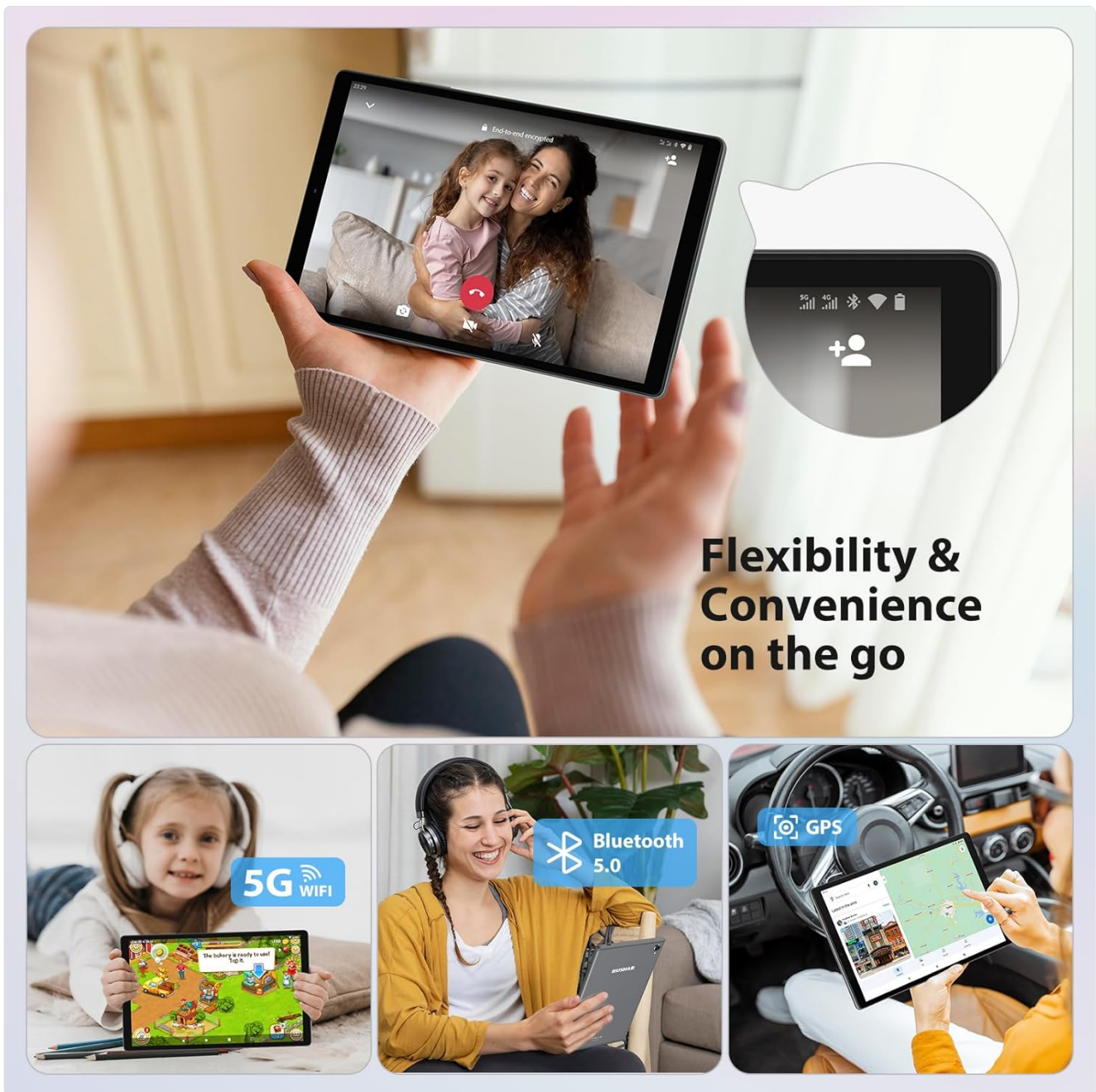
Figure 5: Tablet showing active connectivity options.