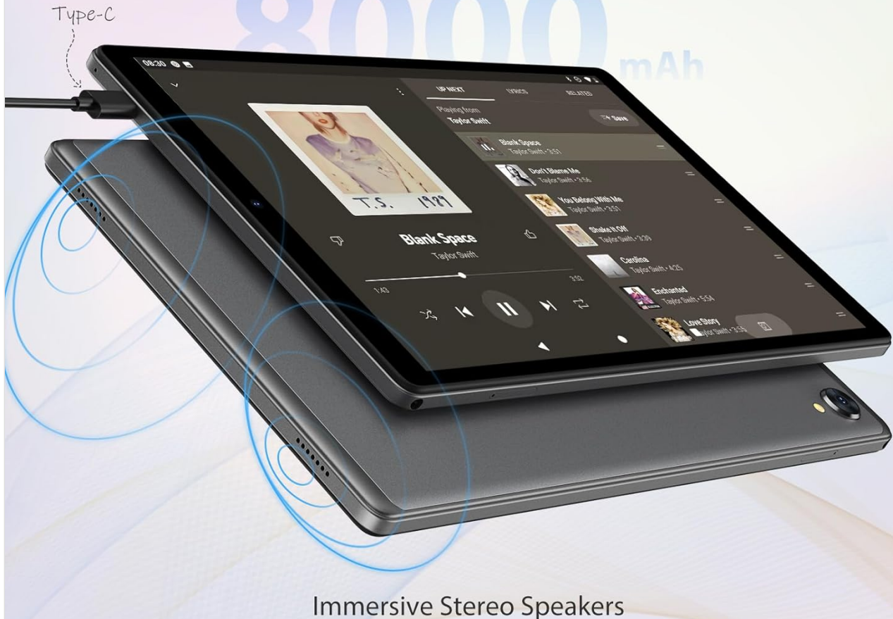
Figure 4: Charging the tablet.