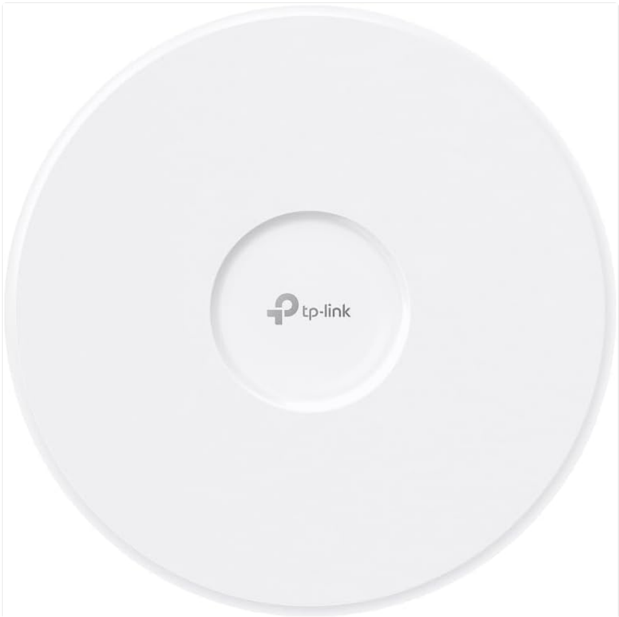
Figure 3.1: Top view of the EAP773 Access Point. This image displays the sleek, circular design of the access point, suitable for ceiling or wall mounting.