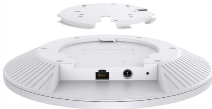
Figure 3.2: Bottom view of the EAP773 Access Point. This image highlights the connectivity options, including the 10G Ethernet port and DC power input.