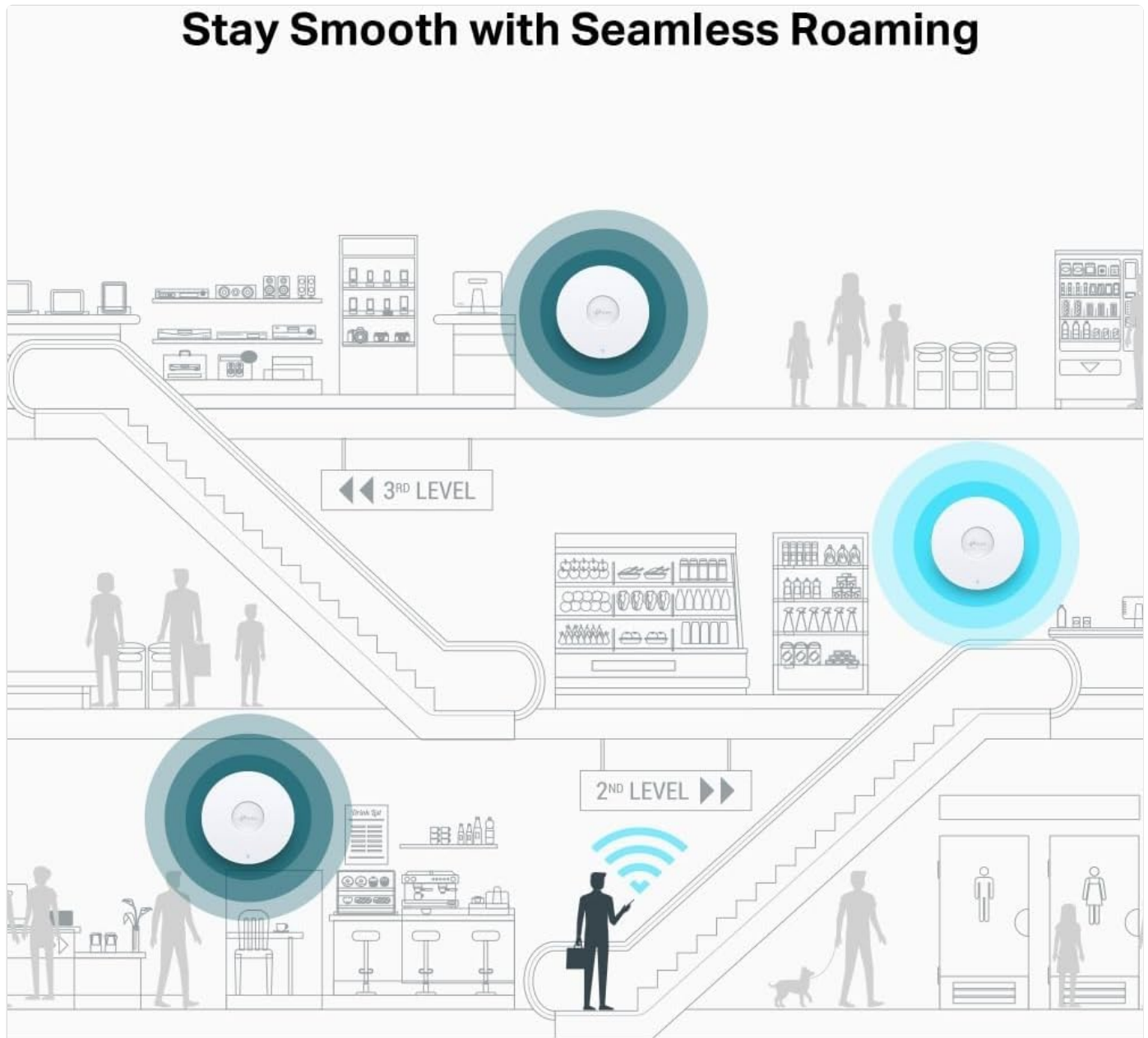
Figure 5.1: Seamless Roaming. This image depicts how multiple EAP773 units provide continuous Wi-Fi coverage, allowing devices to transition smoothly between them.

When integrated into an Omada SDN network, the EAP773 supports seamless roaming. This feature allows wireless clients to move between access points without experiencing interruptions in connectivity, ensuring a smooth and continuous user experience across large areas.