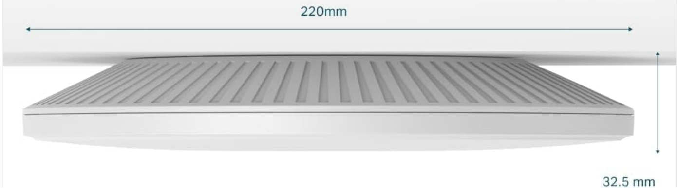
Figure 3.4: Ultra-Thin Design. The image highlights the compact and discreet form factor of the EAP773, measuring 32.5 mm in thickness.