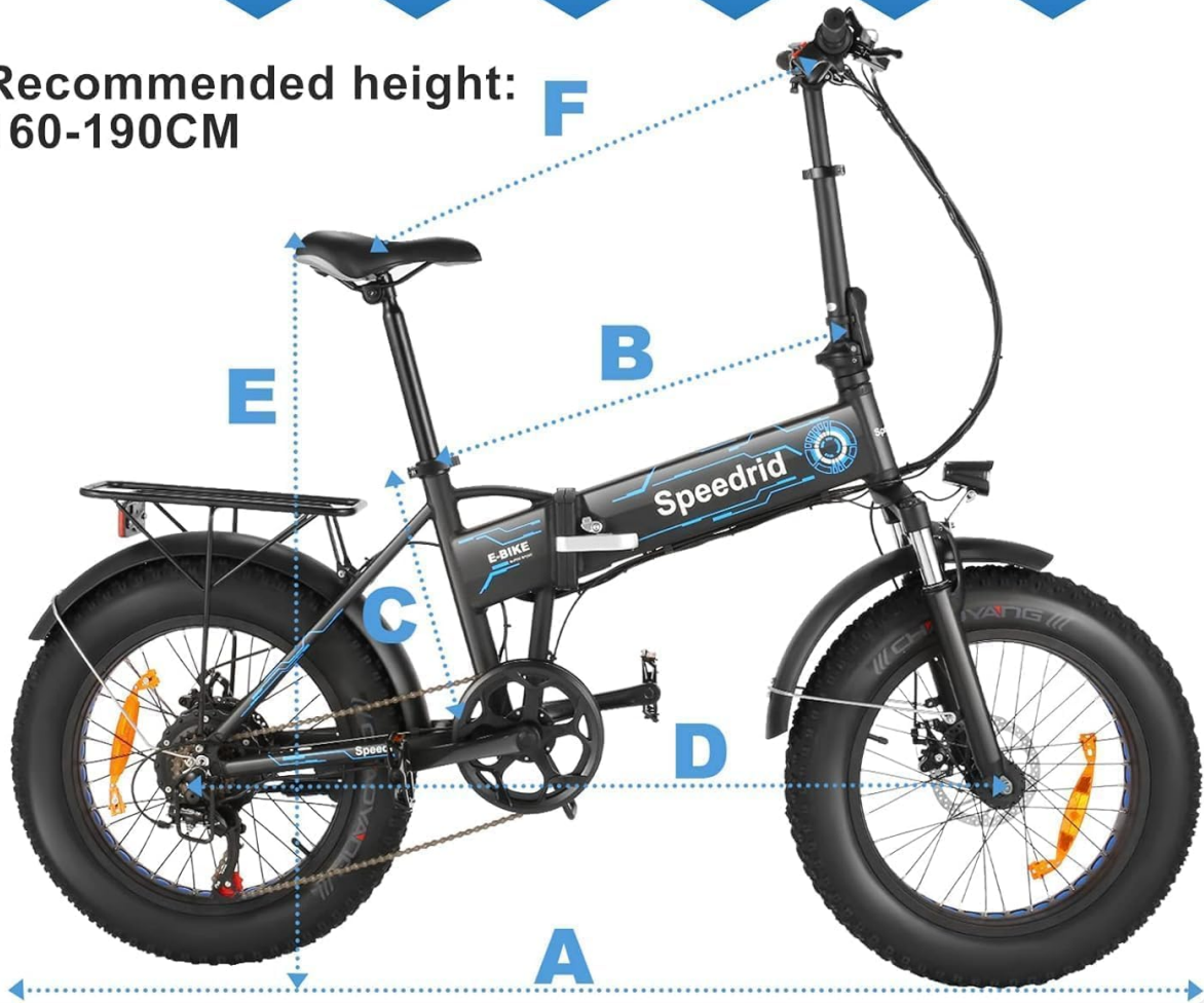
Image: Diagram illustrating the key dimensions of the ANCHEER 20-inch Folding Electric Fat Tire Bike.