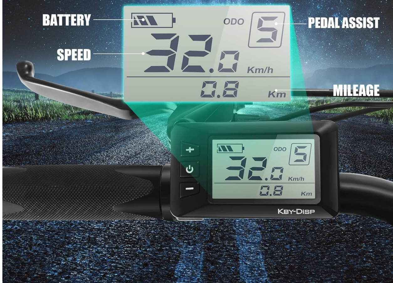
Image: The LCD display showing battery level, speed, pedal assist level, and mileage.

The Smart HD-LCD Meter provides real-time information including battery level, gear, mileage, and current speed. It also displays error codes for troubleshooting.