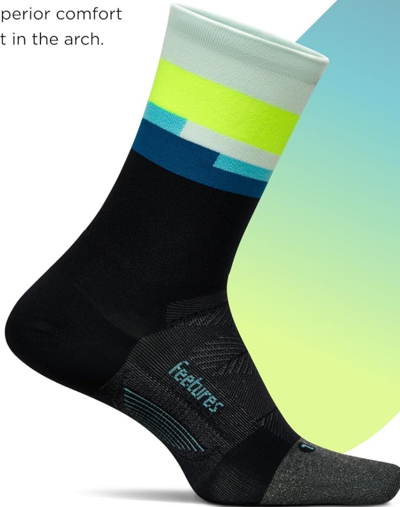
Illustration of the targeted compression zones in the Features sock, designed for enhanced arch support.

Provides superior comfort and support in the arch.