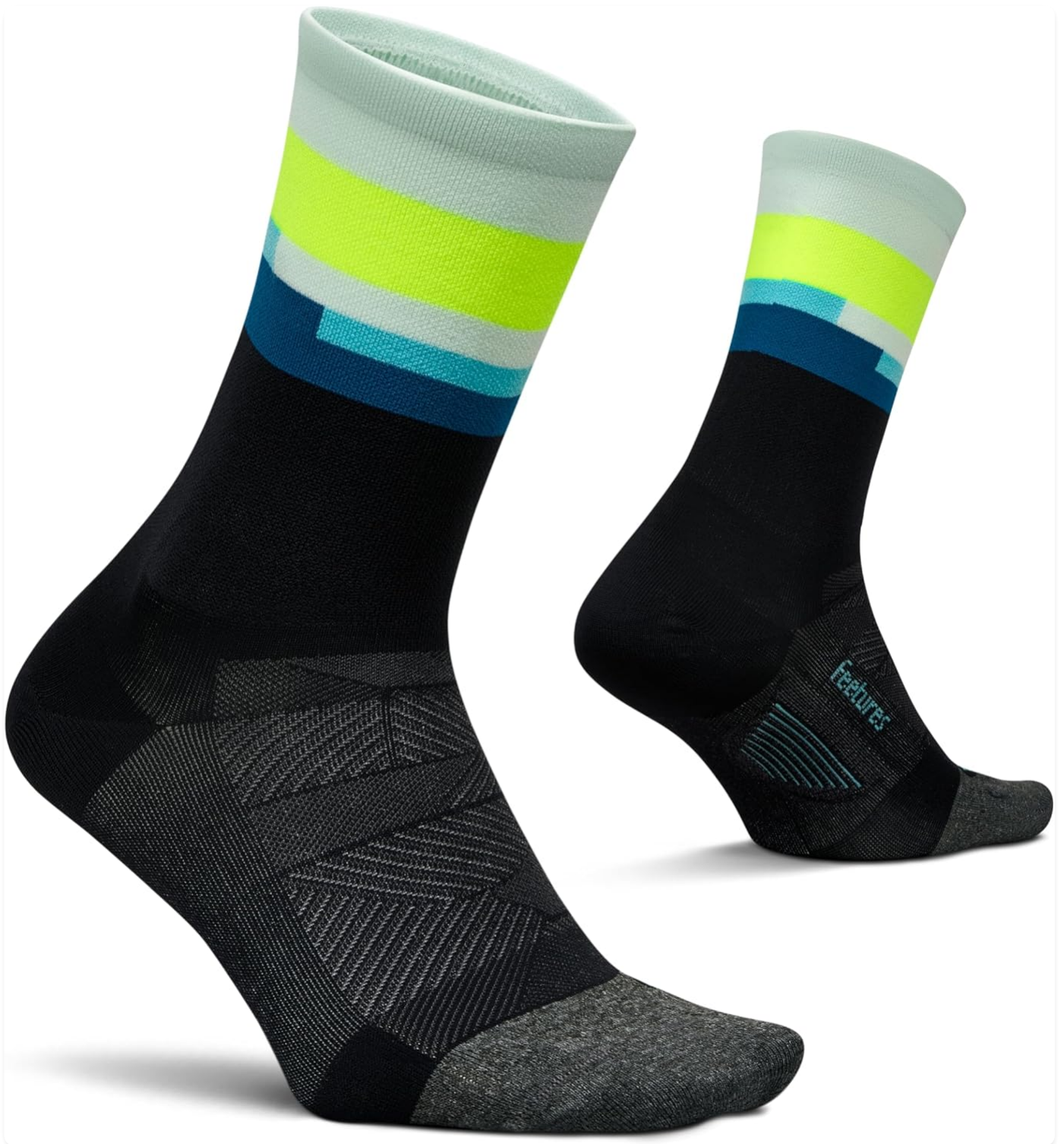
A pair of Featues Elite Ultra Light Cushion Mini Crew Socks, highlighting their sleek design and comfortable fit.