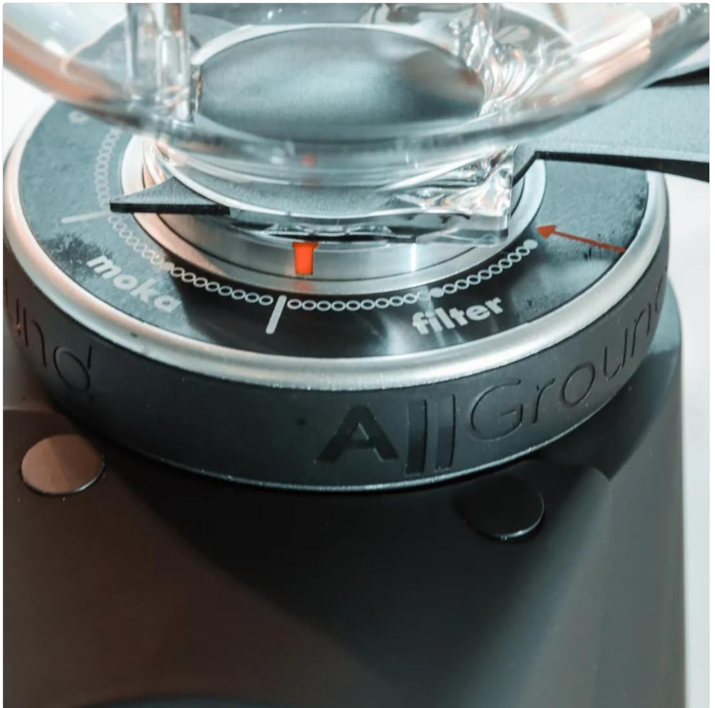
Figure 3: Detailed view of the grind adjustment dial, highlighting the settings for Moka and Filter coffee.