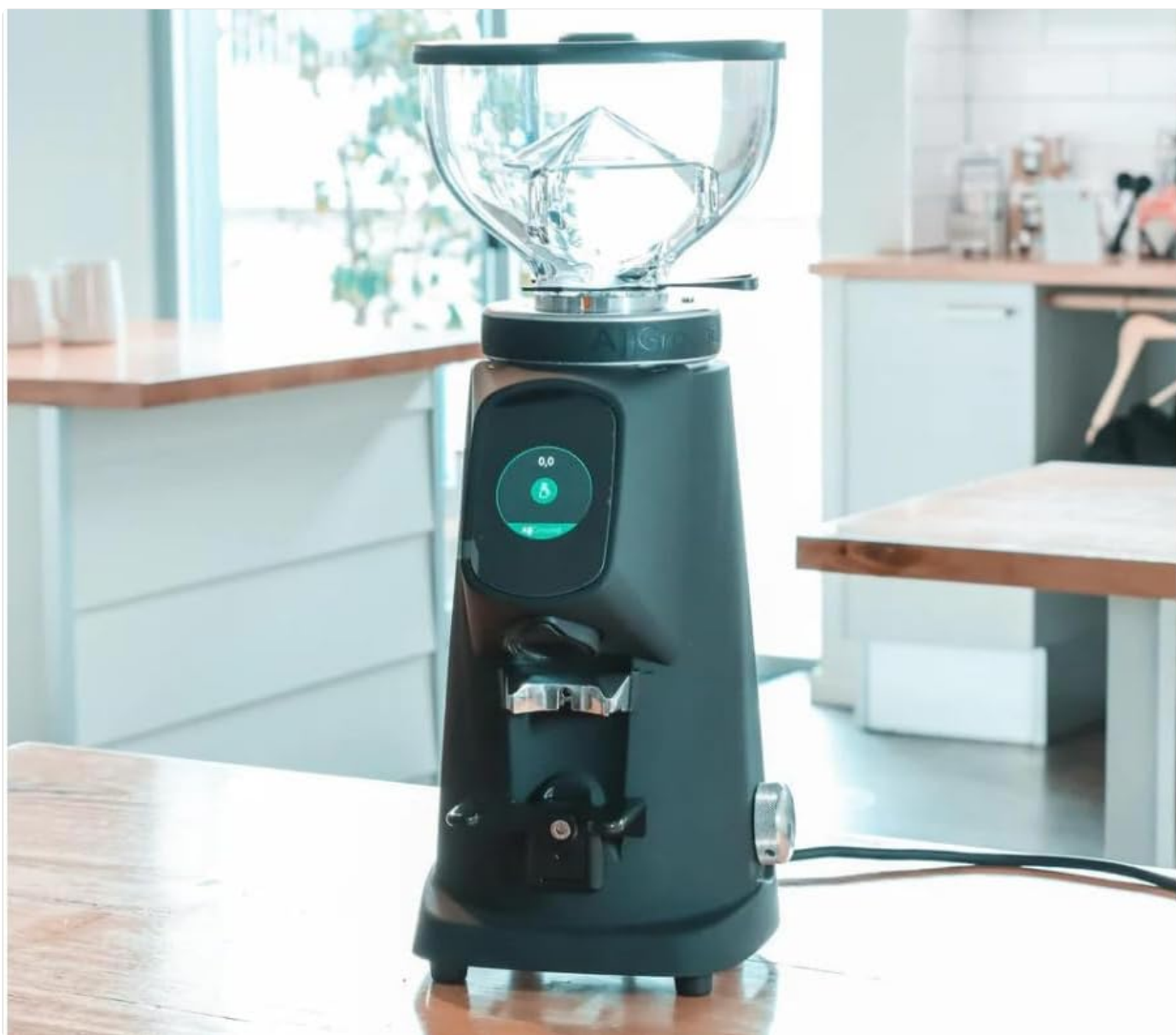
Figure 2: The Fiorenzato All Ground grinder positioned on a kitchen countertop, ready for use.

Place the grinder on a stable, flat, and dry surface. Ensure there is adequate ventilation around the unit. Avoid placing it near heat sources or in direct sunlight.