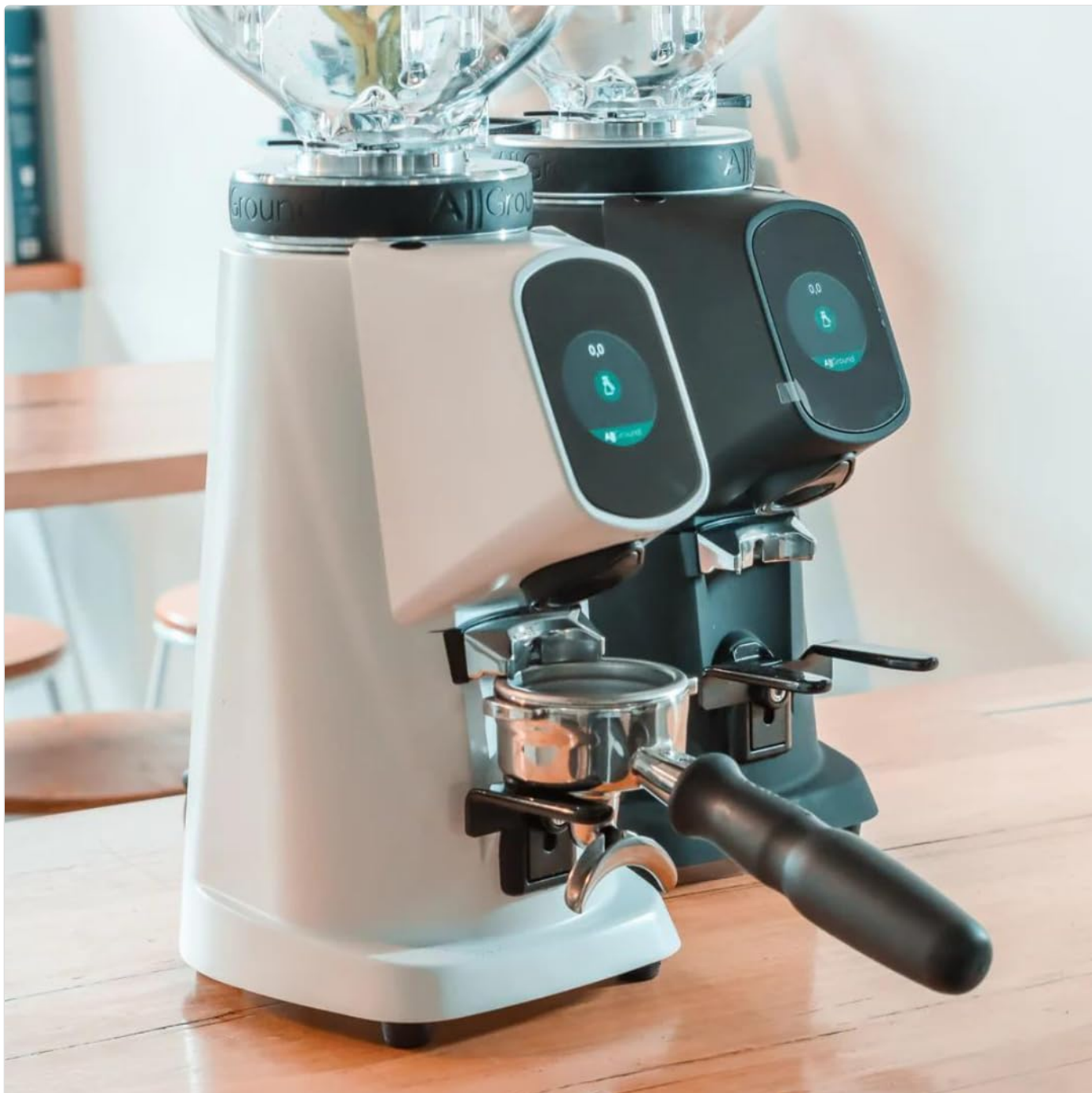
Figure 4: The white version of the Fiorenzato All Ground grinder, demonstrating the portafilter holder for direct grinding.