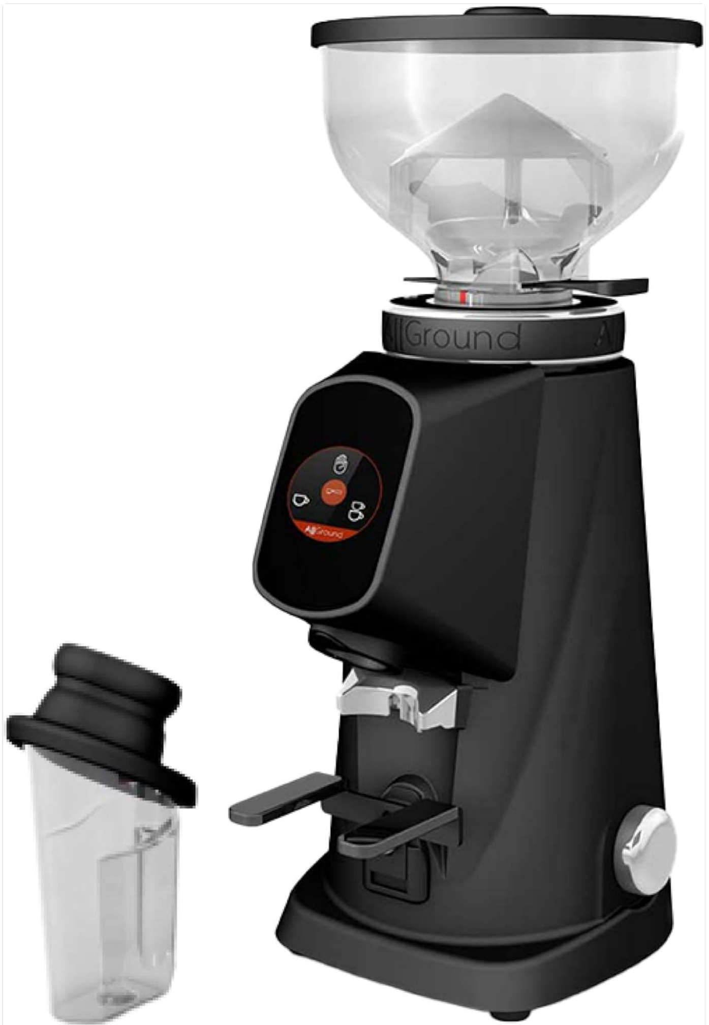
Figure 1: The Fiorenzato All Ground coffee grinder in black, showcasing its sleek design, transparent bean hopper, and included grounds container.