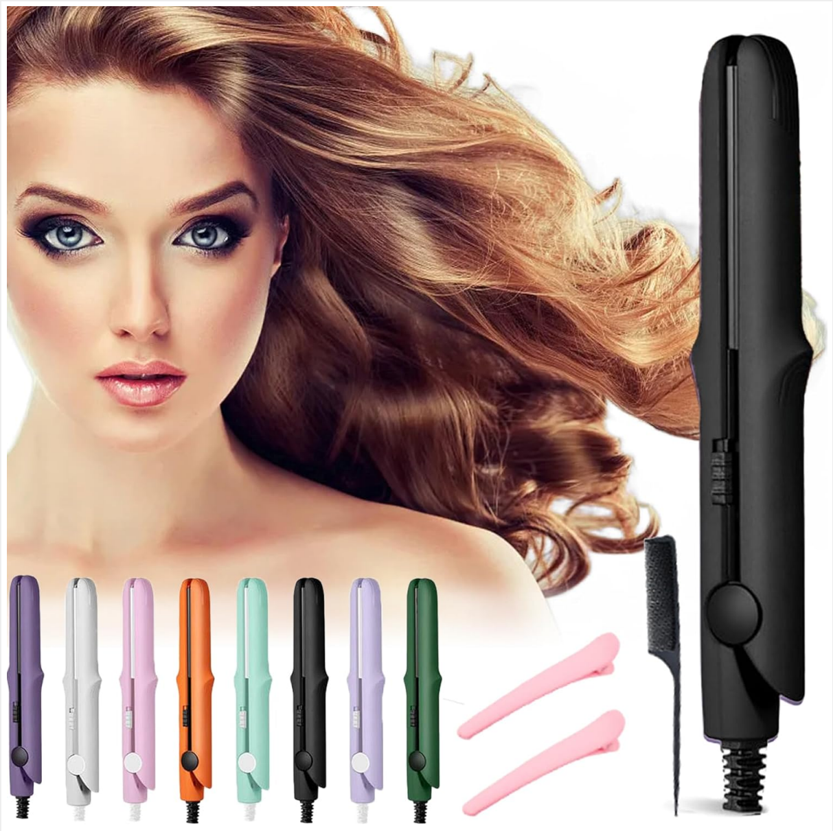
Image: The EZGHAR 2-in-1 Mini Dual Purpose Curling Iron shown with various color options and included accessories like hairpins and a comb.