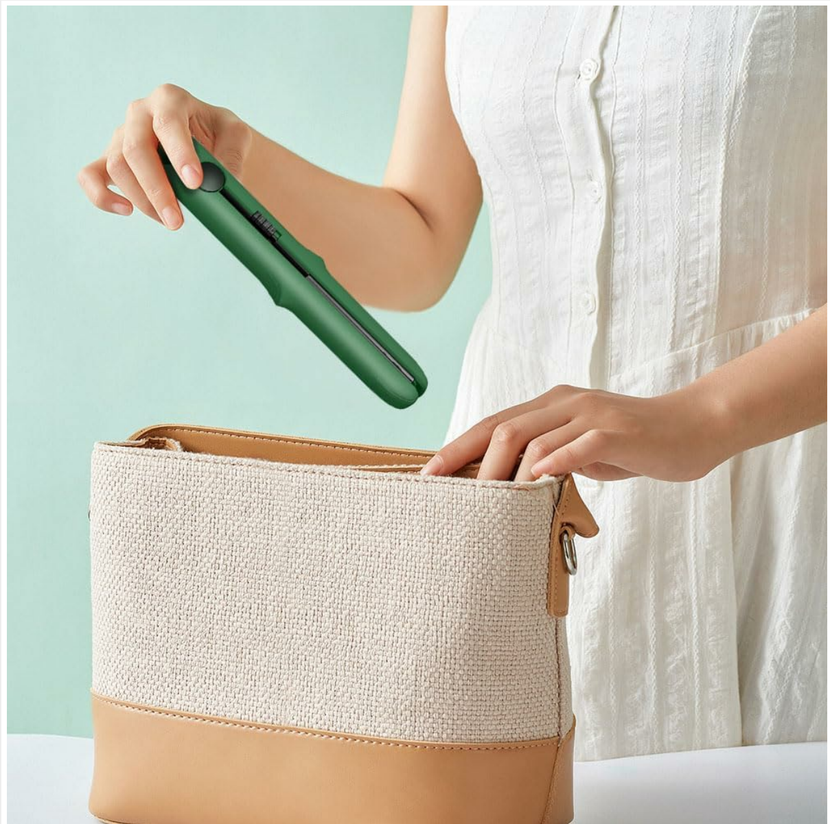
Image: A person demonstrating the compact size of the EZGHAR 2-in-1 Mini Dual Purpose Curling Iron by placing it into a handbag, highlighting its portability.

Before first use, ensure the appliance is clean and free from any packaging materials. Plug the device into a standard electrical outlet.