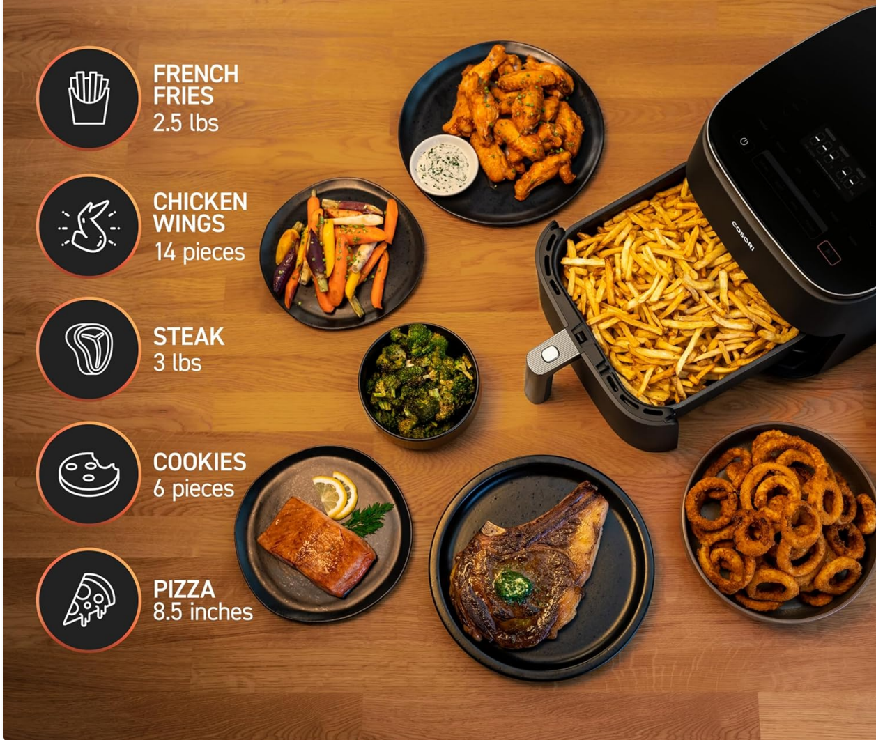
Image: The COSORI TurboBlaze Air Fryer with examples of food quantities it can hold, such as 2.5 lbs of french fries, 14 chicken wings, 3 lbs of steak, 6 cookies, and an 8.5-inch pizza.