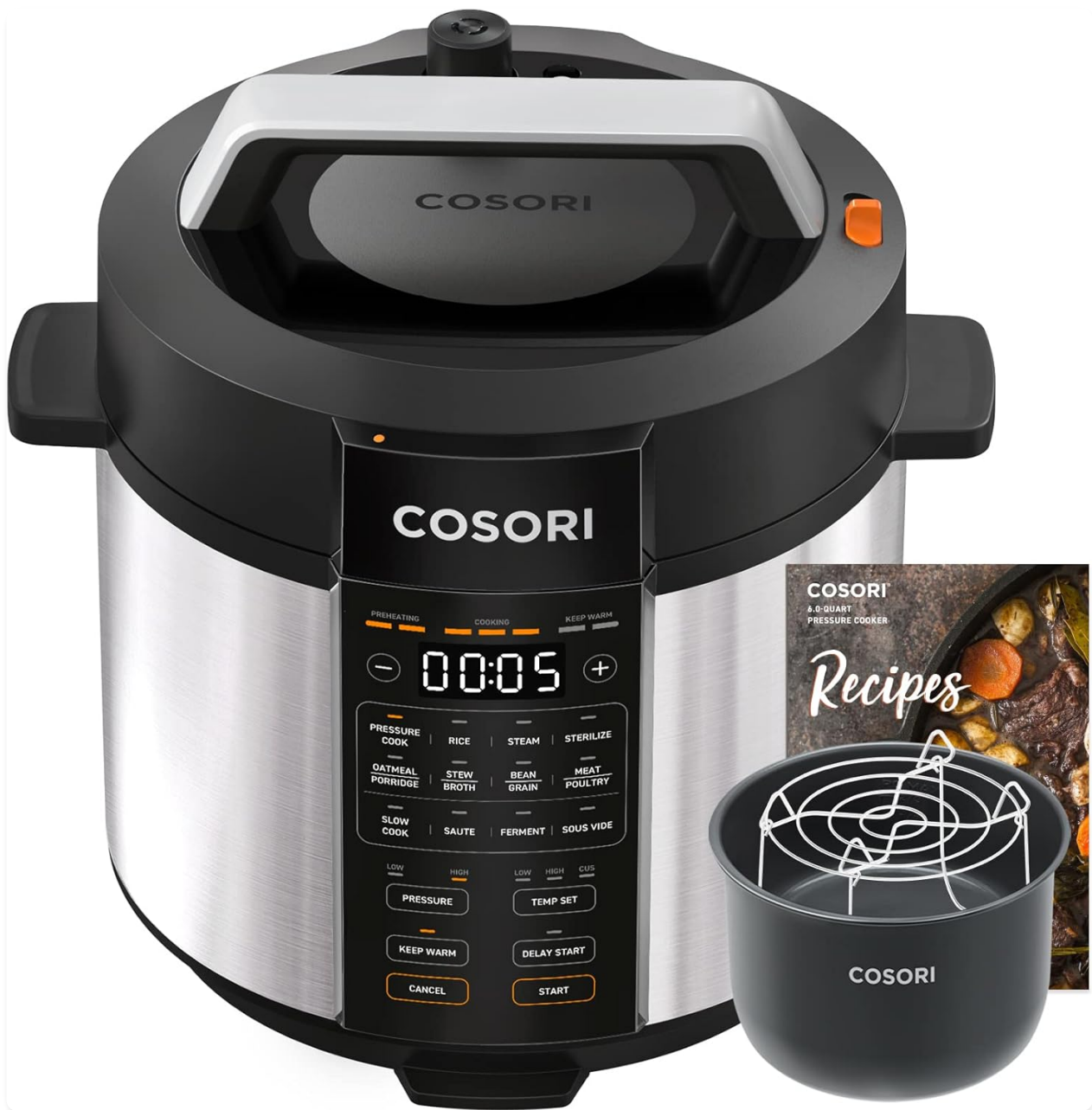
Image: The COSORI Electric Pressure Cooker, showing its control panel, lid, inner pot, and a steaming rack. A recipe book is also visible.