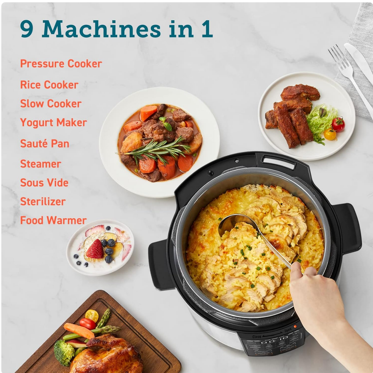
Image: A visual representation of the COSORI Electric Pressure Cooker's 9-in-1 capabilities, displaying various dishes like stew, rice, and yogurt, prepared using its different functions.