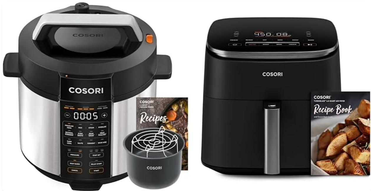
Image: The COSORI Electric Pressure Cooker (left) and the COSORI TurboBlaze 6.0-Quart Air Fryer (right) displayed together, showcasing their compact designs and included recipe books.

This manual provides instructions for two versatile kitchen appliances: the COSORI Electric Pressure Cooker and the COSORI TurboBlaze 6.0-Quart Air Fryer. Both are designed to simplify your cooking process with multiple functions and user-friendly controls.