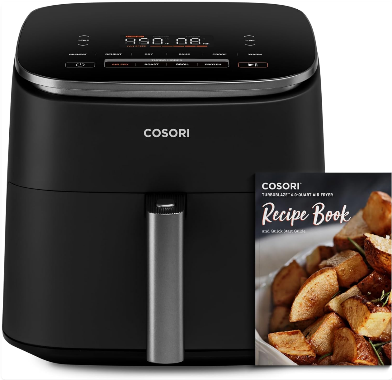
Image: The COSORI TurboBlaze 6.0-Quart Air Fryer, a sleek black appliance, shown with its pull-out basket and a recipe book.