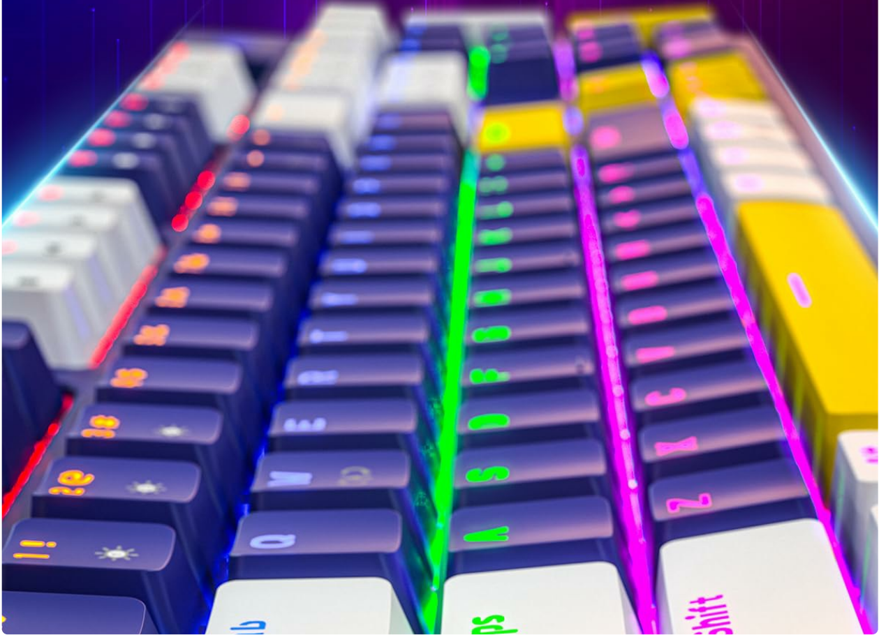
Image: The Portronics K2 keyboard displaying personalized RGB lighting effects, showcasing its dynamic illumination options.

Create a dazzling ambiance with 20+ dynamic lighting options