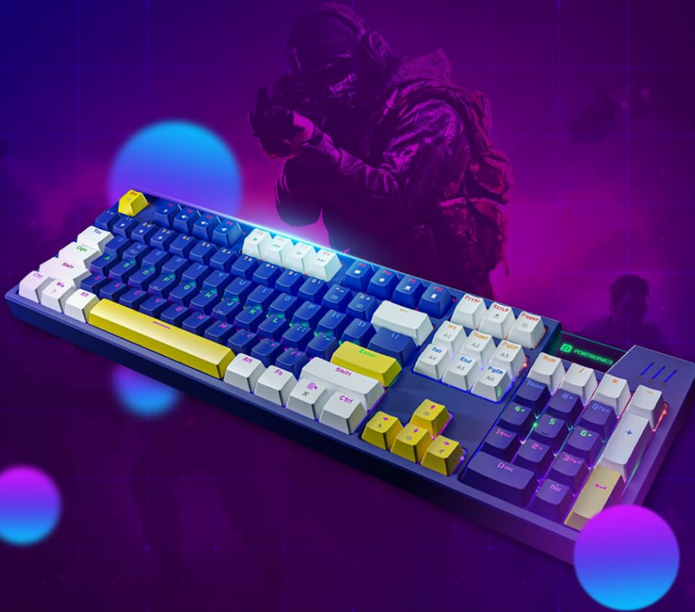
Image: The Portronics K2 Mechanical Gaming Keyboard, highlighting its precision gaming capabilities.

Game like a pro with this high-performance mechanical keyboard