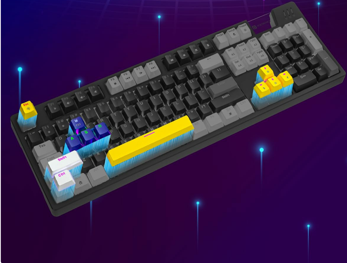
Image: The Portronics K2 keyboard with highlighted keys, visually representing the anti-ghosting feature that prevents command loss when multiple keys are pressed.

Press multiple keys at once without losing any commands