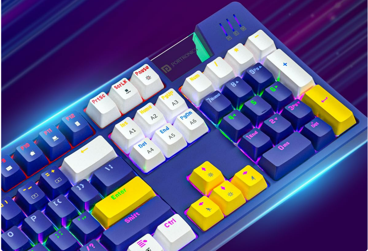
Image: A close-up of the Portronics K2 keyboard keys, emphasizing its durability with a 50 million keystroke rating.

Outlast the competition with over 50 million keystrokes under your fingertips