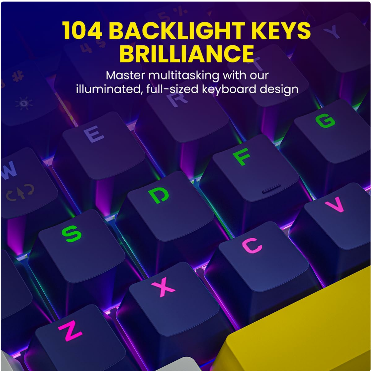
Image: A section of the Portronics K2 keyboard, highlighting its 104 backlit keys for enhanced visibility and brilliance.

Master multitasking with our illuminated, full-sized keyboard design