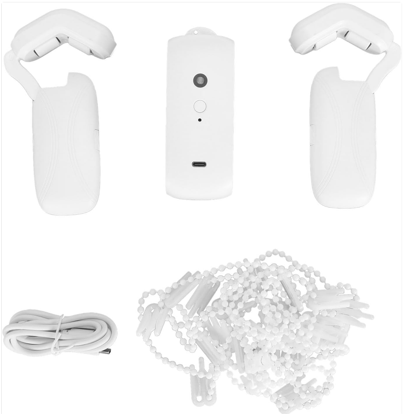
Image: All components included in the package: main unit, two curtain robots, USB charging cable, and bead chain for installation.