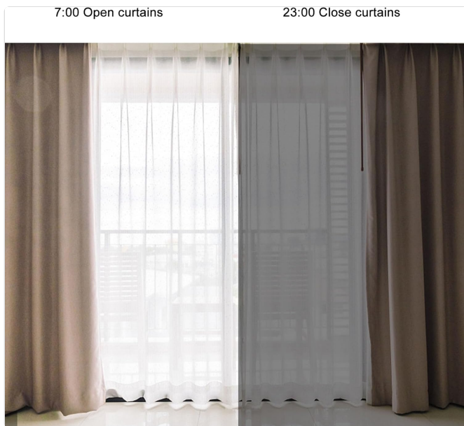
Image: A visual demonstration of timed curtain operation, showing curtains fully open at 7:00 AM and fully closed at 11:00 PM (23:00).