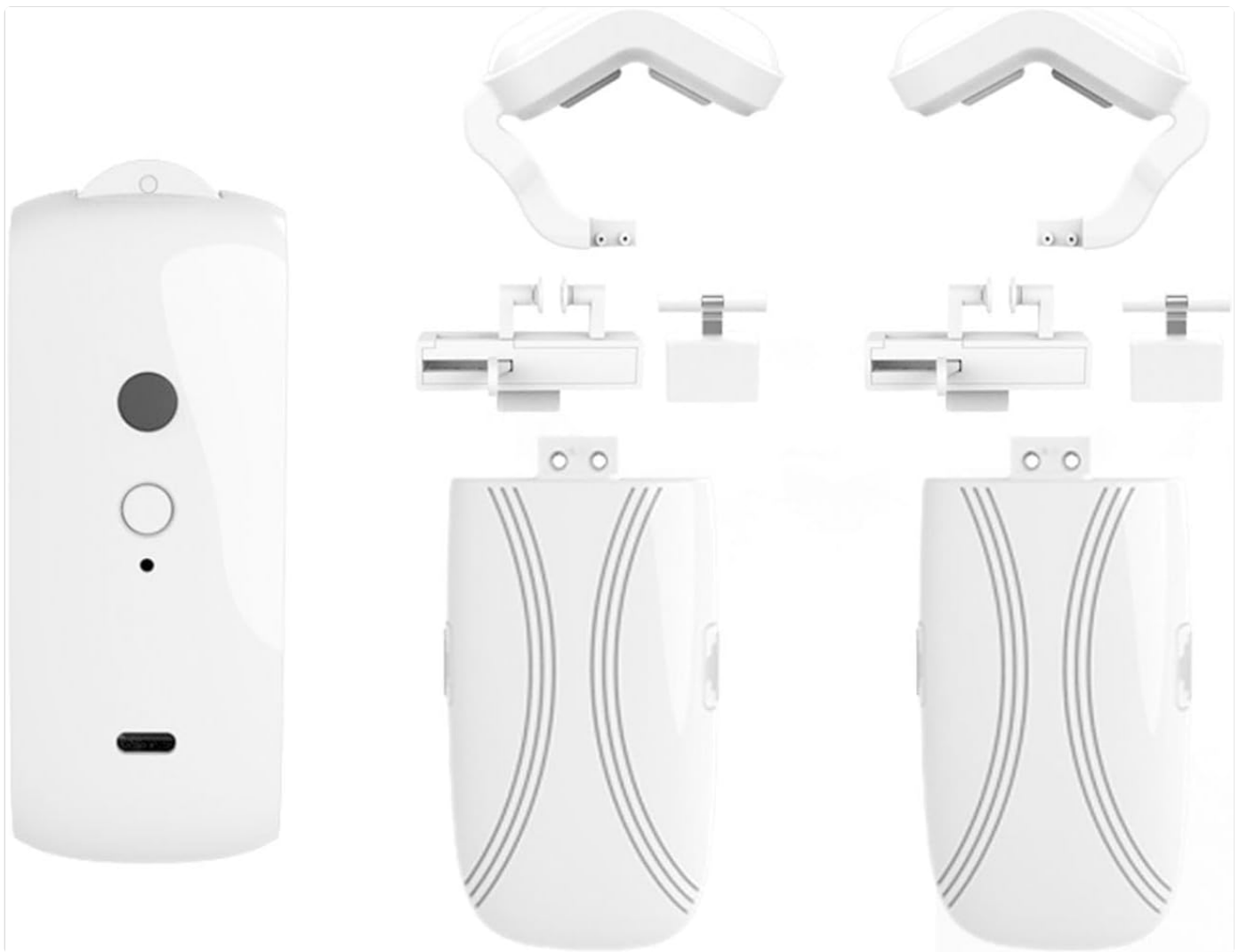
Image: The Cryfokt Automatic Curtain Opener system, showing the main control unit and two curtain robot modules designed for Roman rods.