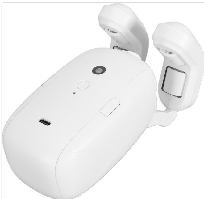
Image: A detailed view of the main control unit, showing its compact design and the USB charging port.