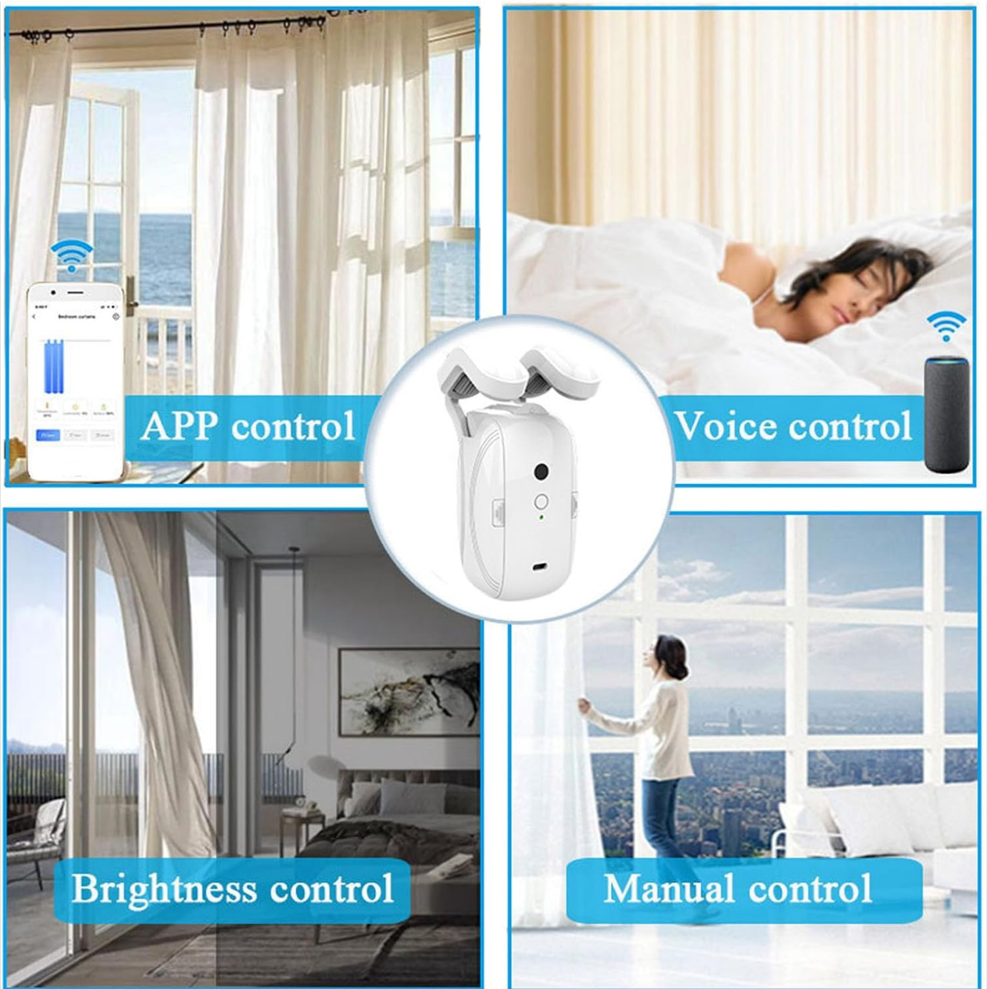
Image: A collage illustrating the four primary control methods: APP control, Voice control, Brightness control (automatic light sensing), and Manual control (hand pull).