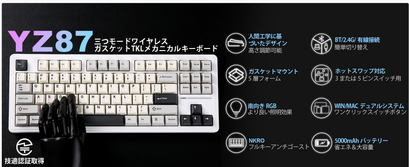
Image: Overview of YUNZII YZ87 key features, including gasket mount, multi-mode connectivity, and RGB lighting.