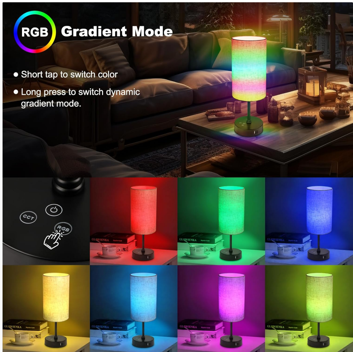
Image 4.4: RGB color changing and gradient modes for ambient lighting.