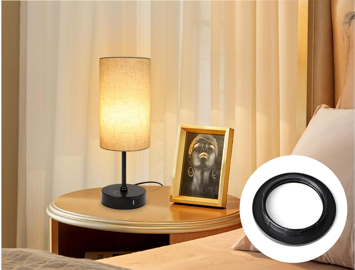
Image 3.1: Lamp shade installation. Unscrew the ring, place the shade, then re-screw the ring to secure.

Before install lamp shade, please take the ring out of the lamp holder, and then screw the lamp shade with ring.