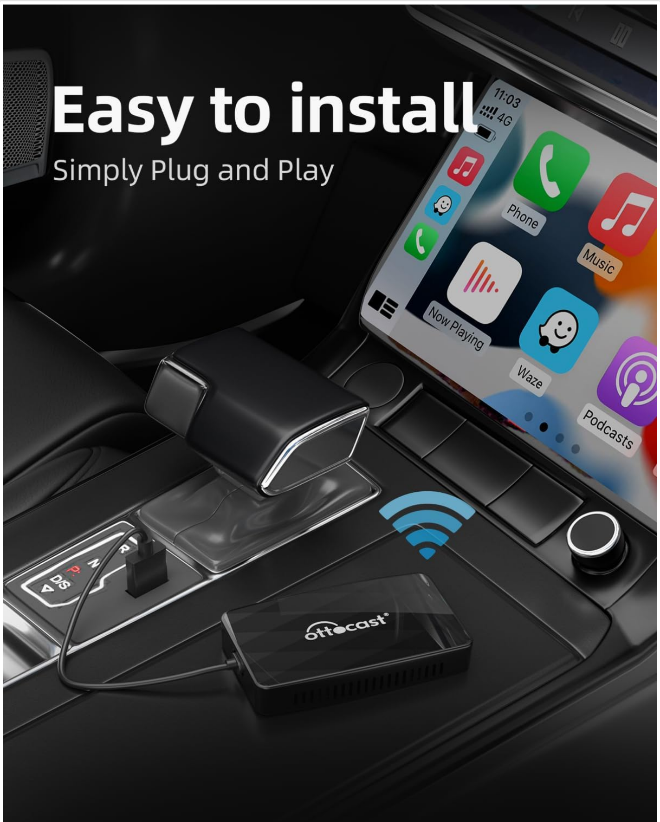
Image: The OTTOCAST MX adapter connected to a car's USB port, illustrating the simple plug-and-play installation process.