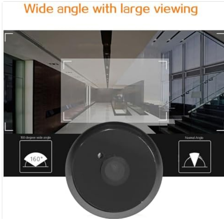
Figure 2: Outdoor Camera and Indoor Display Unit

Video 1: Installation Guide for Door Peephole Camera. This video demonstrates the physical installation process of the peephole camera and indoor monitor.