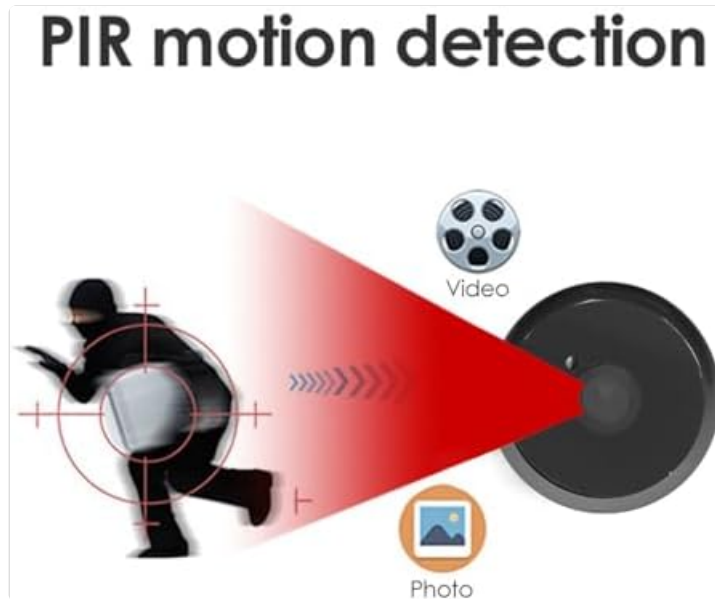
Figure 4: Motion Detection Functionality

The device features motion detection. When motion is detected, the camera will automatically record a visitor portrait or video message, which is saved to the Micro Memory Card.