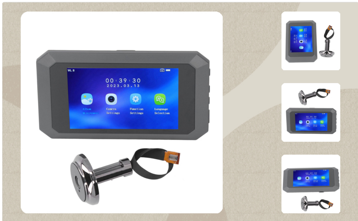
Figure 5: Night Vision Function

The integrated infrared fill light ensures clear visibility even in low-light conditions or at night.