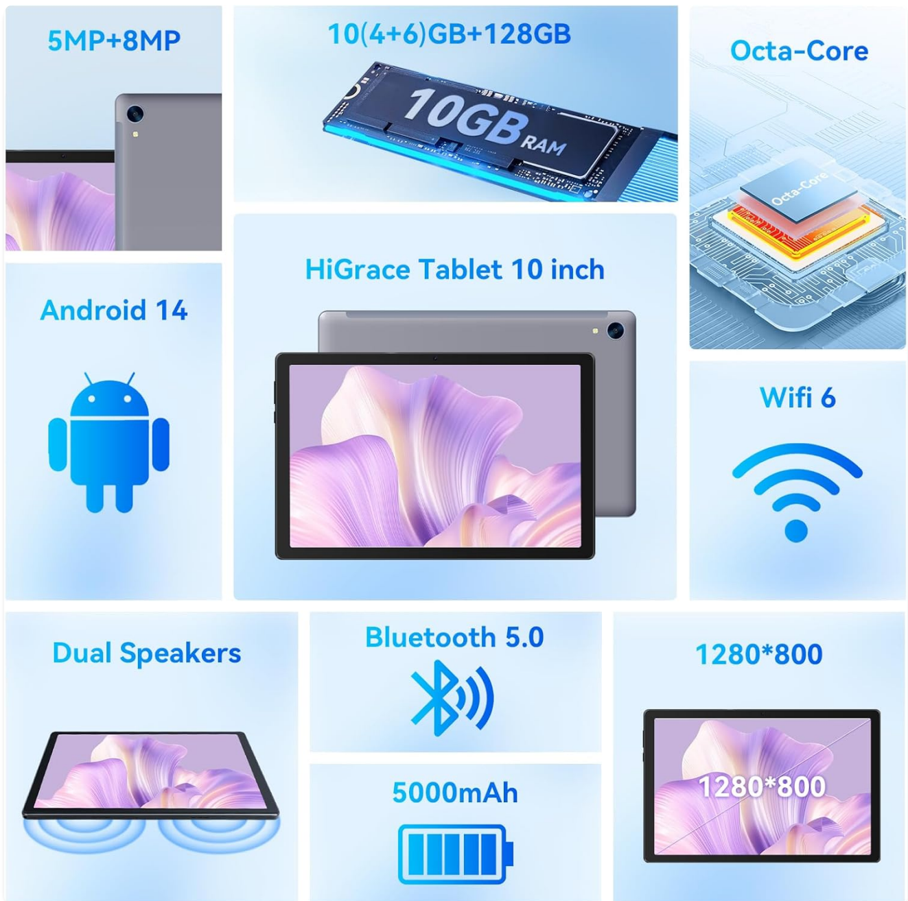
Image: A visual breakdown of the tablet's key specifications including 5MP+8MP cameras, 10GB RAM, Octa-Core CPU, Android 14, Wi-Fi 6, Bluetooth 5.0, 5000mAh battery, 1280x800 HD display, and dual speakers.