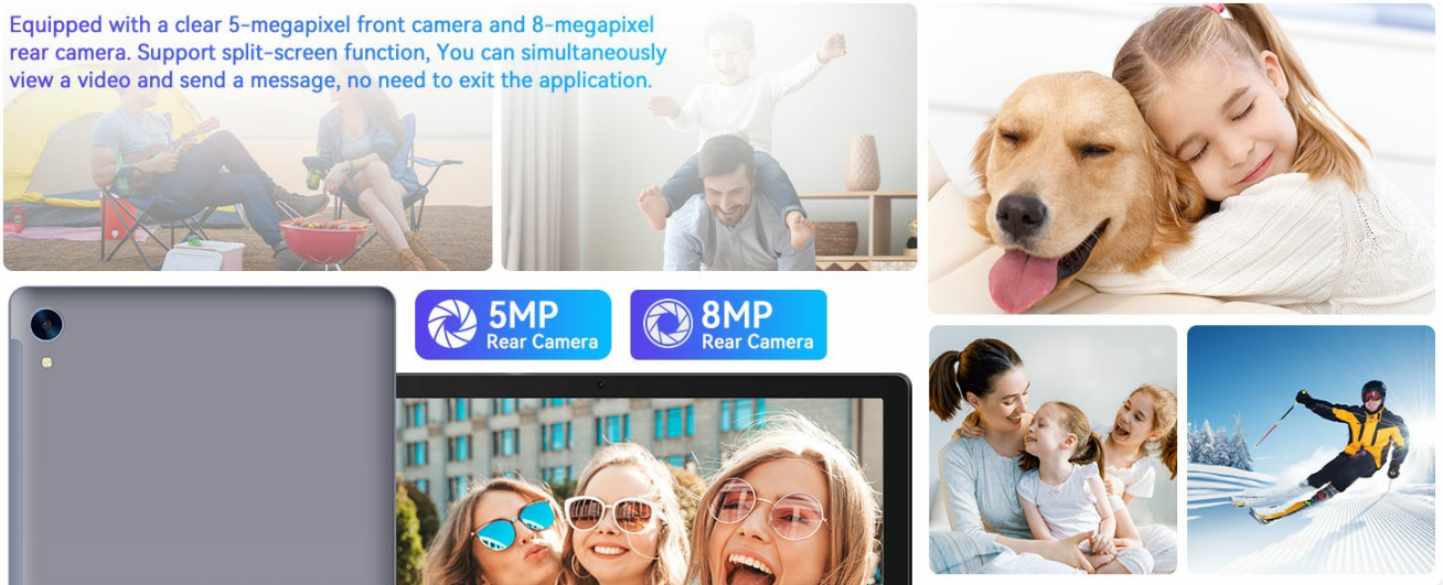
Image: The tablet demonstrating its split-screen capability, displaying multiple applications running concurrently for enhanced productivity.

Equipped with a clear 5-megapixel front camera and 8-megapixel rear camera. Support split-screen function, You can simultaneously view a video and send a message, no need to exit the application.