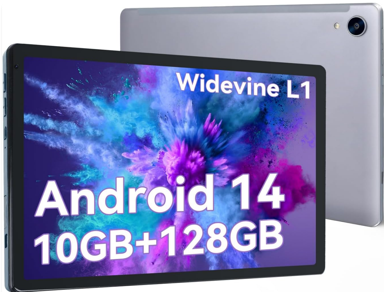
Image: The HiGrace 10-inch Android 14 Tablet shown with its included accessories: charger, USB-C cable, and user guide.