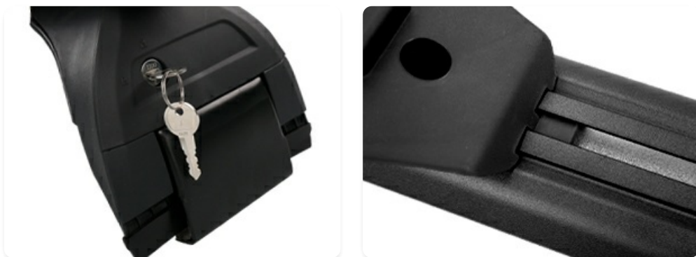
Figure 4.3: Details of the locking mechanism and crossbar connection.