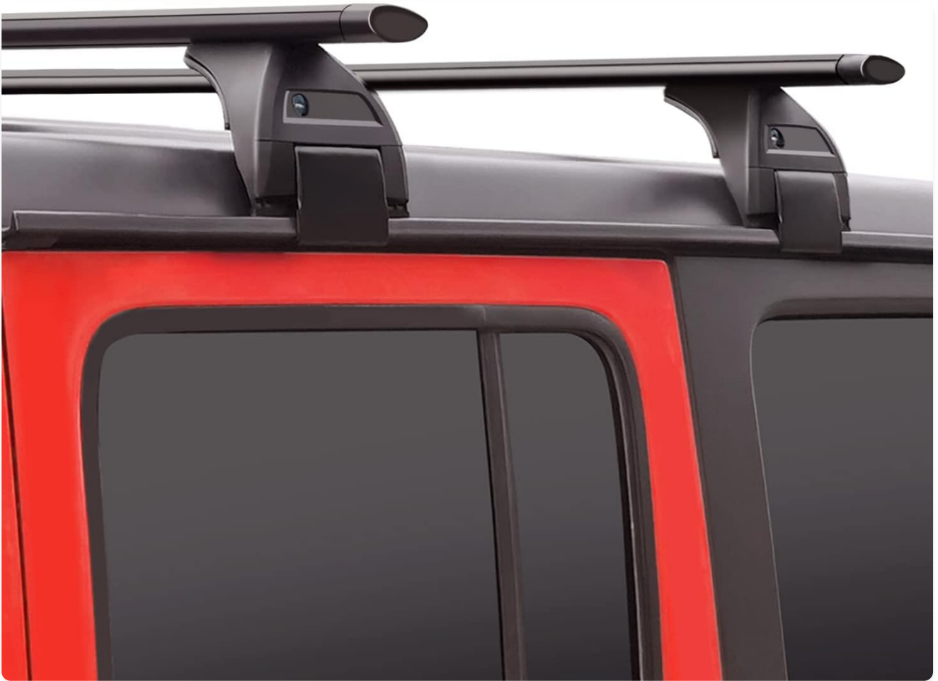
Figure 1.1: Wonderdriver Roof Rack Cross Bars installed on a Jeep Wrangler.