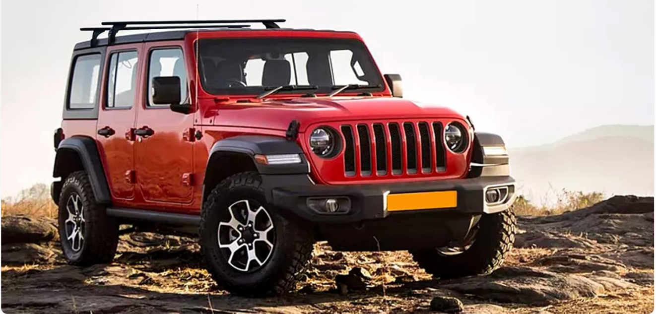
Figure 5.1: Examples of equipment that can be carried on the roof rack.