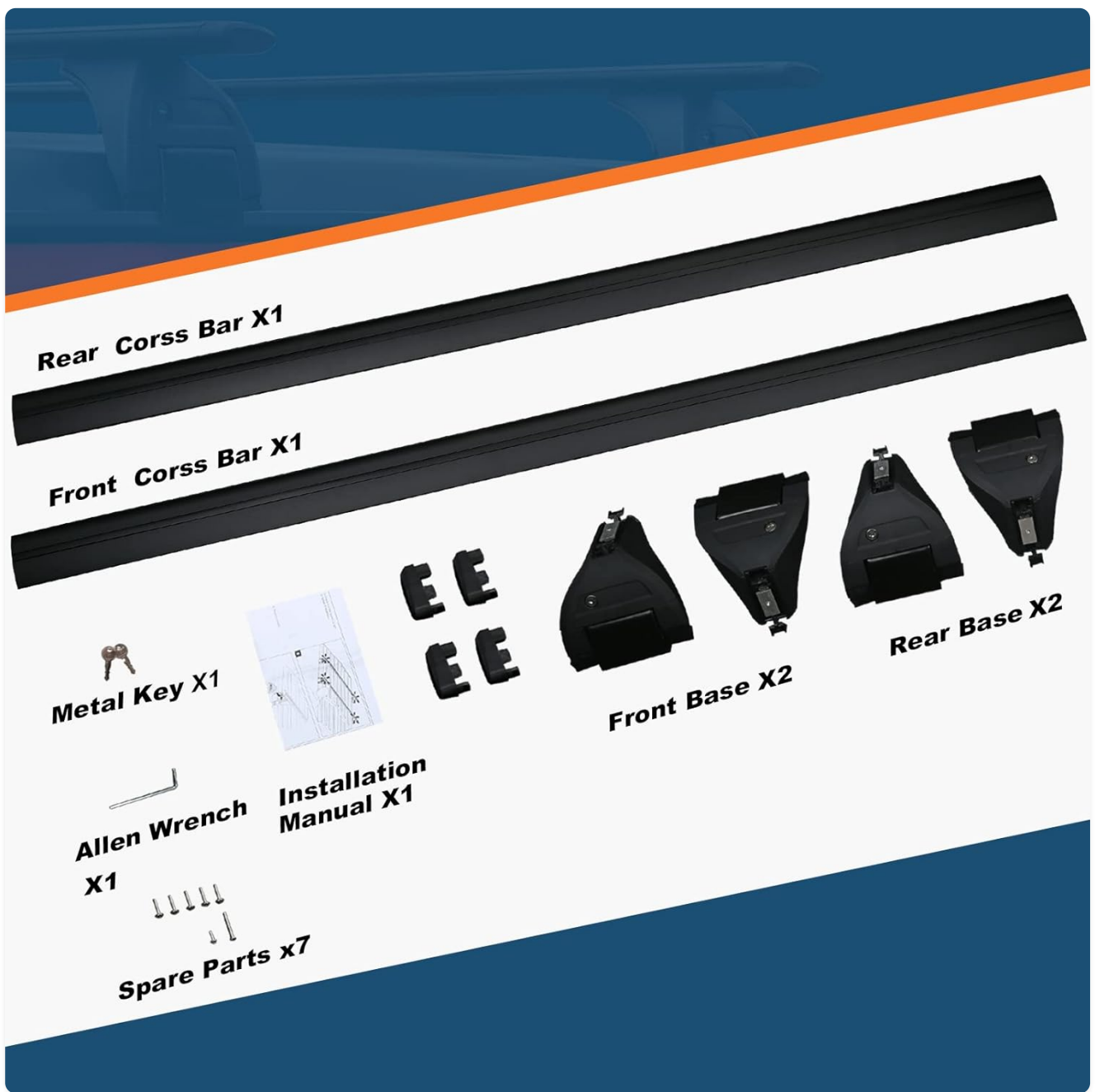
Figure 2.1: All components included in the package.