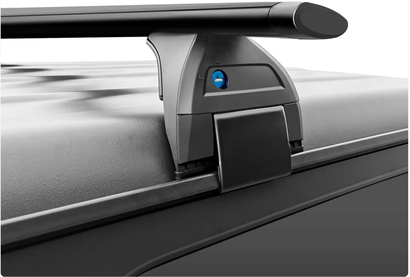
Figure 4.2: Detail of the anti-theft lock mechanism.