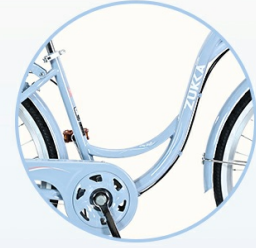
Low Stand-Over Design

Image 4: Versatile Riding. This image shows the ZUKKA Cruiser Bike being used in various environments, including beach cycling, city street cycling, commuting, and park cycling, demonstrating its adaptability.