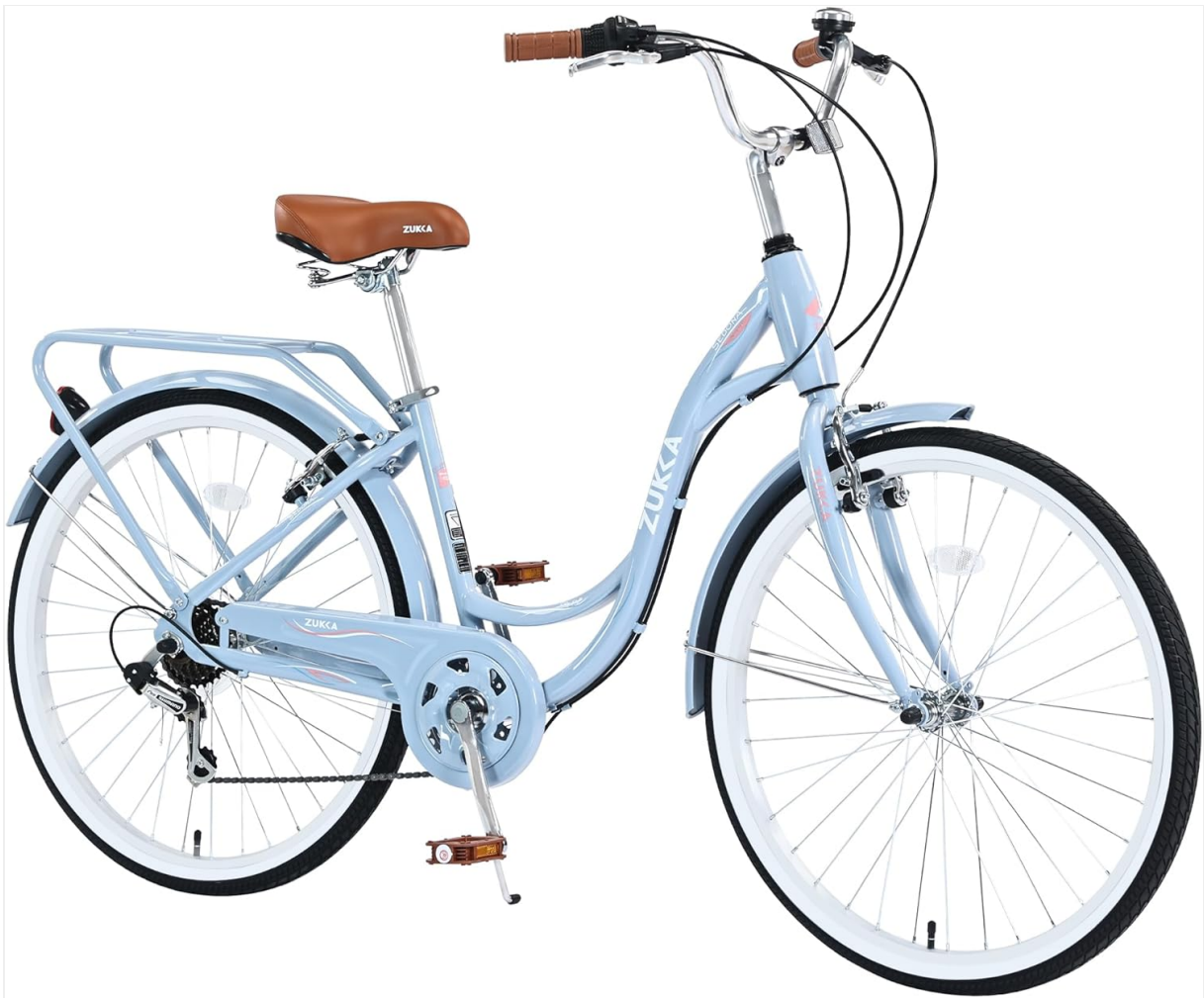
Image 1: ZUKKA 26 Inch Cruiser City Commuter Bike. This image shows the complete bicycle from a front-side angle, highlighting its blue frame, brown seat, and handlebars.