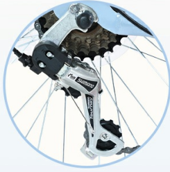
Sensitive Shifting System