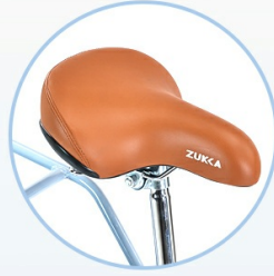
Comfortable Bike Saddle