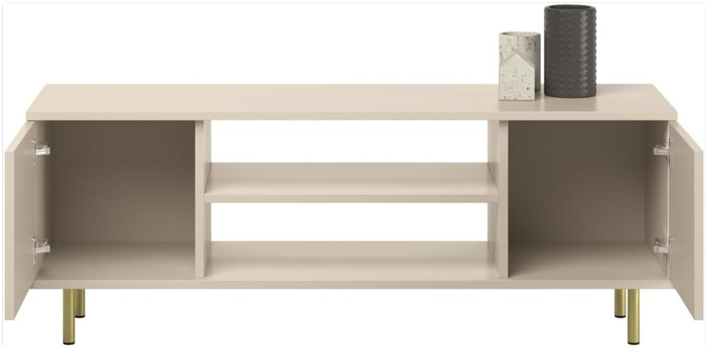
Figure 3: The Kobi Focus TV cabinet with its side doors open, revealing the internal storage compartments. The central open shelf area is also visible, demonstrating the cabinet's functional design for organizing media devices and other items.