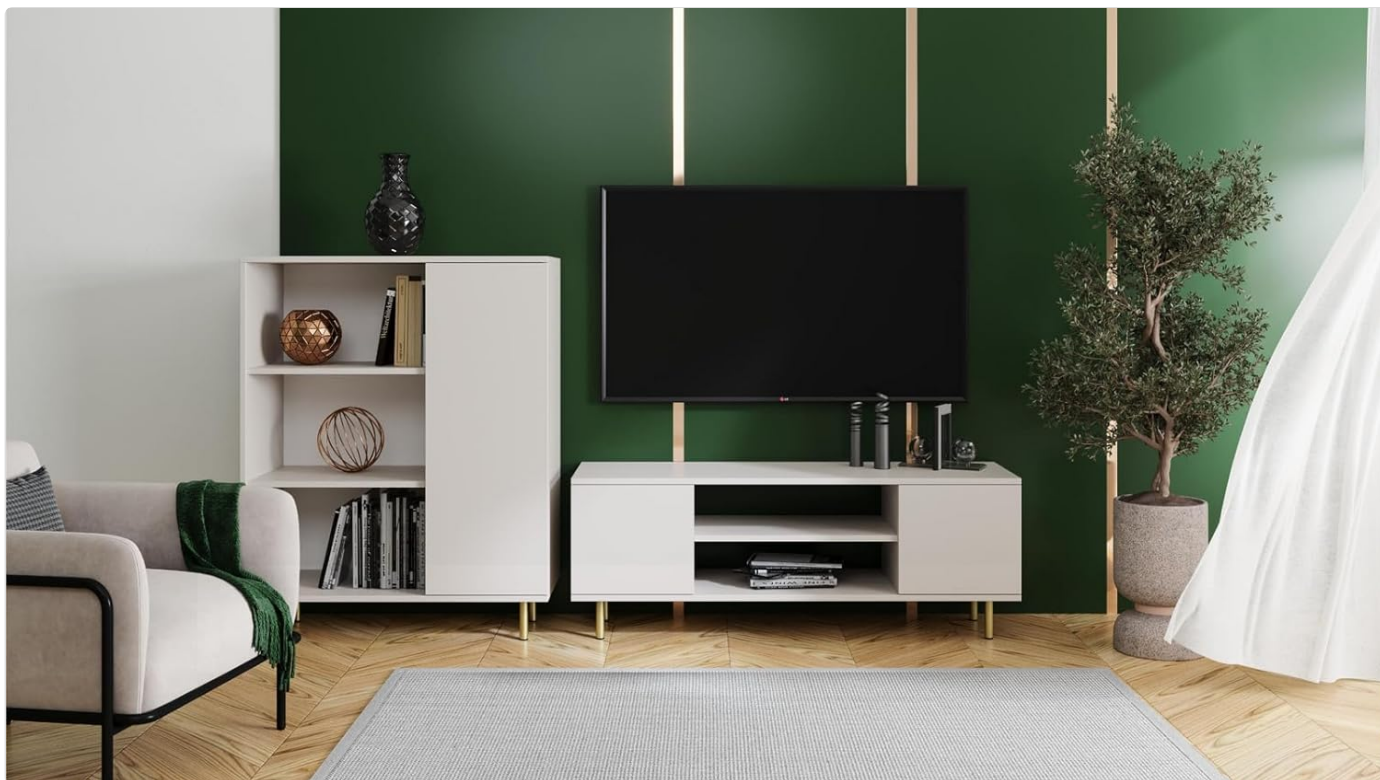
Figure 4: The KOBİ Focus TV cabinet integrated into a modern living room. It is positioned beneath a wall-mounted television, accompanied by a matching tall shelving unit to its left. The room features a green accent wall, a light-colored rug, and a potted plant, showcasing the cabinet's aesthetic appeal in a home environment.