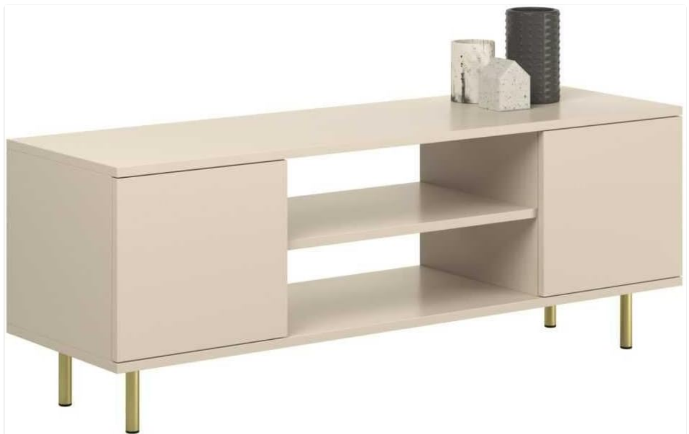
Figure 1: An assembled KOBI Focus TV cabinet in cashmere finish, featuring two closed cabinets on the sides and an open central shelf with two compartments. The cabinet stands on four elegant gold-colored metal legs.

The KOBI Focus TV cabinet is a functional, yet original and eye-catching element for your living room. The FOCUS model is equipped with a shelf and lockable cabinets where you can store books, newspapers, or remote controls for audio equipment. The cabinet is made of high-quality furniture panels laminated on both sides in trendy colors. The advantage of our cabinets is their durability. The FOCUS model is lightweight, allowing you to quickly move it and change its arrangement when you get tired of your living room decor.