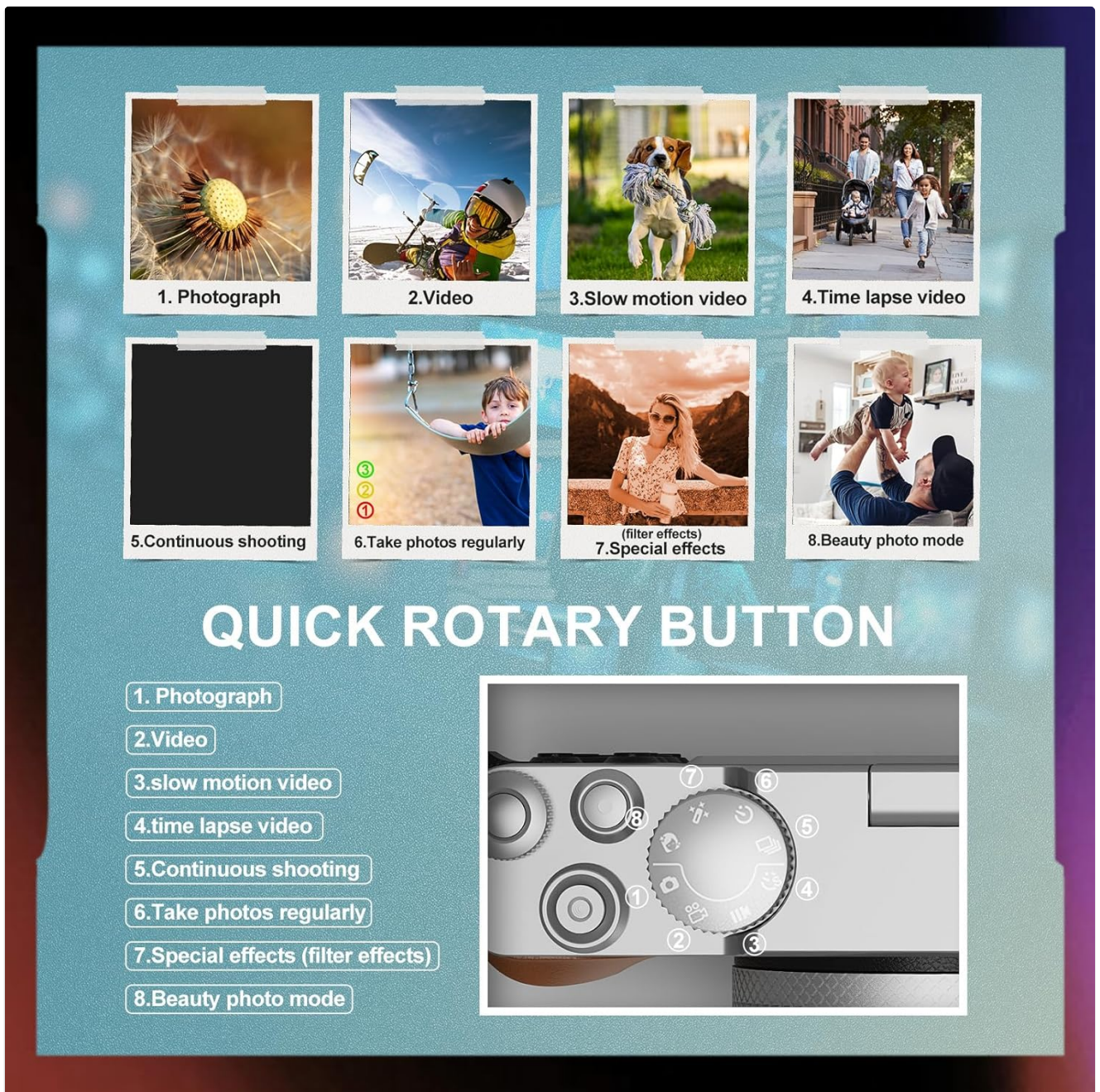
Image: Diagram illustrating the Quick Rotary Button and its various shooting modes, including Photograph, Video, Slow Motion, and Special Effects.

2. Focus: Half-press the Shutter button to activate autofocus. The camera will adjust focus automatically.