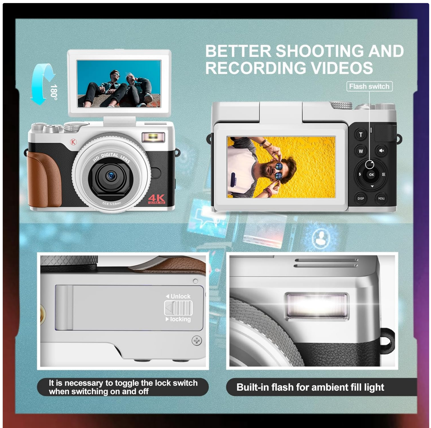
Image: Front and back view of the NBD K100 camera, highlighting the adjustable screen, built-in flash, and the battery compartment lock switch.

Familiarize yourself with the camera's components.