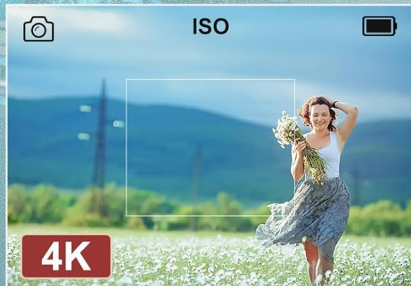
Image: Visual representation of the camera's 4K video and 56MP photo capabilities, demonstrating 16X digital zoom and the difference between 2K and 4K output.