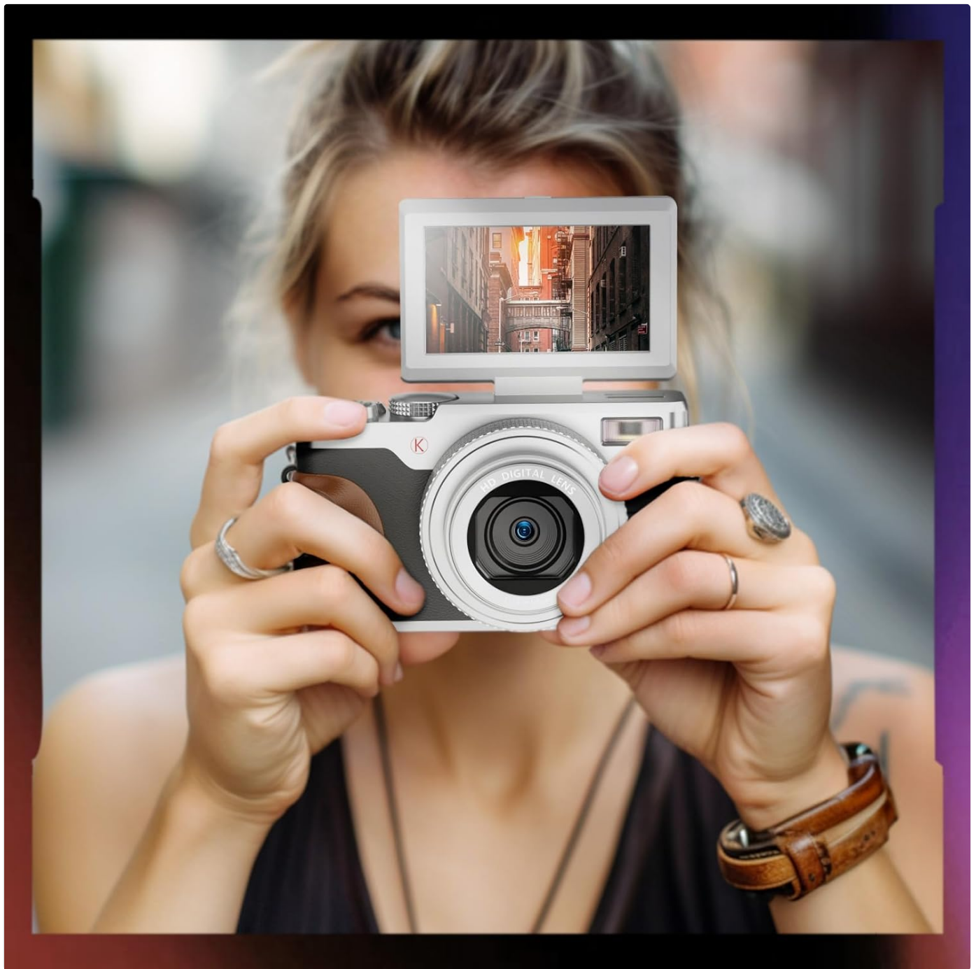
Image: A user holding the NBD K100 camera, demonstrating the 180-degree rotatable screen flipped upwards, ideal for selfies or vlogging.

The 3-inch screen can rotate 180 degrees, allowing for flexible viewing angles. This is particularly useful for vlogging, selfies, or shooting from high or low perspectives.