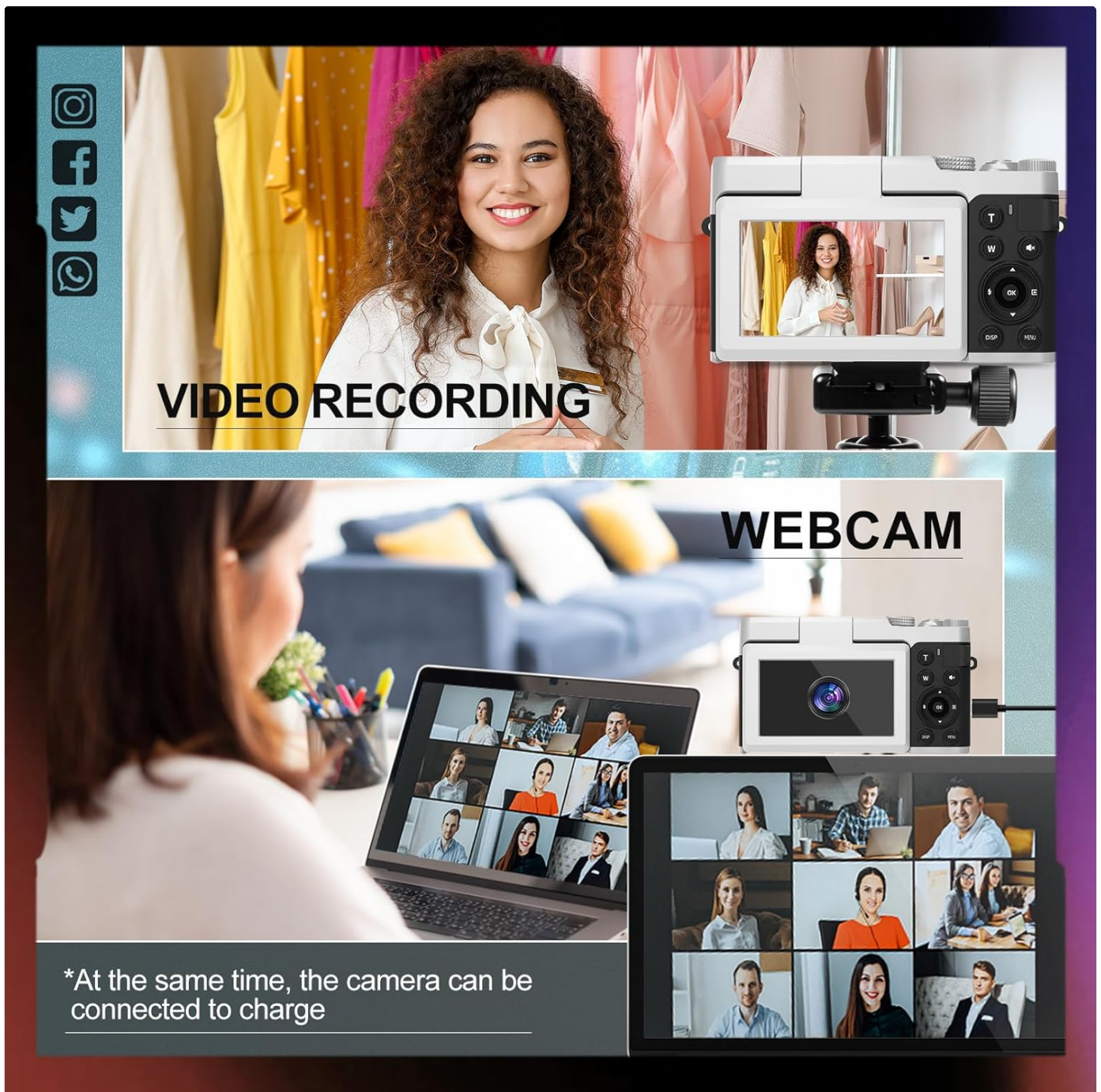
Image: The NBD K100 camera shown in two scenarios: recording video and functioning as a webcam connected to a laptop and a tablet for video conferencing.

Connect the camera to your computer via the USB cable to use it as a webcam for video calls or live streaming. Ensure the camera is powered on and select the webcam option if prompted.