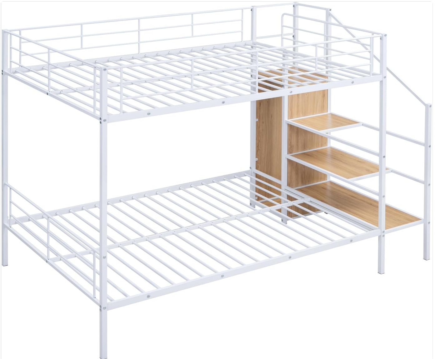
Image: Angled view of the Flieks bunk bed, highlighting the integrated storage ladder and wardrobe structure.