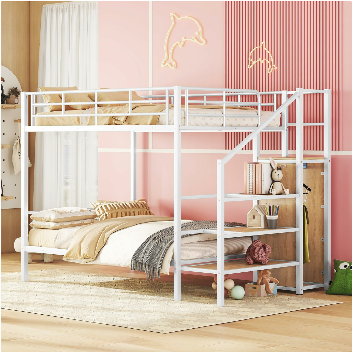
Image: Overall view of the Fliexs Full Over Full Metal Bunk Bed in white, featuring the integrated storage ladder and wardrobe.