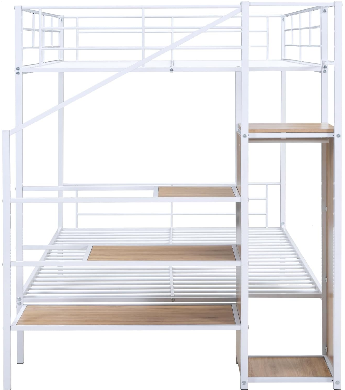
Image: Close-up view of the three-layer storage shelves integrated into the bunk bed's ladder structure.