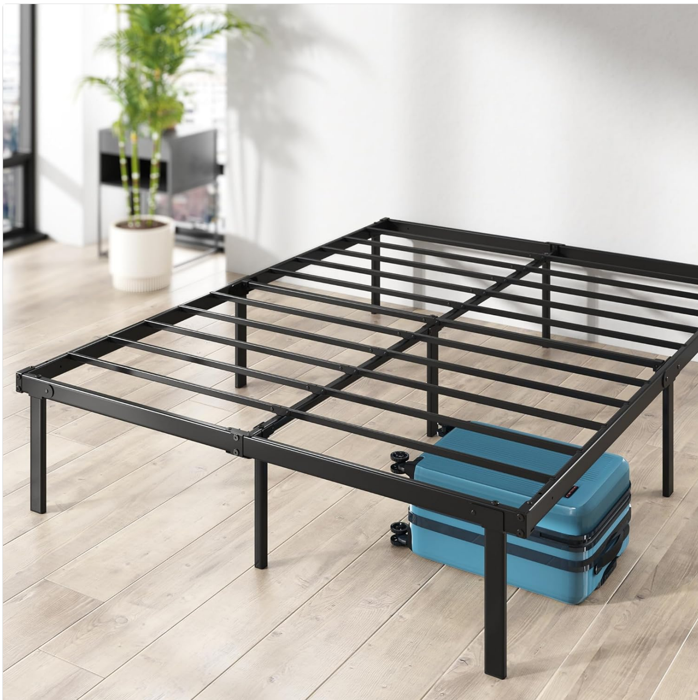
Figure 1.1: The Zinus Caleb Metal Platform Bed Frame, showcasing its sturdy design and under-bed space.