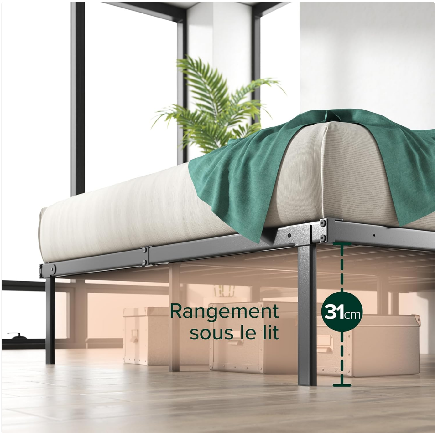
Figure 5.1: The generous 31 cm under-bed clearance provides convenient storage space.