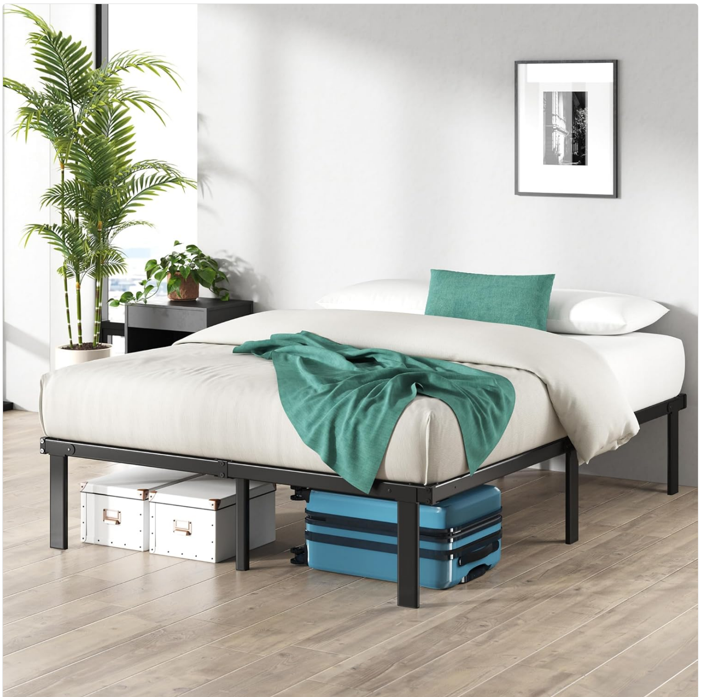
Figure 5.2: The bed frame in use, demonstrating its practical under-bed storage capabilities.