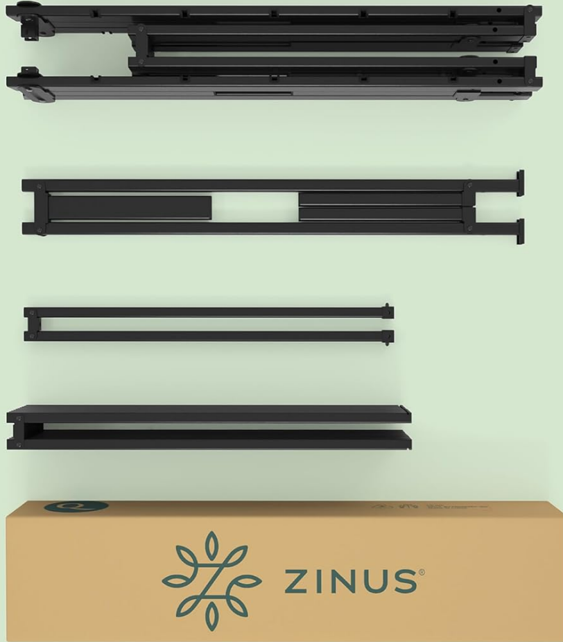
Figure 4.2: Detailed views of the foldable mechanism, secure fastening points, and slat design.