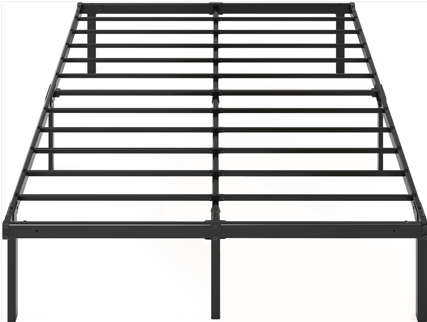
Figure 3.1: All necessary components are compactly packaged in a single box for convenient transport and setup.