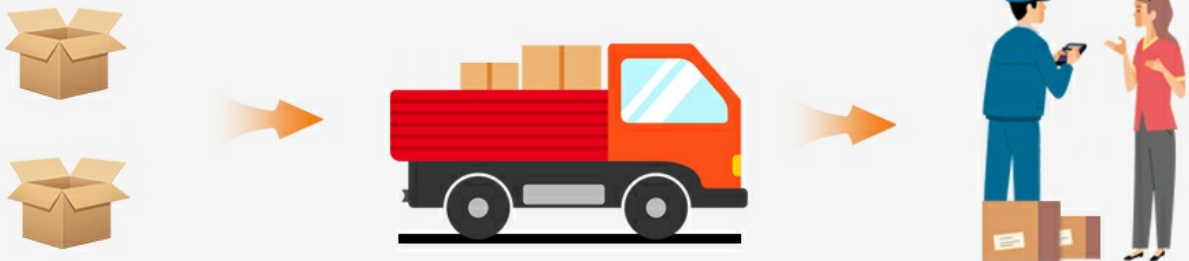
Image: Illustration showing two packages being delivered, indicating the product ships in multiple boxes.

Topic titel: Come in 2 packages, may be delivered on different days