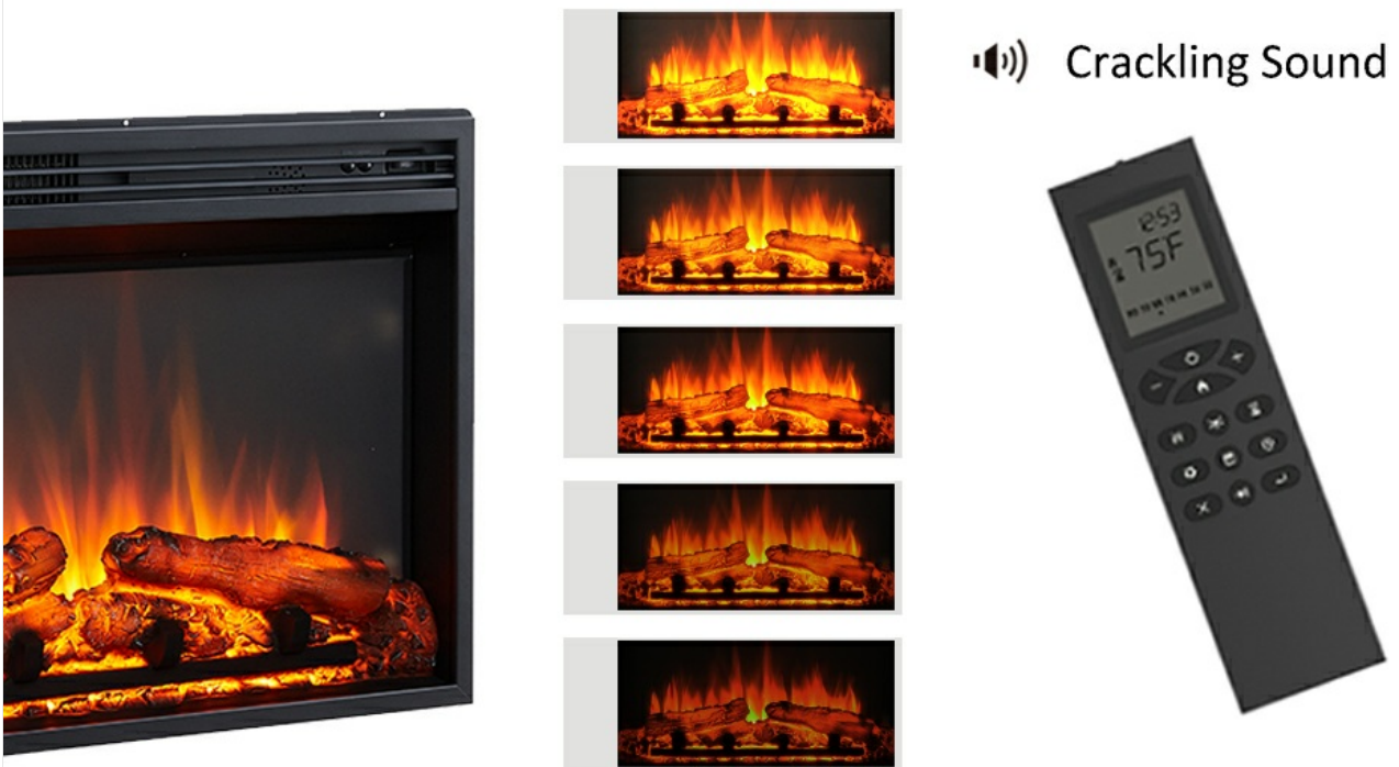
Image: The remote control and various flame brightness settings, illustrating the customizable ambiance.