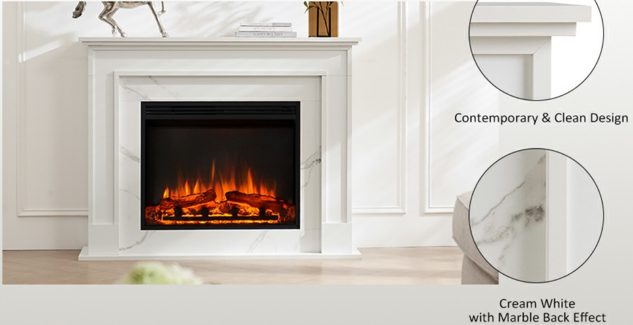
Image: Detailed view of the mantel's cream white finish and snow white marble back effect, highlighting its contemporary design.