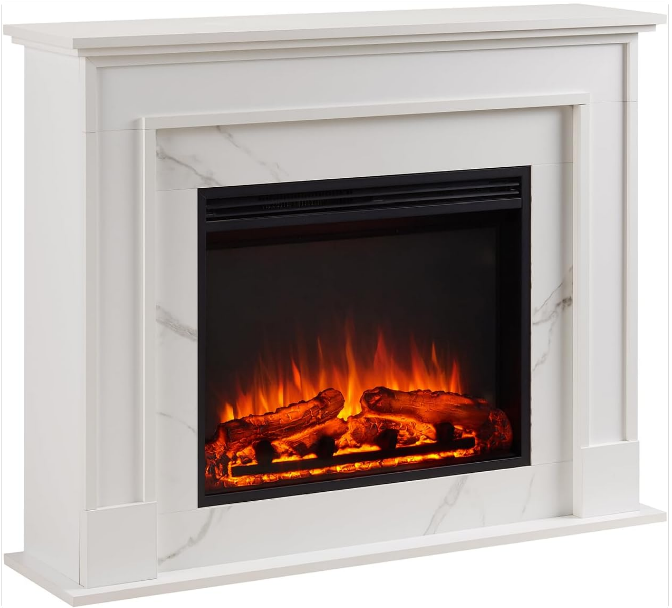
Image: The LegendFlame Cathrine Fireplace Suite fully assembled, showcasing its cream white finish and marble effect.

Once the mantel is assembled, carefully slide the 26-inch electric fireplace insert into the designated opening. Secure the insert using the provided screws and brackets as indicated in the insert's manual. Ensure the power cord is accessible for plugging into a grounded outlet.