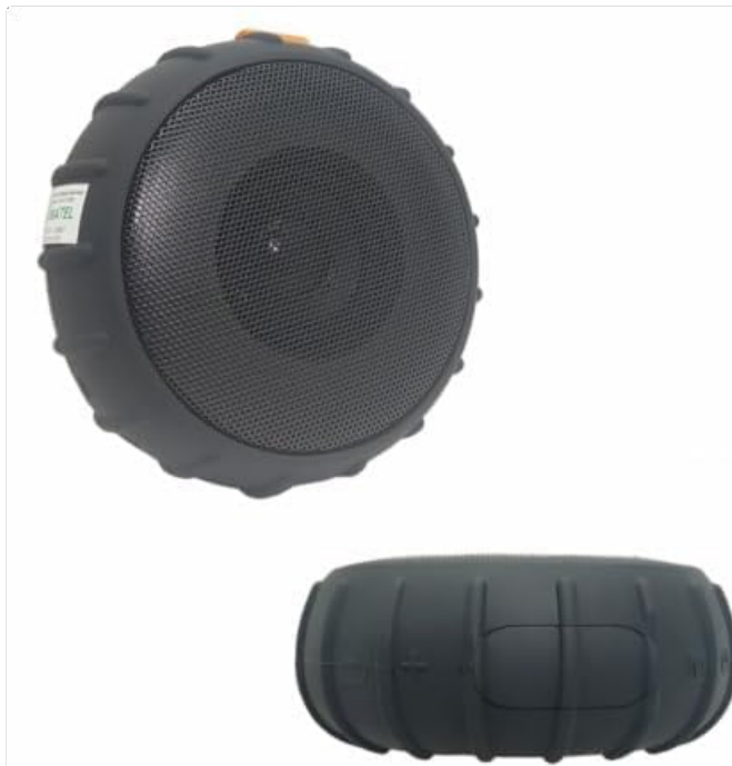
Image: Top and side views of the Kapbom KA-8506 speaker in black. The top view shows the speaker grille, while the side view displays the control buttons (+, -, and a central button) and the rugged rubberized casing.