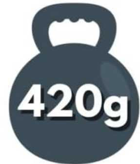
Image: Packaging box for the Kapbom KA-8506 speaker, illustrating its dimensions (13.5 cm height, 13 cm width, 6 cm depth) and a weight of 420 grams.

A caixa enviada pode ser de uma cor diferente da foto.