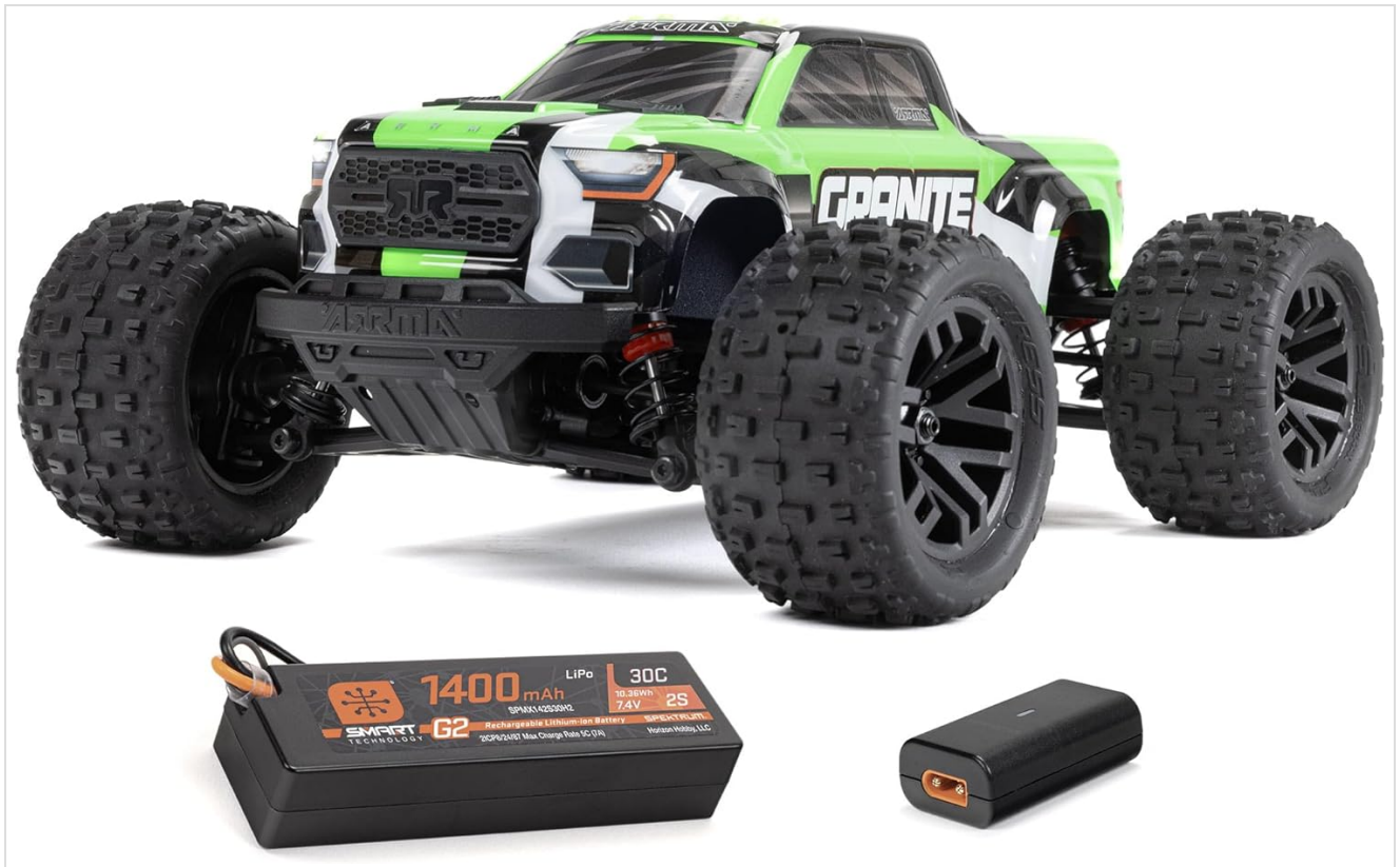
Figure 2.1: ARRMA GRANITE GROM Monster Truck with included battery and charger.