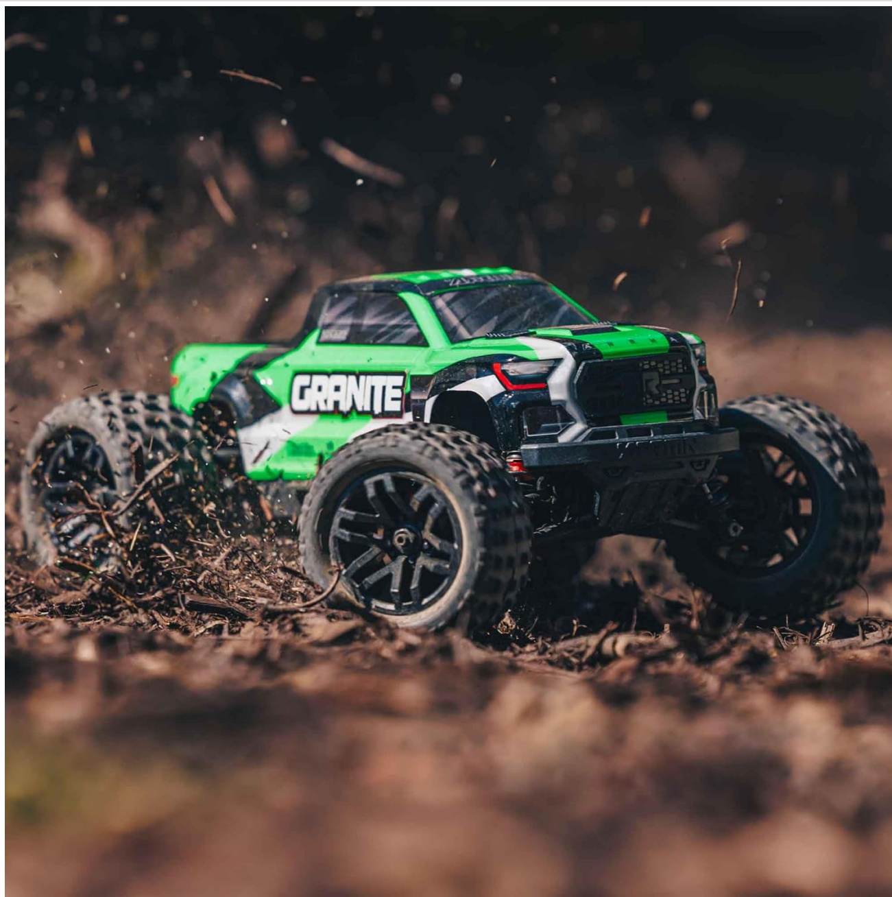
Figure 4.1: ARRMA GRANITE GROM Monster Truck in action on a dirt path.