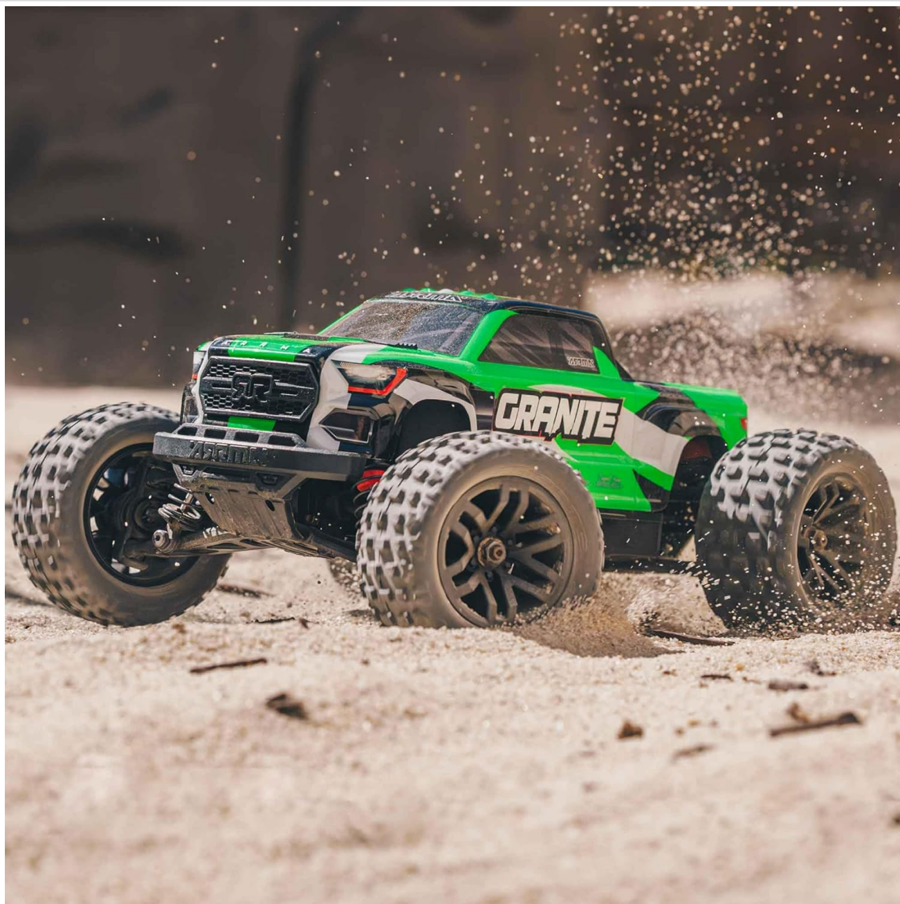
Figure 4.2: Side view of the ARRMA GRANITE GROM Monster Truck in motion.