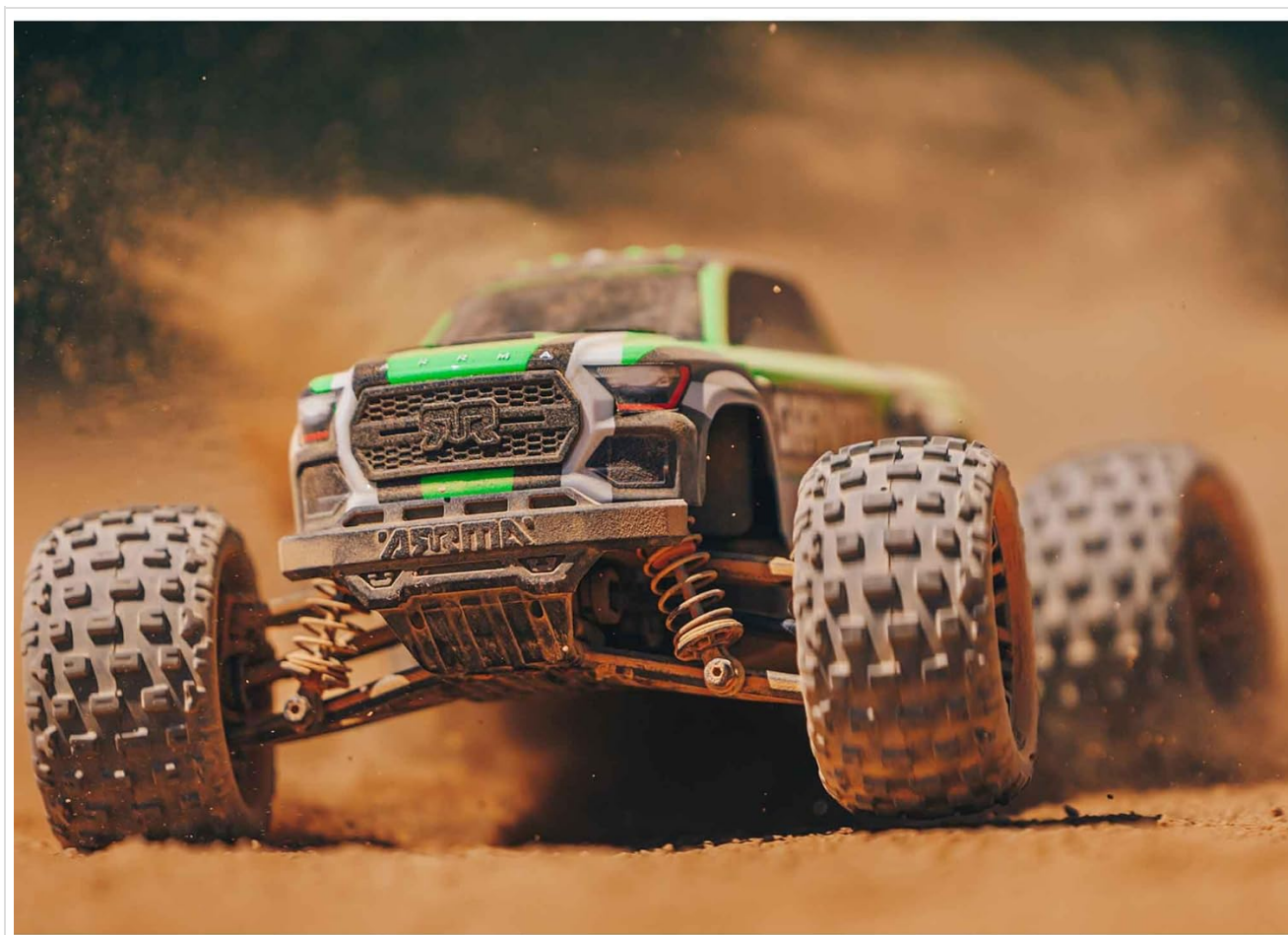
Figure 5.1: Front view of the ARRMA GRANITE GROM Monster Truck, highlighting suspension components.