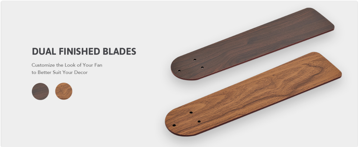
Image: The fan blades feature a dual-finished design, allowing you to choose between a dark wood or light wood appearance to match your decor.