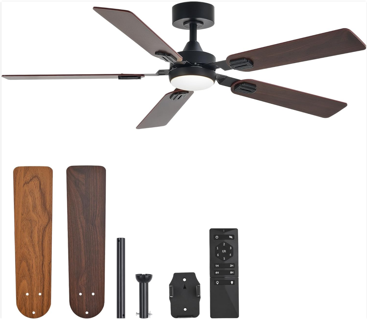
Image: All components of the VONLUCE 52-inch Ceiling Fan laid out, including the motor housing, five fan blades, two downrods (5-inch and 10-inch), remote control, and various mounting hardware.