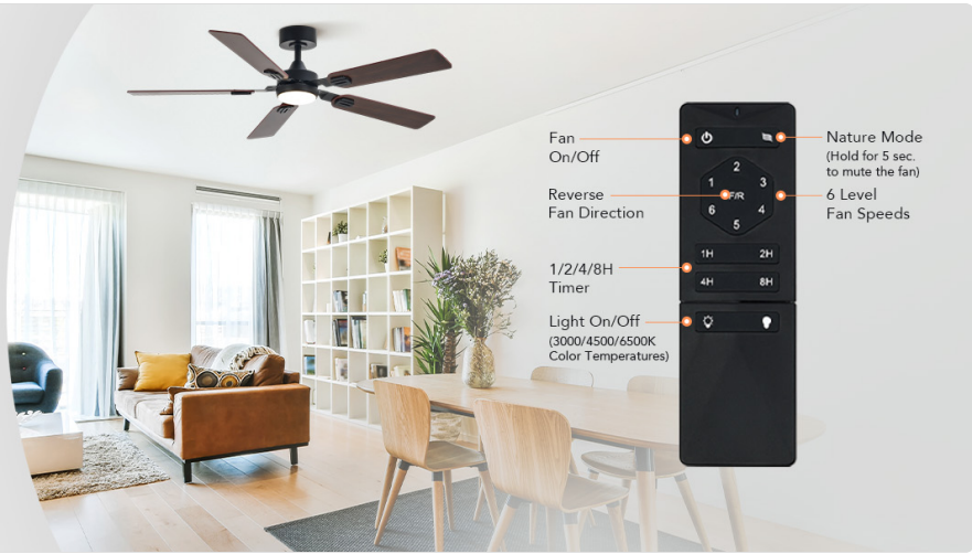
Image: The remote control for the VONLUCE ceiling fan, showing buttons for fan on/off, reverse fan direction, 6-level fan speeds, 1/2/4/8 hour timer, and light on/off with 3 CCT color temperature adjustment (3000K/4500K/6500K).