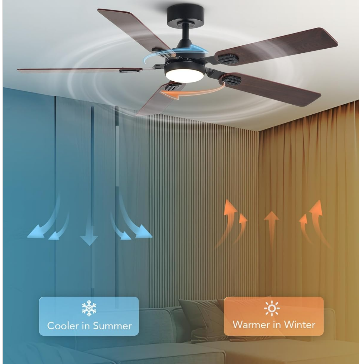
Image: This image visually explains the reversible DC motor, showing downward airflow for cooling in summer and upward airflow for circulating warm air in winter, enhancing year-round comfort.