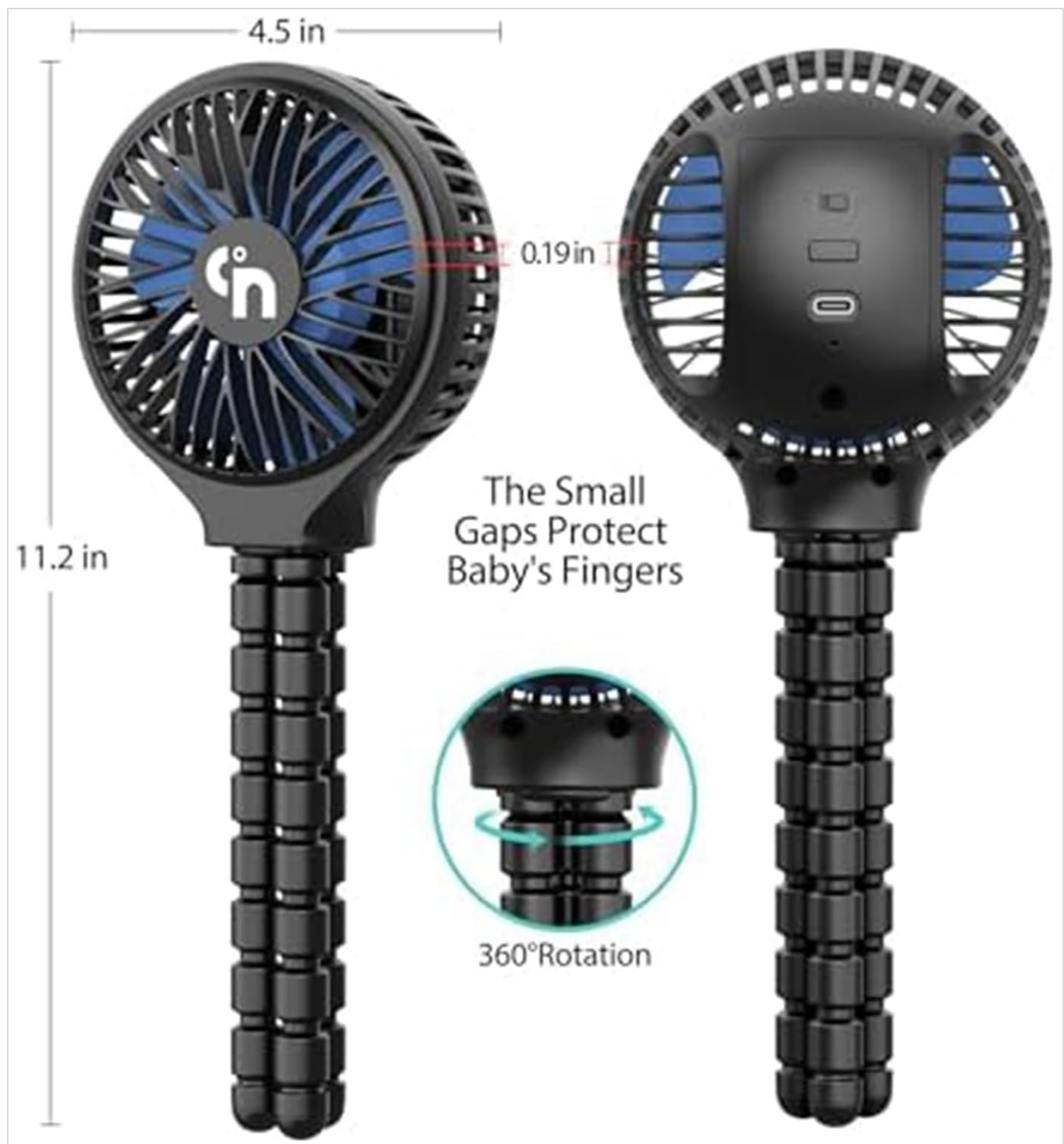
Figure 5.1: Fan dimensions, finger protection, and 360° rotation capability.