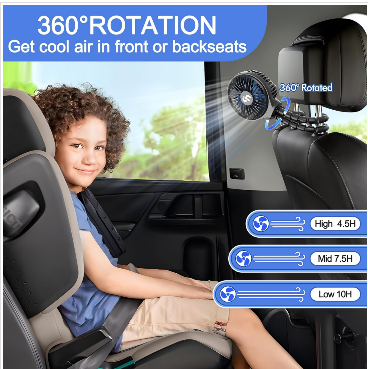
Figure 5.2: Fan attached to a car seat, highlighting 360° rotation and battery life at different speeds.