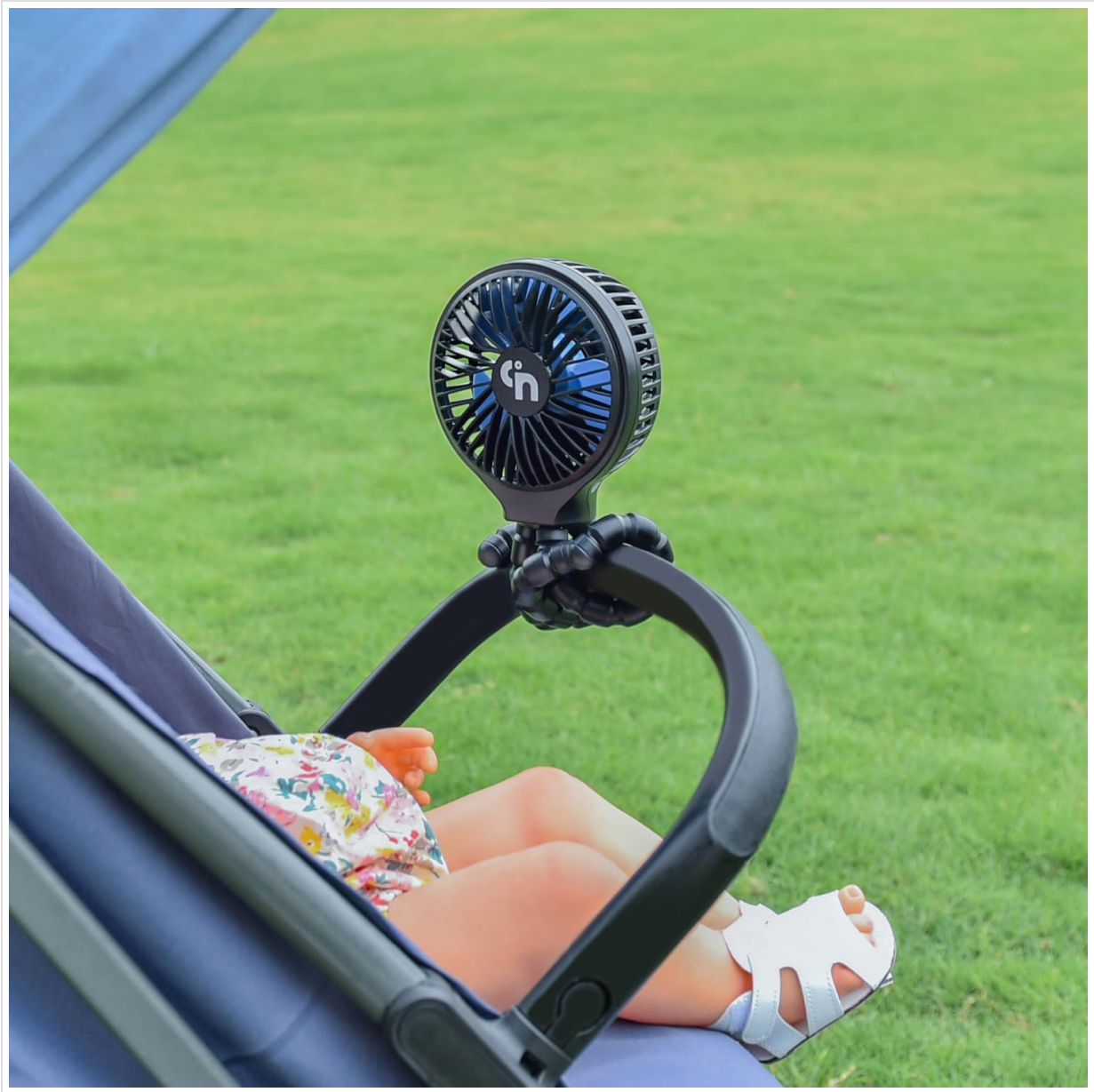
Figure 4.1: The fan's flexible legs wrapped around a stroller handle for secure attachment.