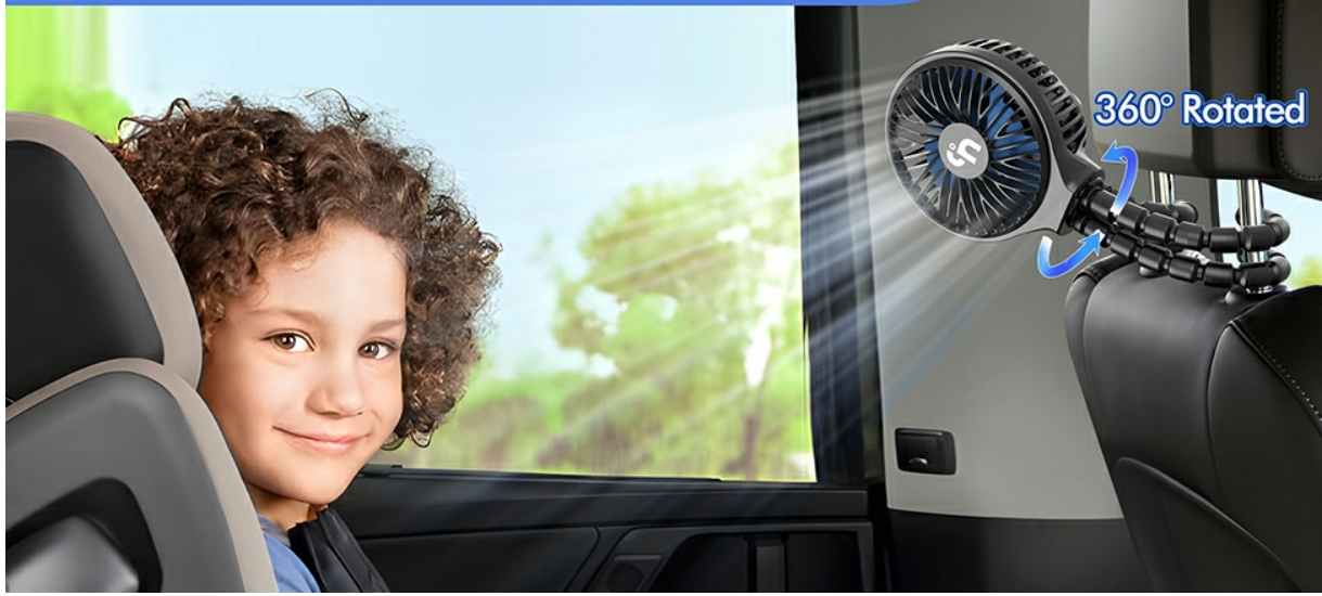
Figure 2.2: Multiple applications of the WEGA Stroller Fan, including stroller, desk, handheld, treadmill, and car seat use.