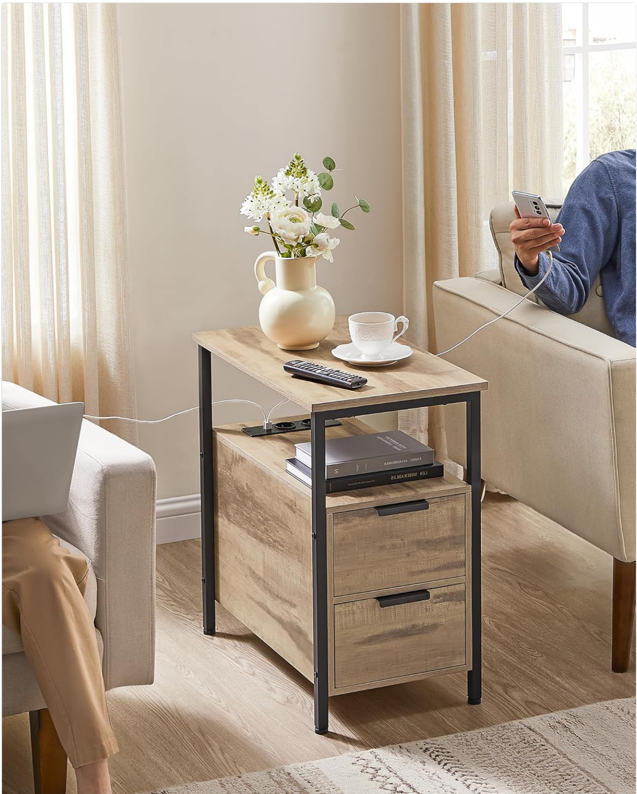
Image: Overview of the VASAGLE Side Table, showcasing its design and features in a living room setting.