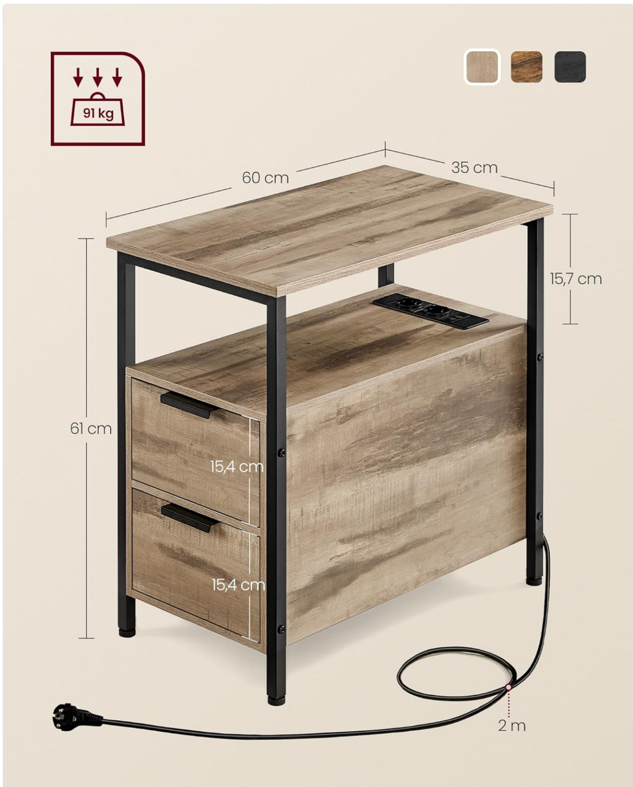
Image: Detailed dimensions of the side table, including overall height, width, depth, and drawer/shelf