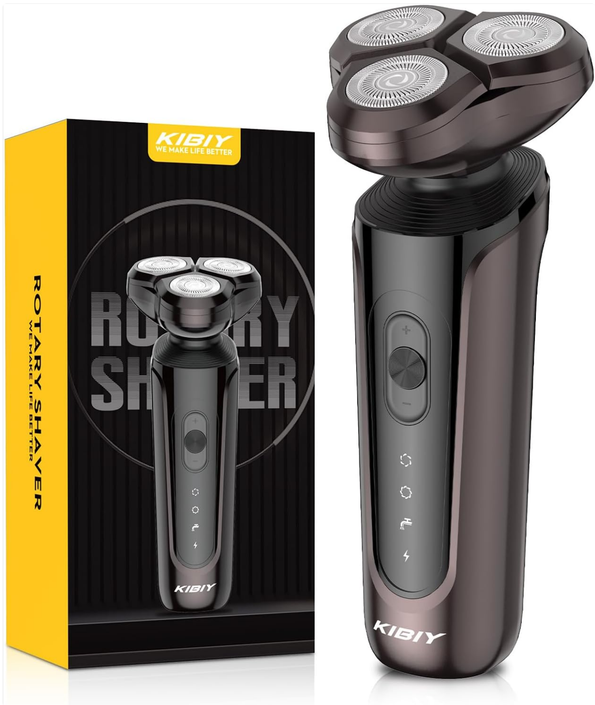
Figure 1.1: Kibiy Electric Shaver MS-308 and its retail packaging.