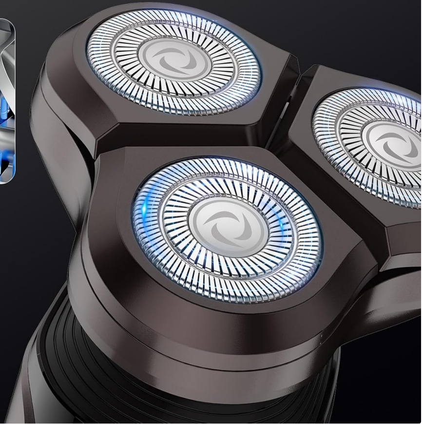
Figure 2.2: Dual-ring blades for enhanced shaving efficiency.