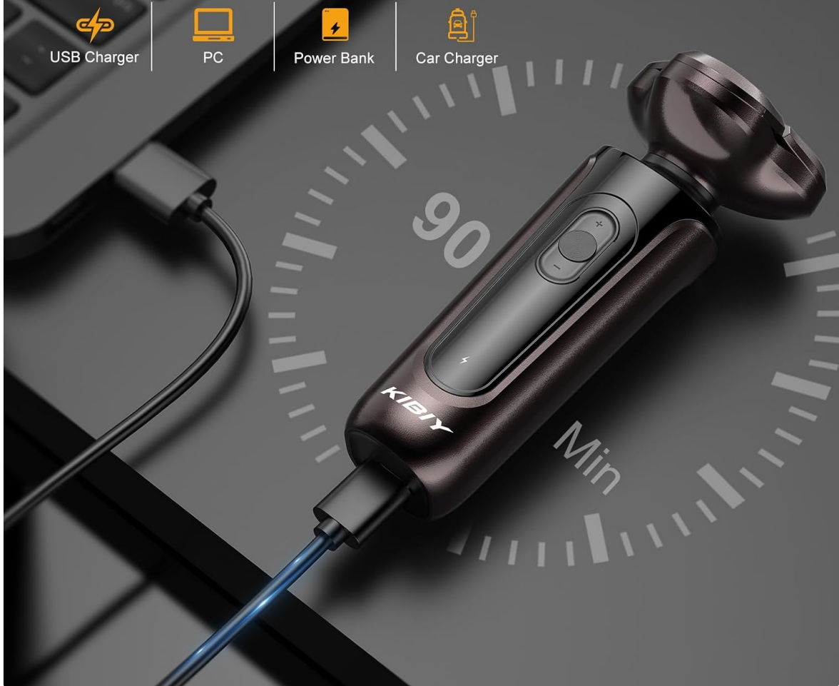
Figure 2.5: The shaver features a long-lasting battery and USB-C charging.

One fully charge enjoy up to 3 months of shaving convenience.