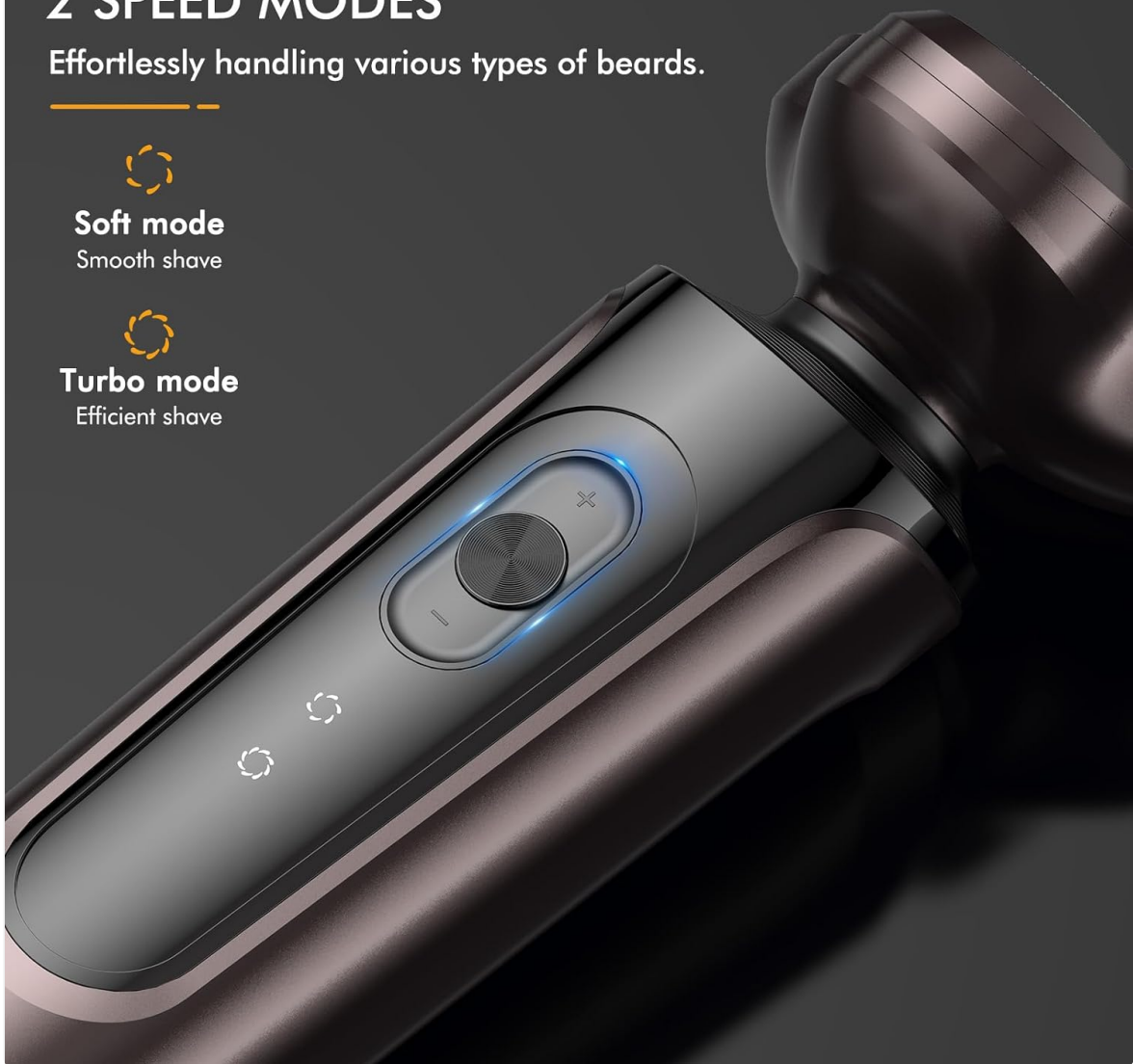
Figure 2.4: Control panel indicating Soft and Turbo speed modes.