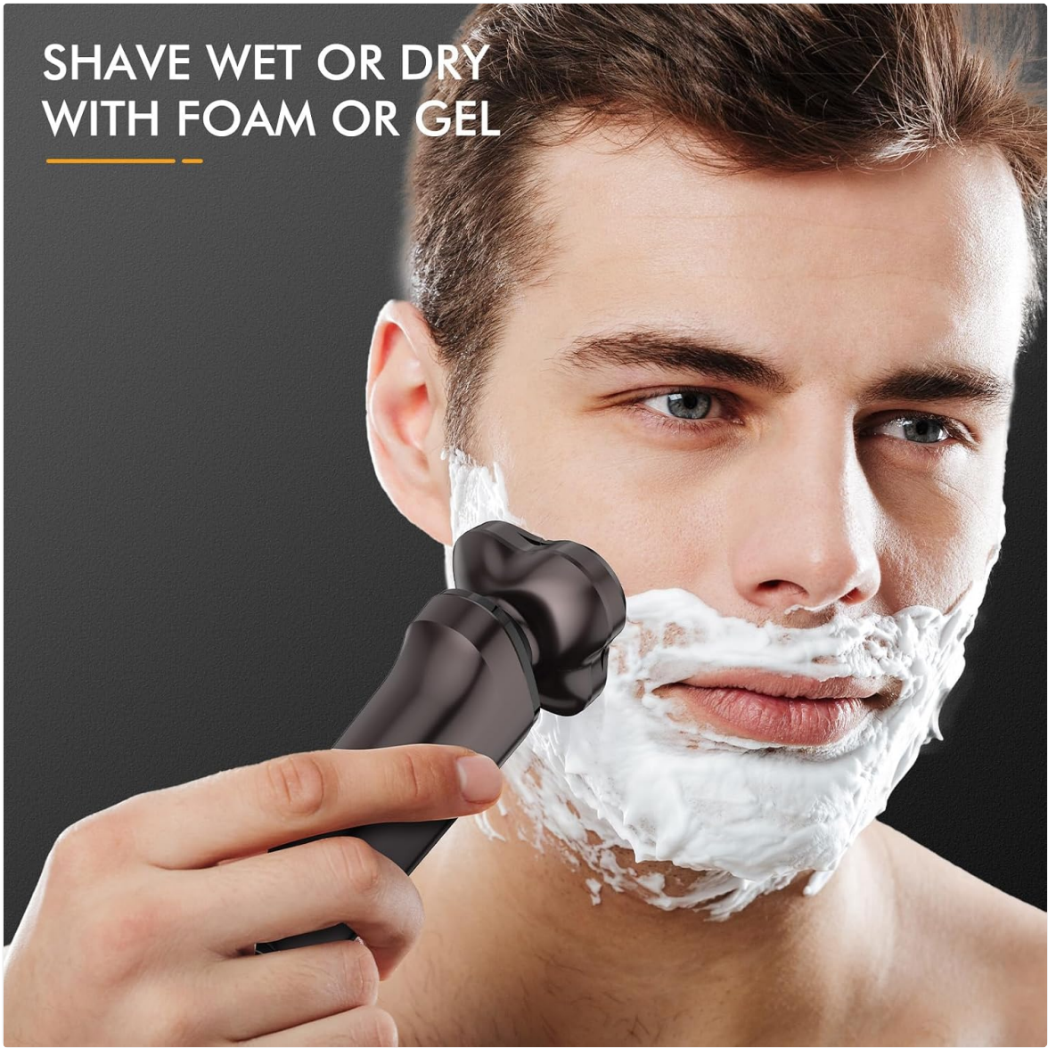
Figure 2.3: The shaver is suitable for both wet and dry use.