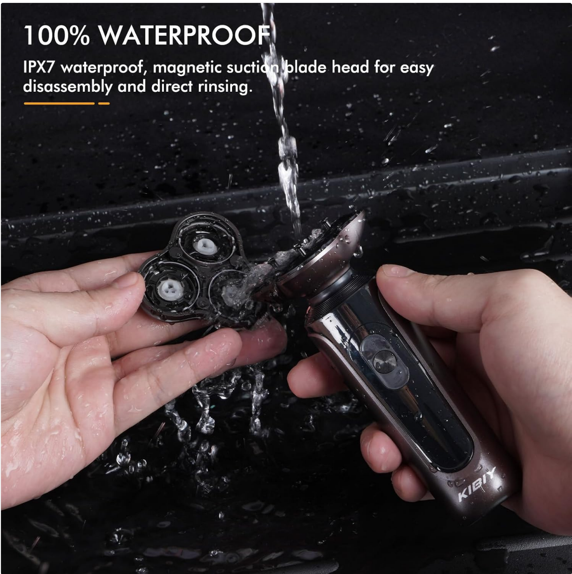
Figure 2.6: The shaver is IPX7 waterproof for easy cleaning.

IPX7 waterproof, magnetic suction blade head for easy disassembly and direct rinsing.